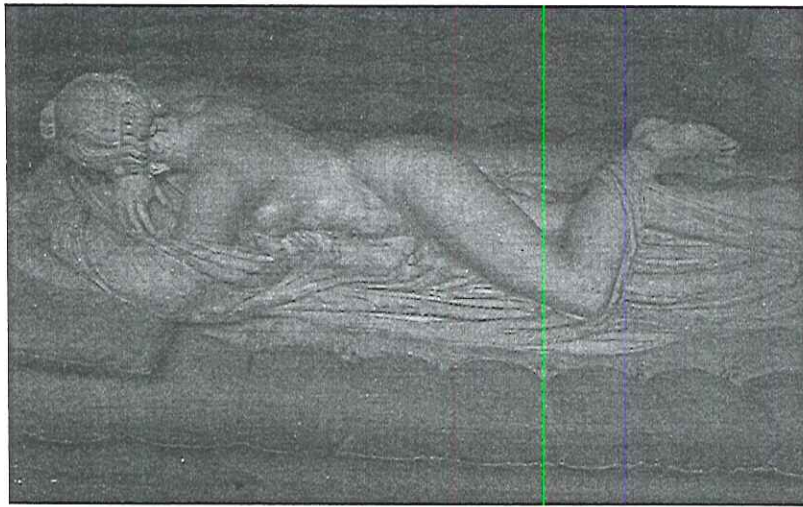
FIGURE 2.1: Sleeping hermaphrodite, Roman second century B. C.