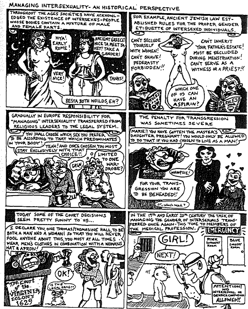
FIGURE 2.3: A cartoon history of intersexuality.

But patients, troubling and troublesome patients, continued to place themselves squarely in the path of such oversimplification. Even during the Age of Gonads, medical men sometimes based their assessment of sexual identity on the overall shape of the body and the inclination of the patient—the gonads be damned. In 1915, the British physician William Blair Bell publicly suggested that sometimes the body was too mixed up to let the gonads alone dictate treatment. The new technologies of anesthesia and asepsis made it possible for small tissue samples (biopsies) to be taken from the gonads of