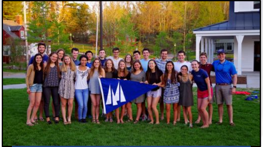
2017/2018 Middlebury Sailing Team