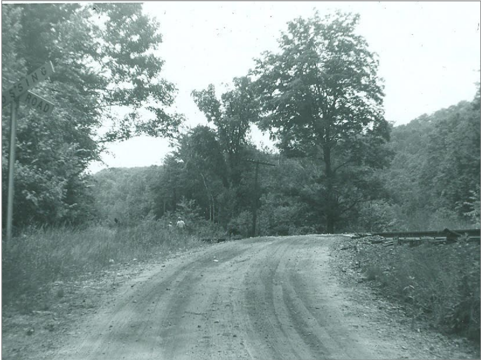
East View at 2nd Crossing South of Gassetts