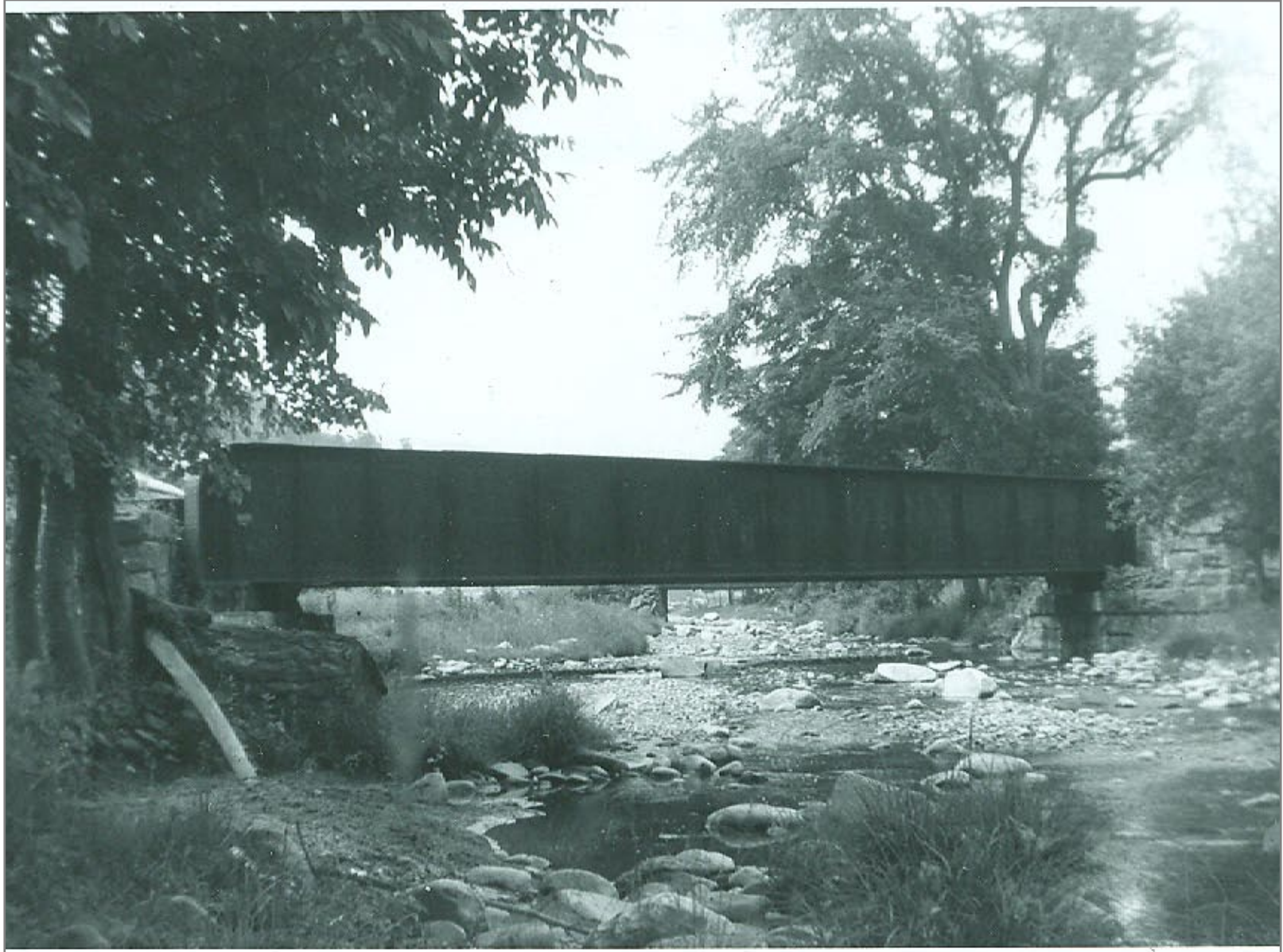
Bridge 125 Looking West