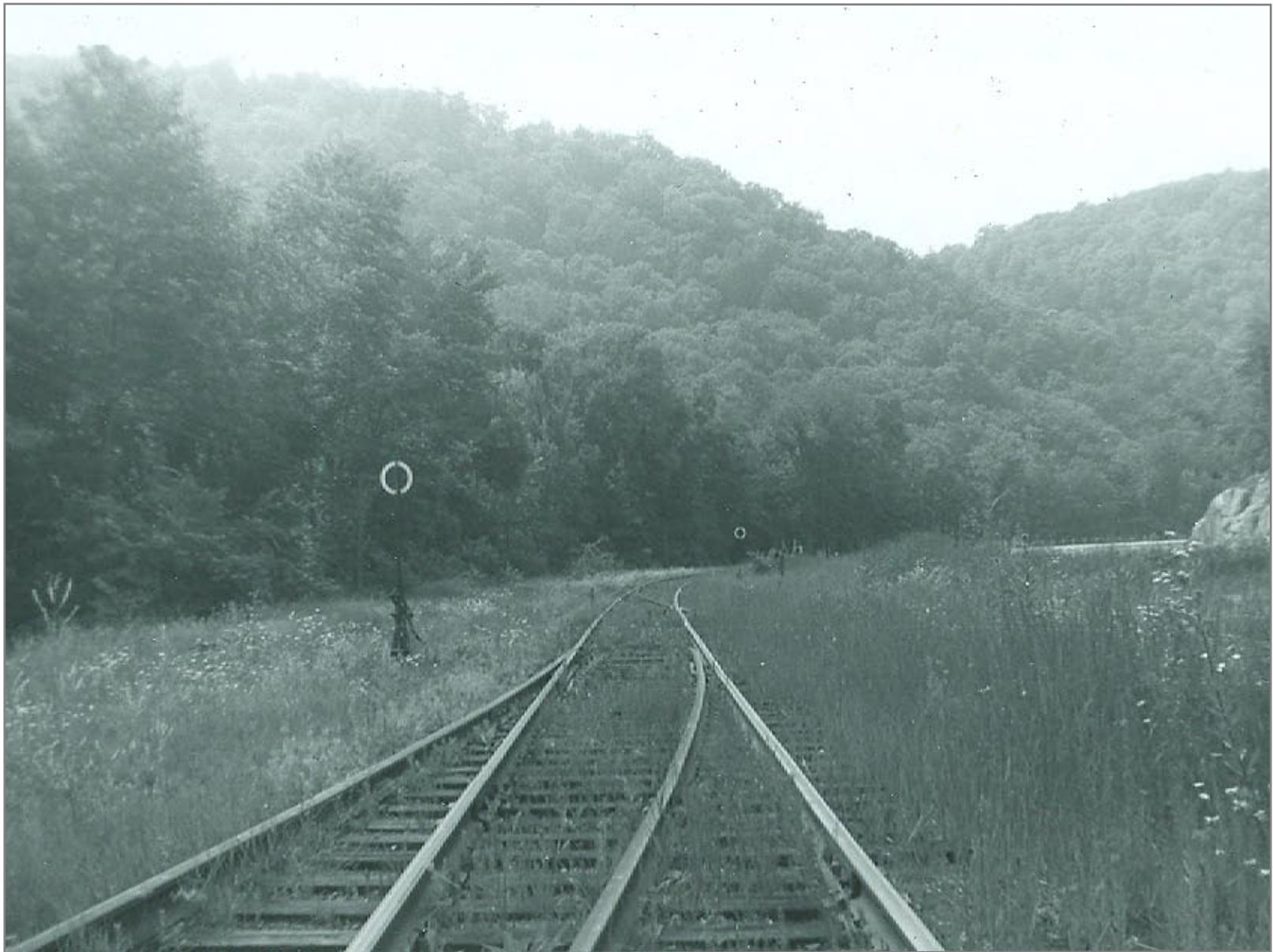
Northbound Just North of Toolhouse in Gassetts