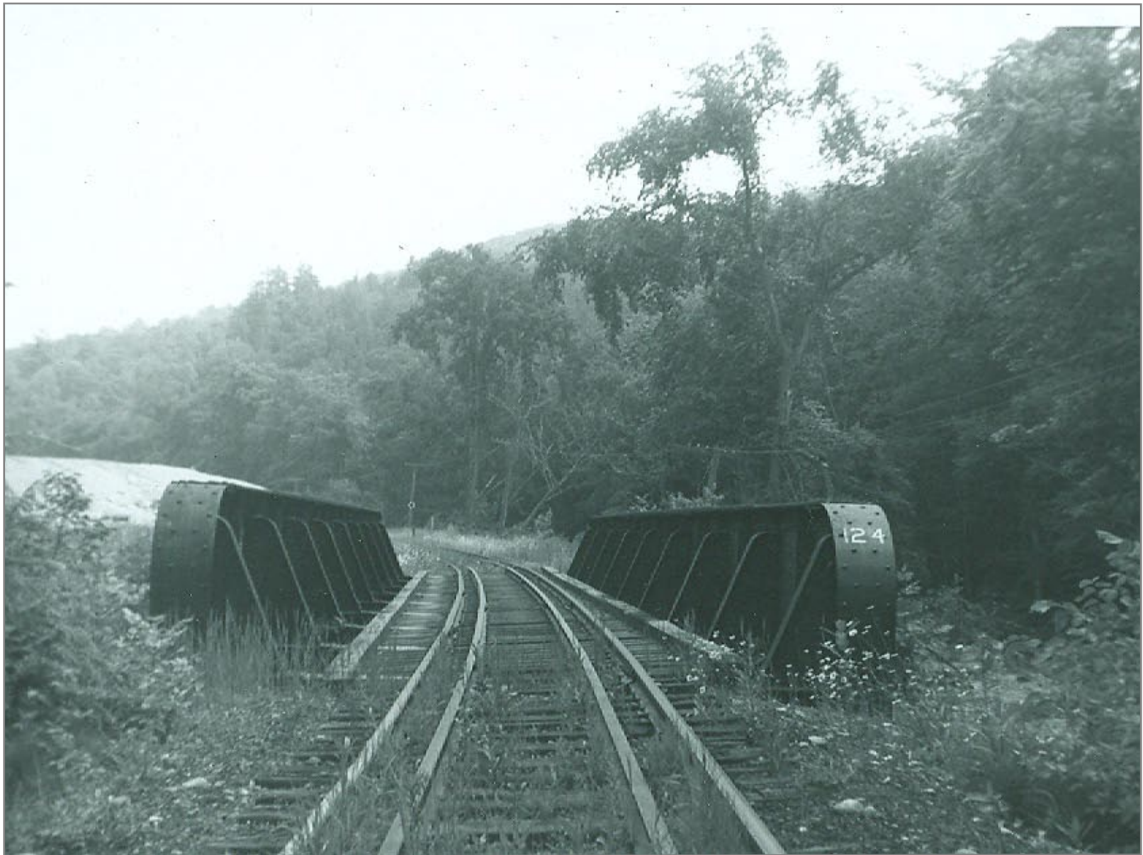
Bridge 124 Southbound