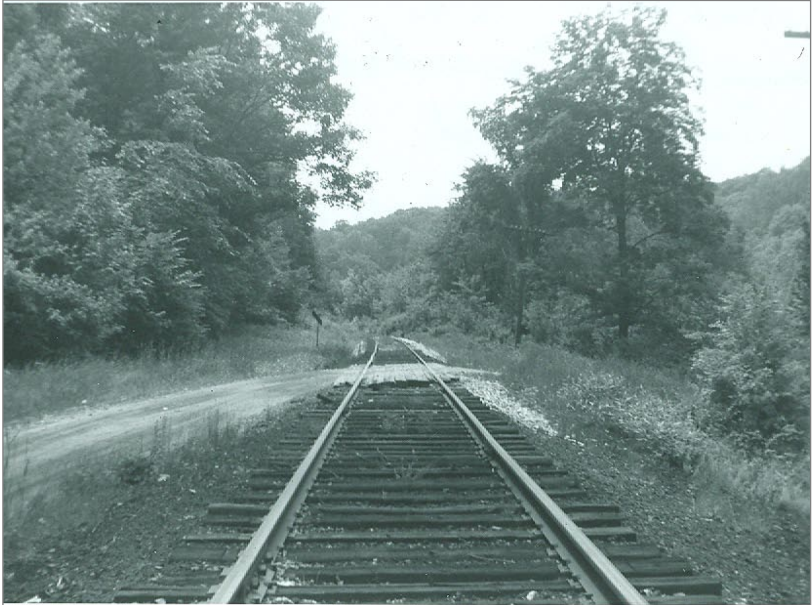
2nd Crossing South of Cavendish Southbound