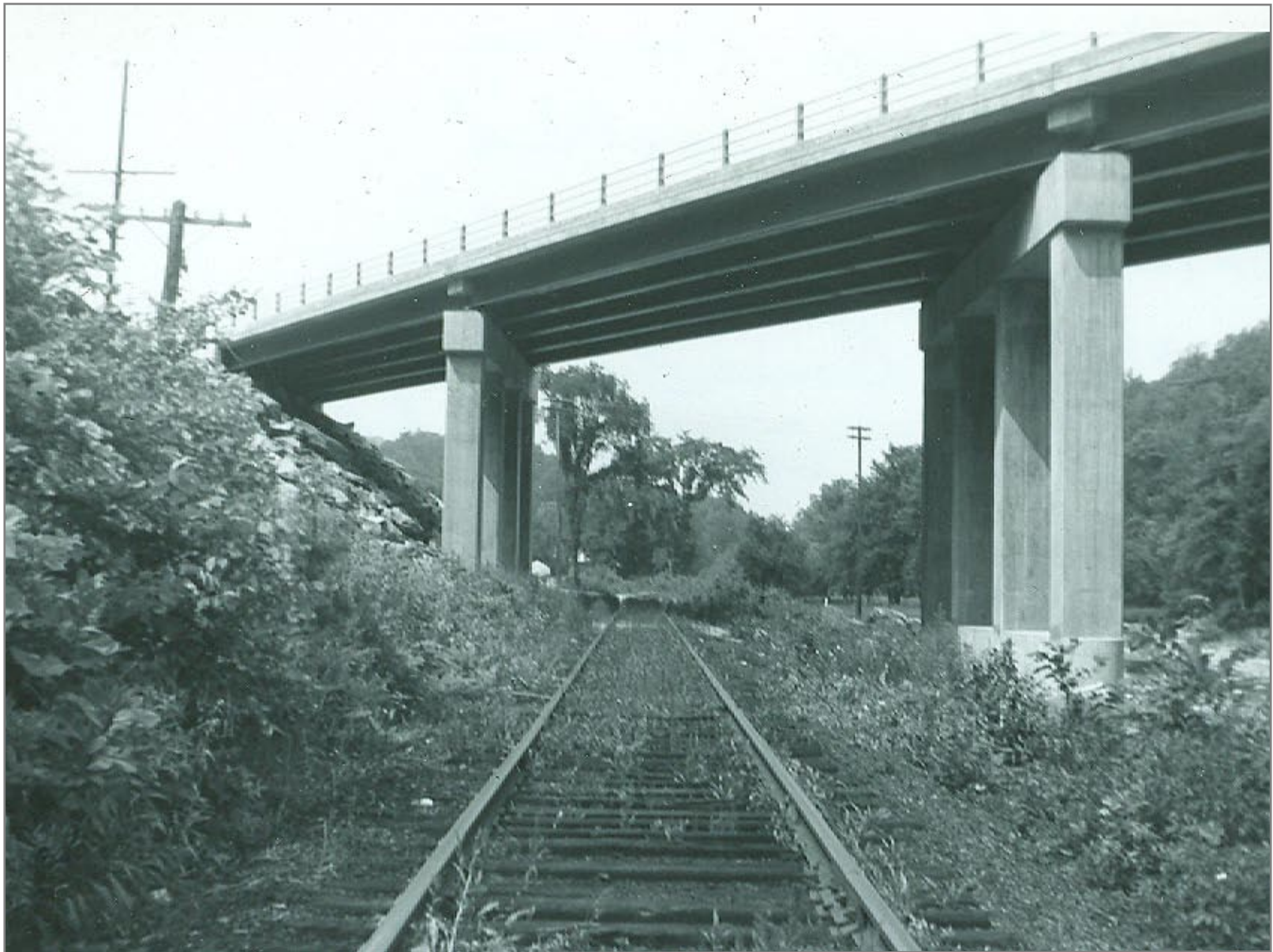
Northbound at 103