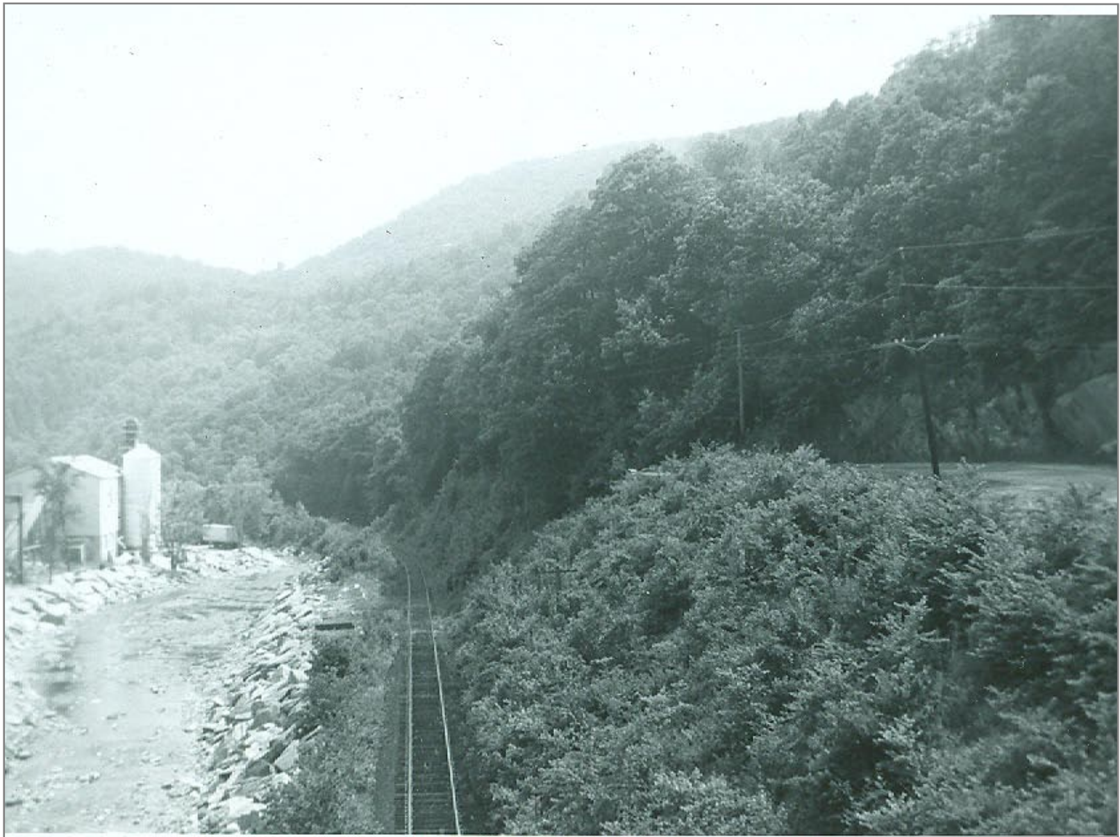
Southbound Looking from 103 highway bridge