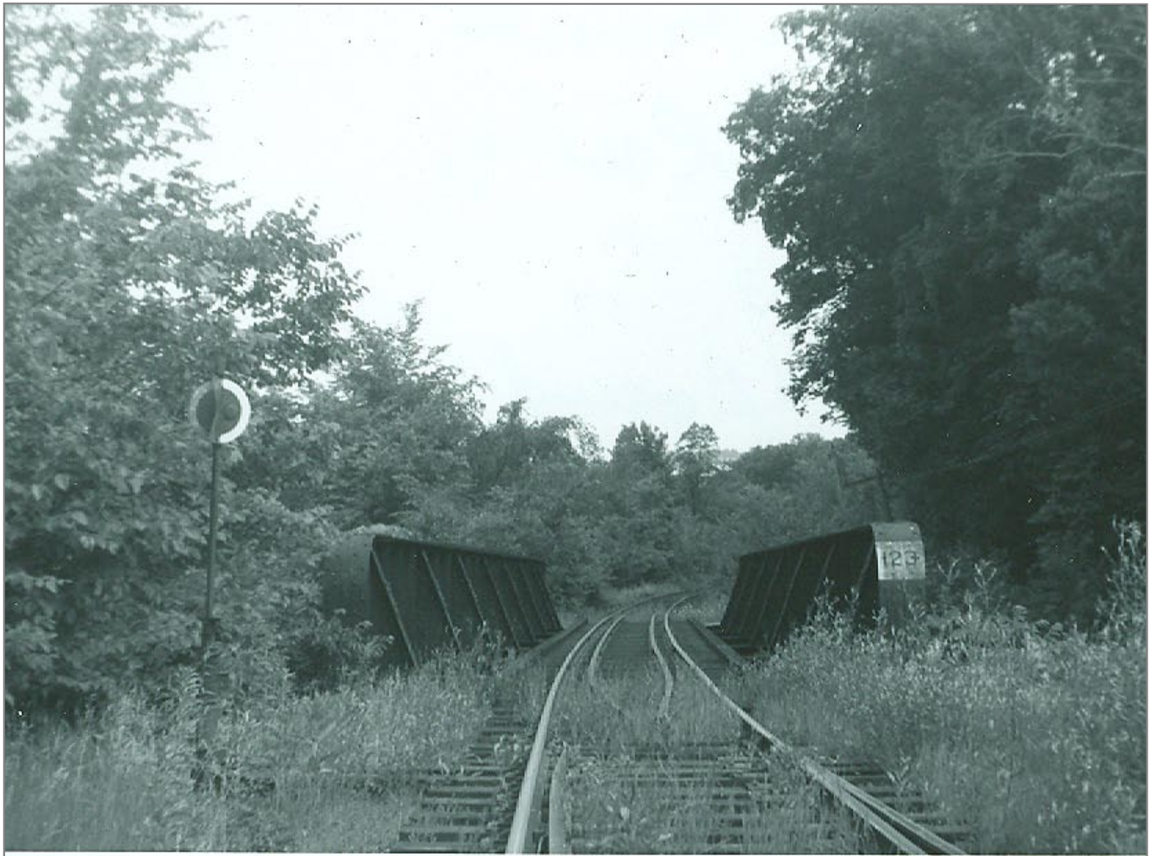
Bridge 123 Southbound