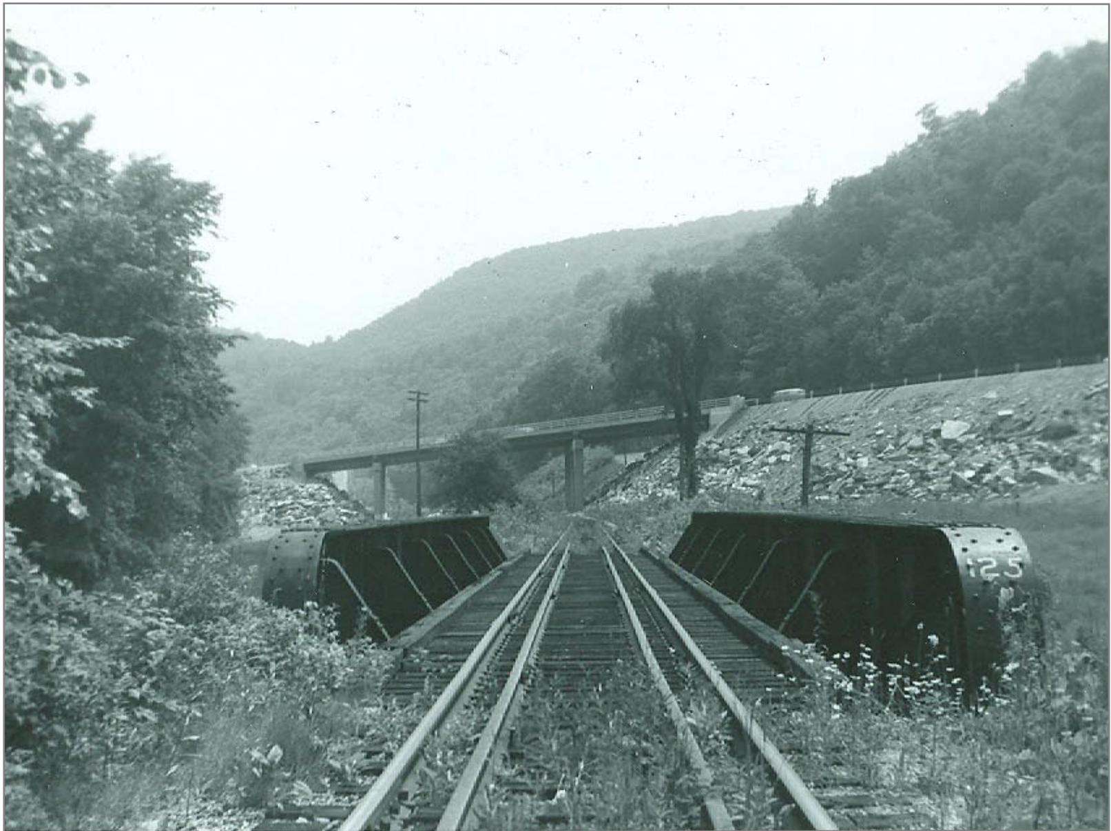
Bridge 125 Southbound Route 103 in rear