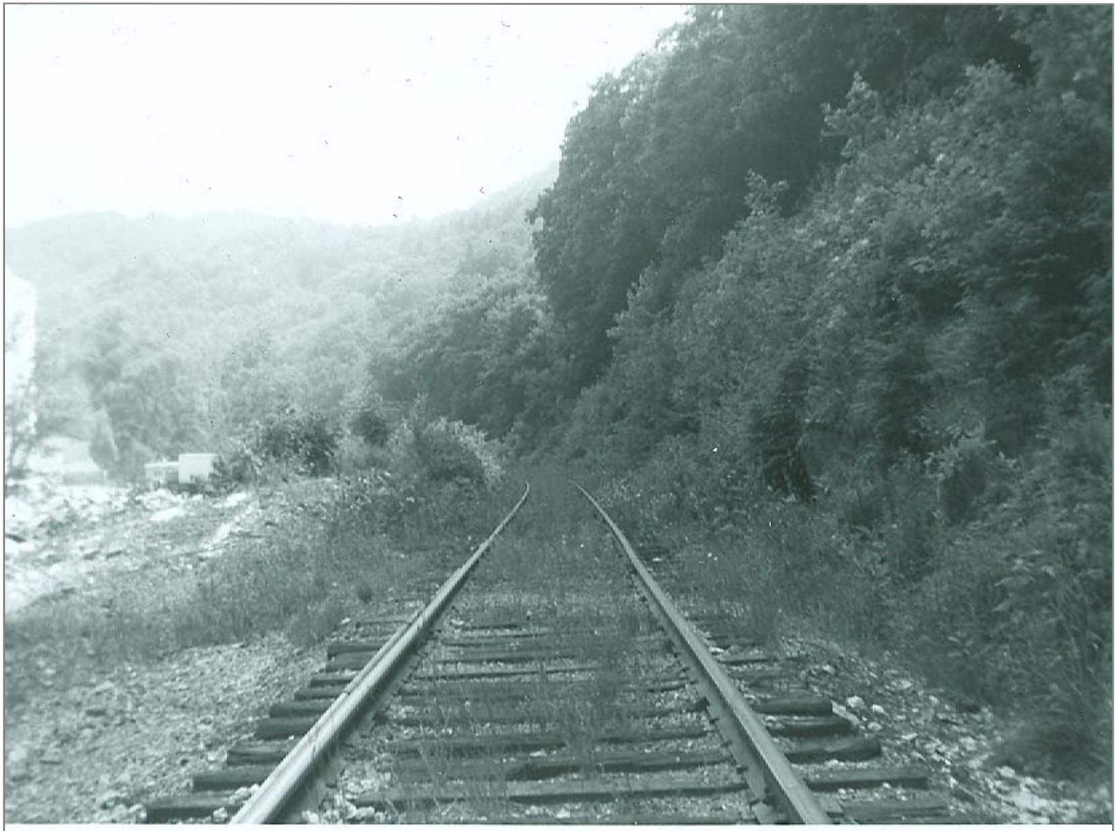
Southbound Lime Plant on left