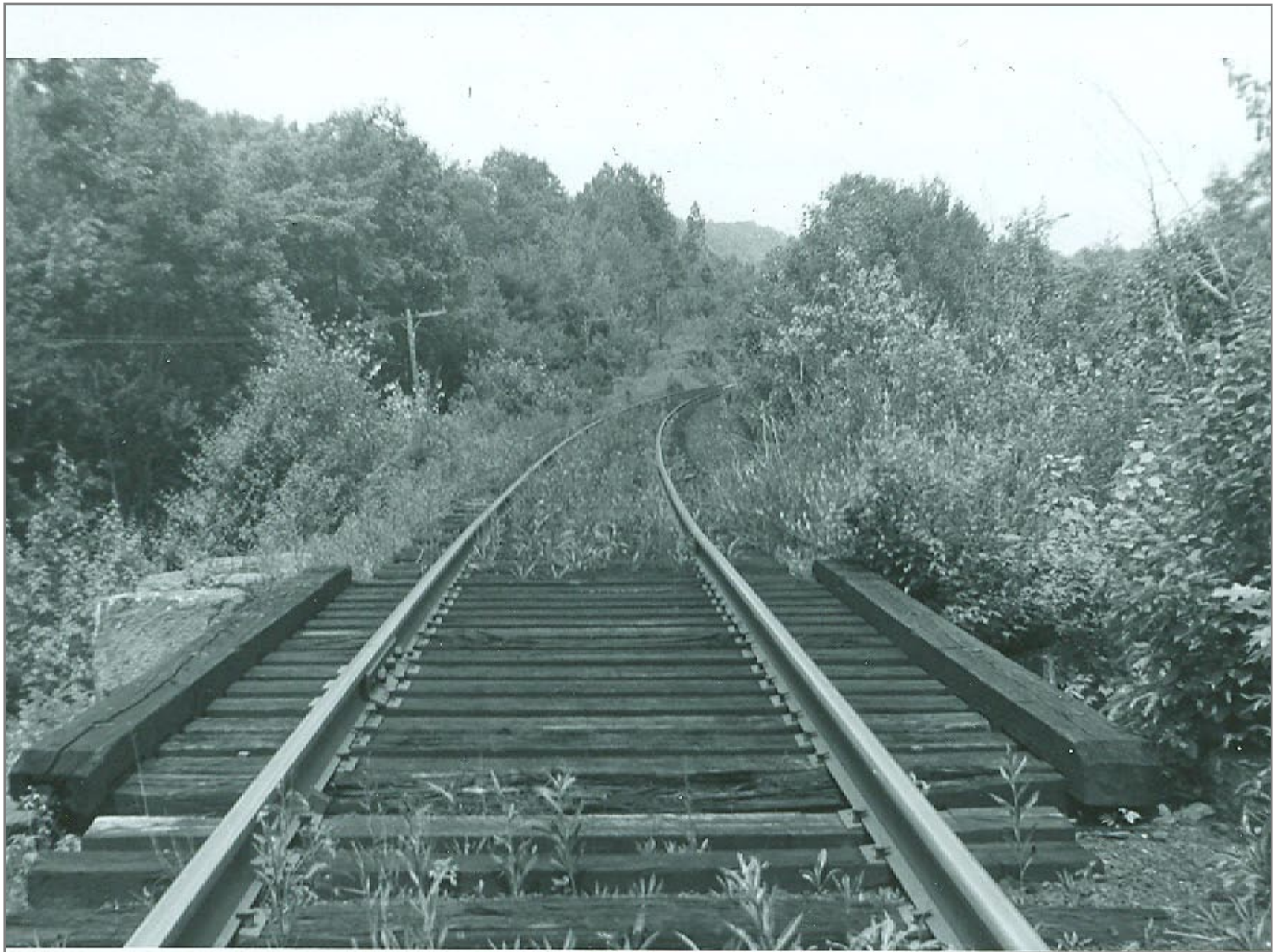
Bridge 126 Northbound