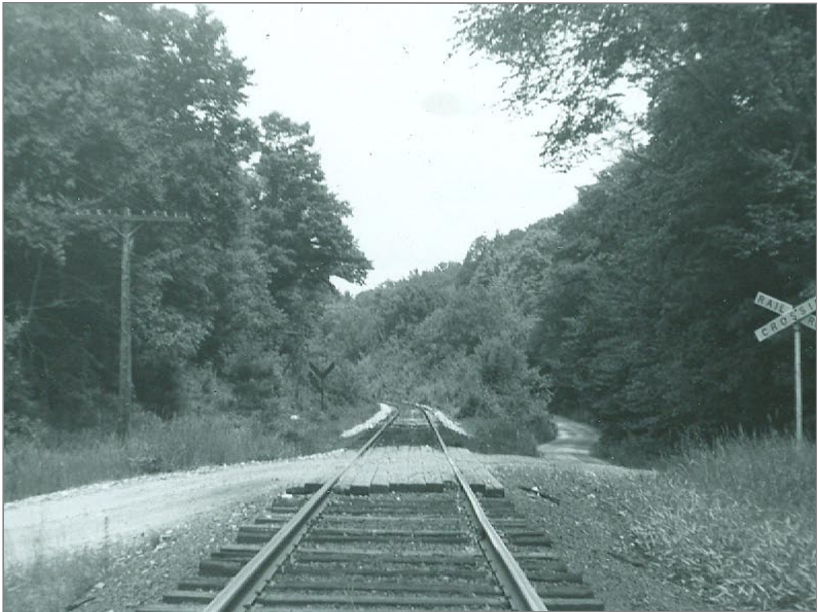
2nd Crossing South of Cavendish Northbound