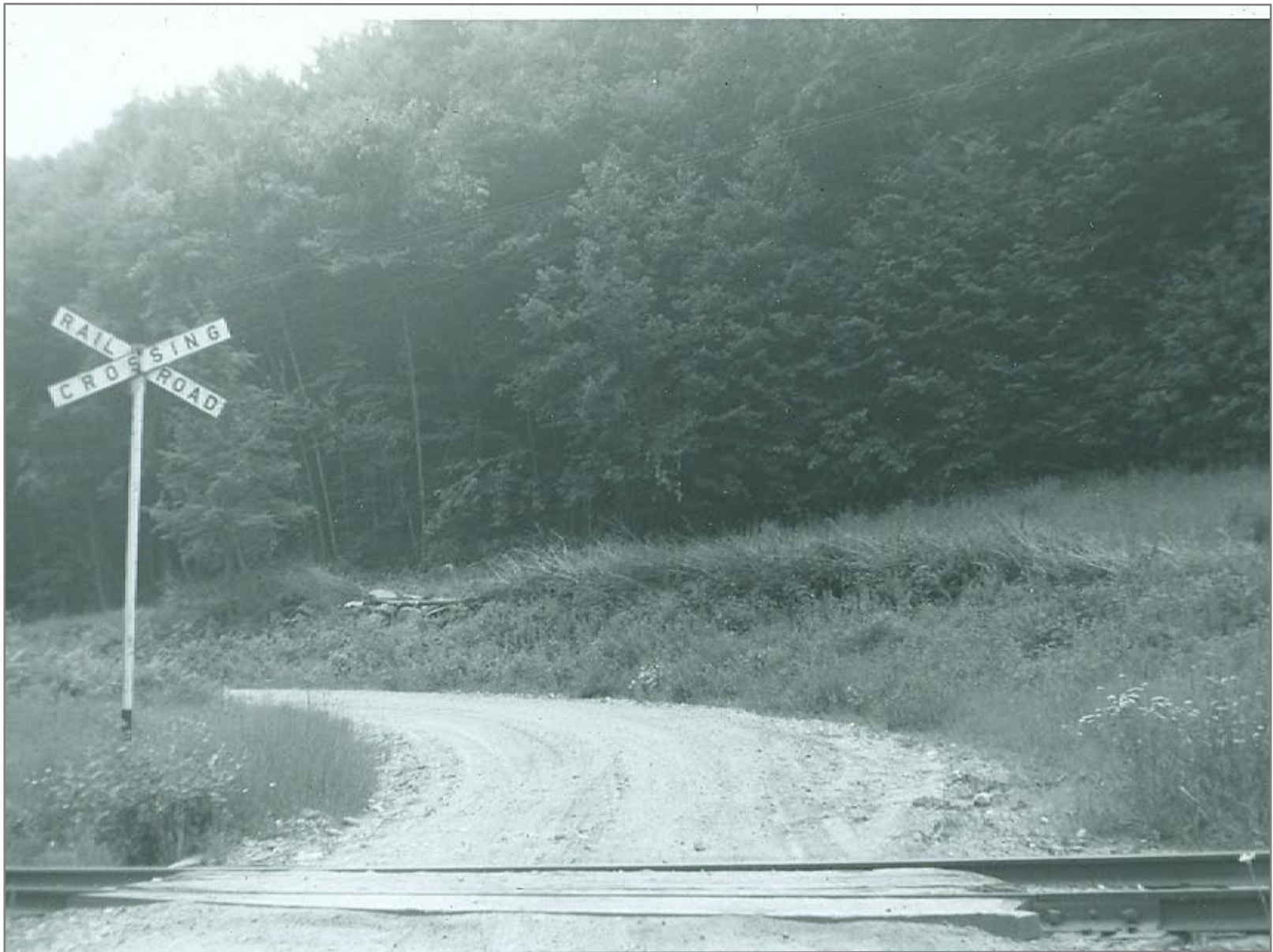
Crossing just north of MP 19