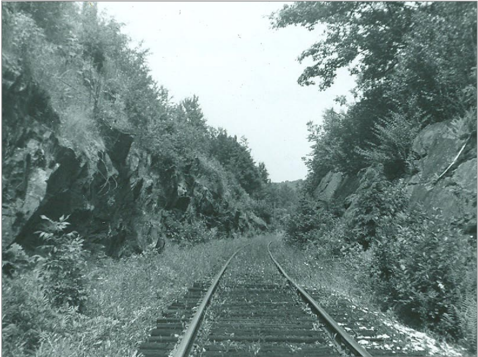
Northbound 3rd Crossing South of Cavendish