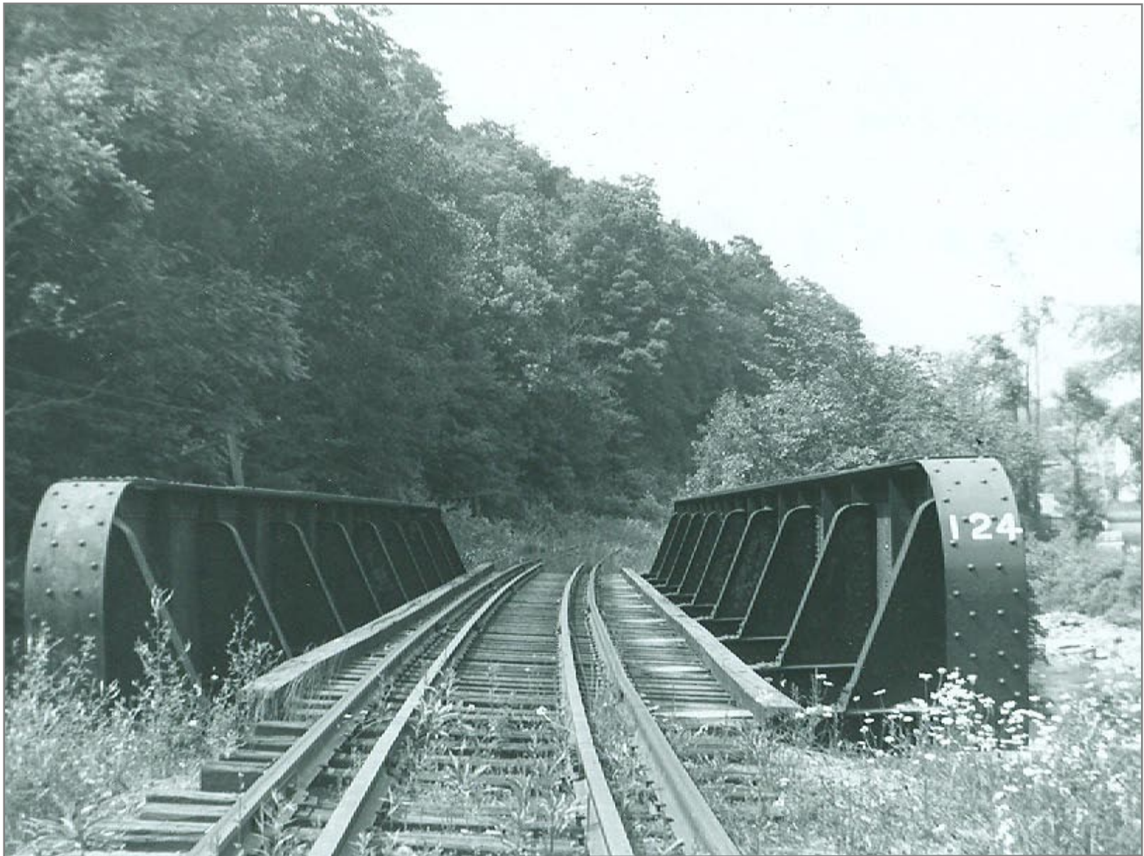
Bridge 124 Northbound