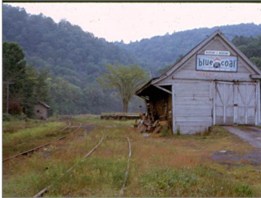
Poulin Collection - Gassetts