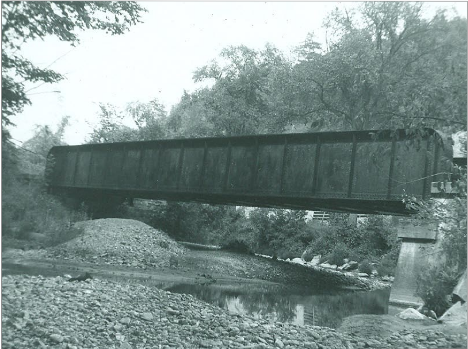
Bridge 124 American Bridge Company 1903