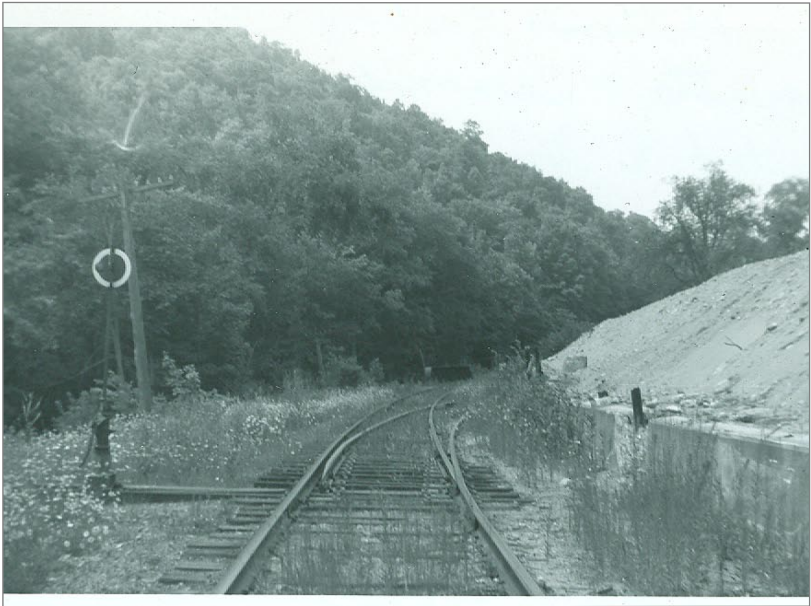
Switch to gravel pit Northbound Bridge 124 in distance