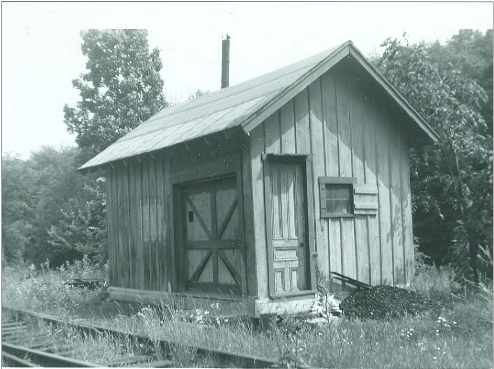
Toolhouse north of Gassetts Station almost opposite MP 18 7/8/62