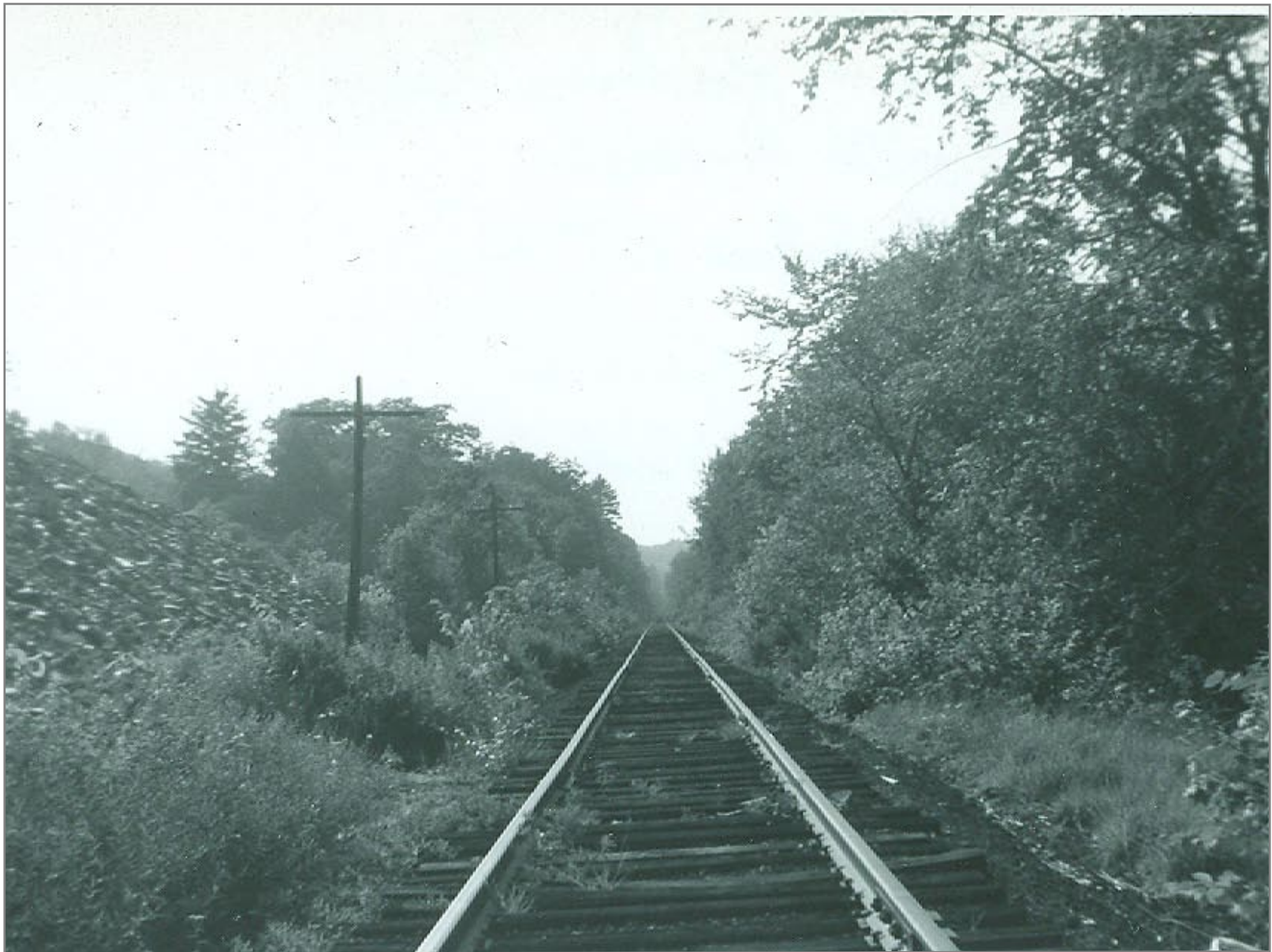
Northbound out of Gassetts