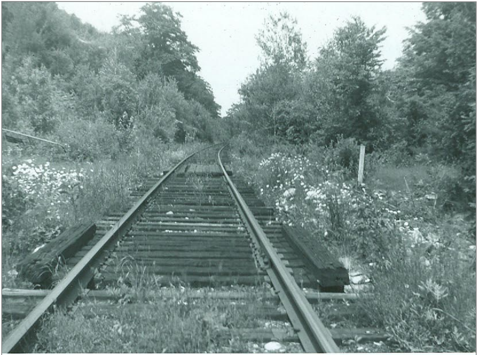
Southbound MP 19.8