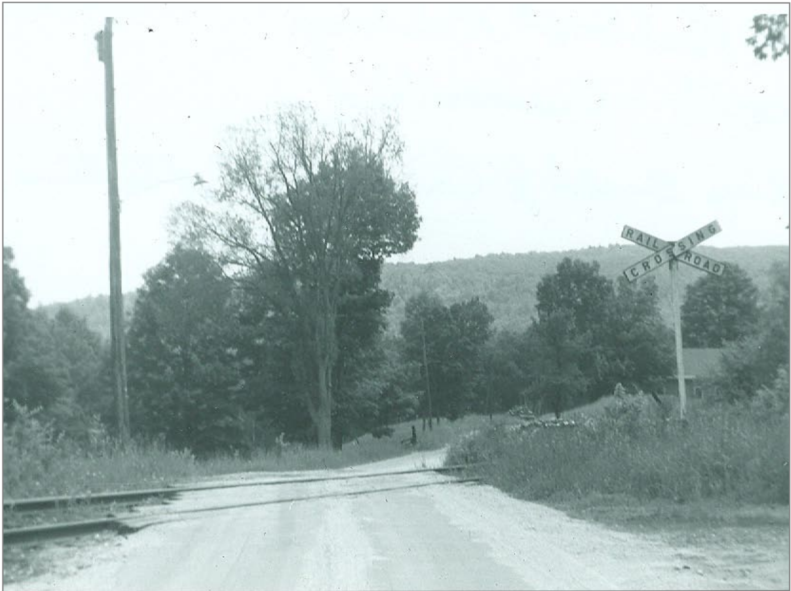
1st Crossing South of Cavendish