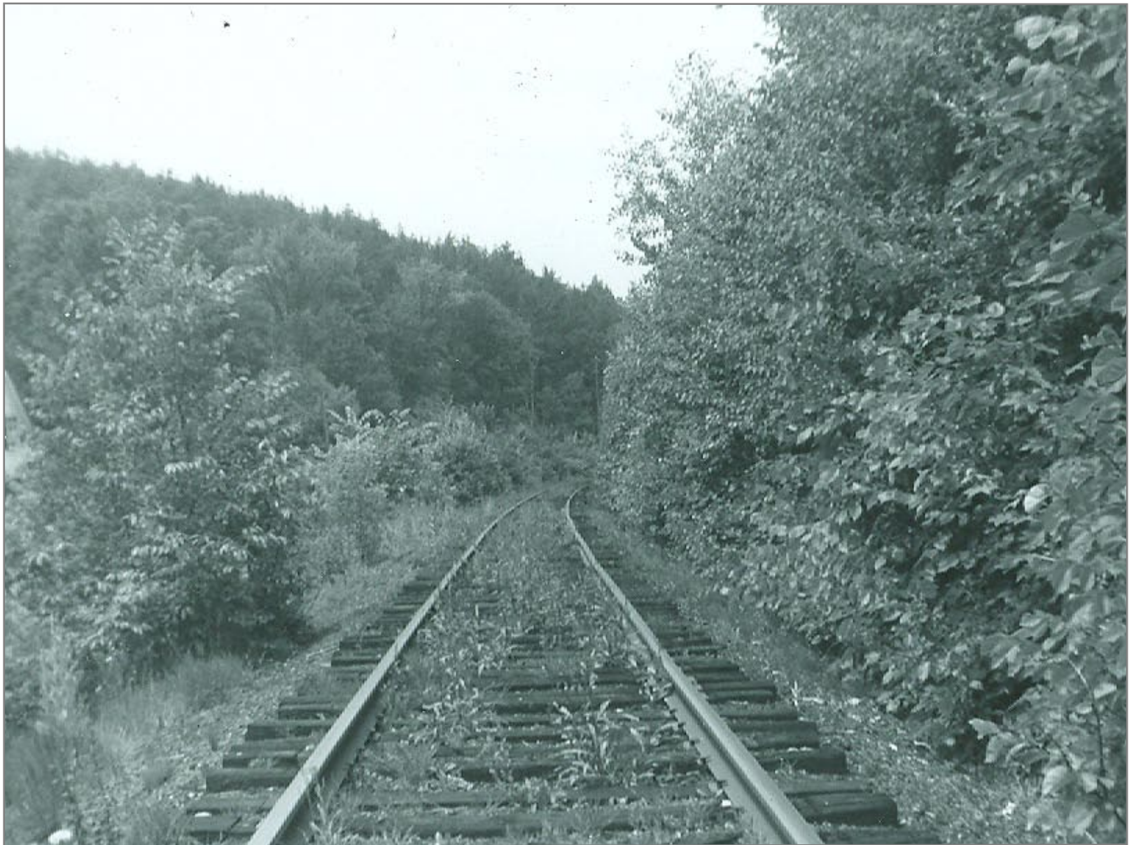
Northbound just south of Cavendish