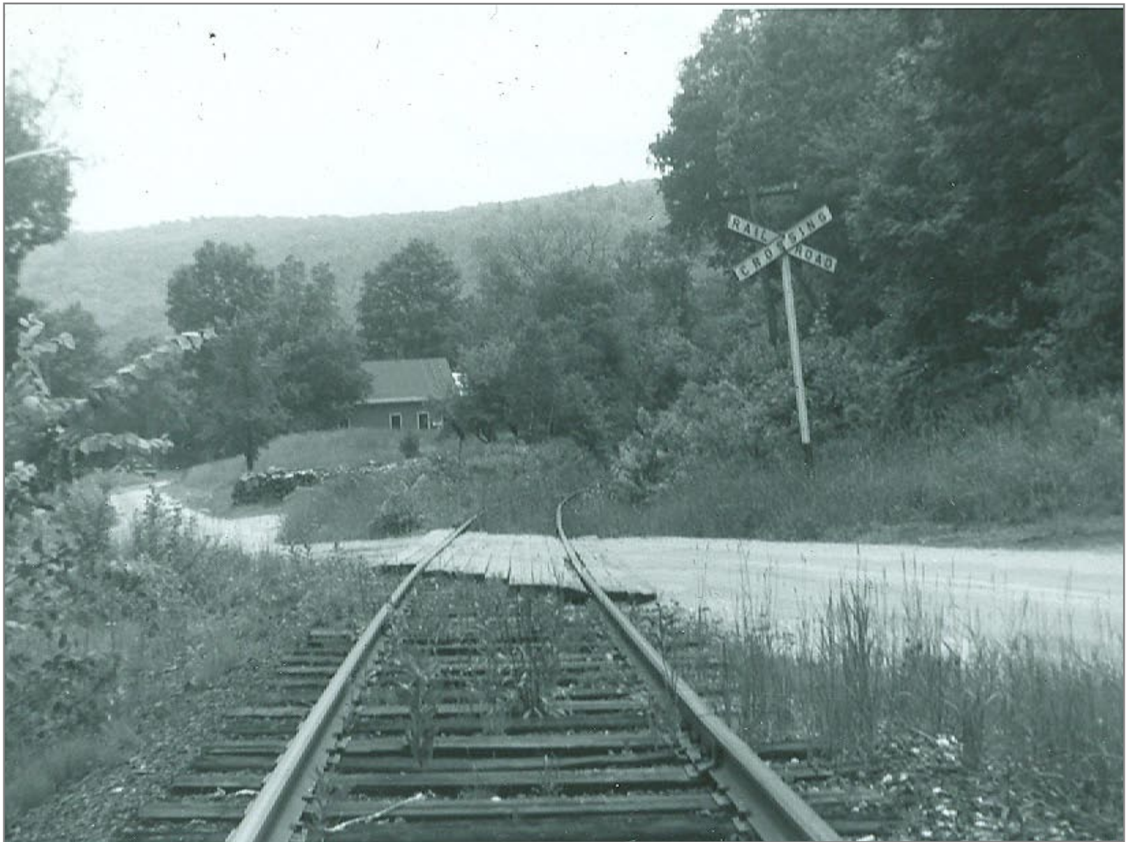
1st Crossing South of Cavendish