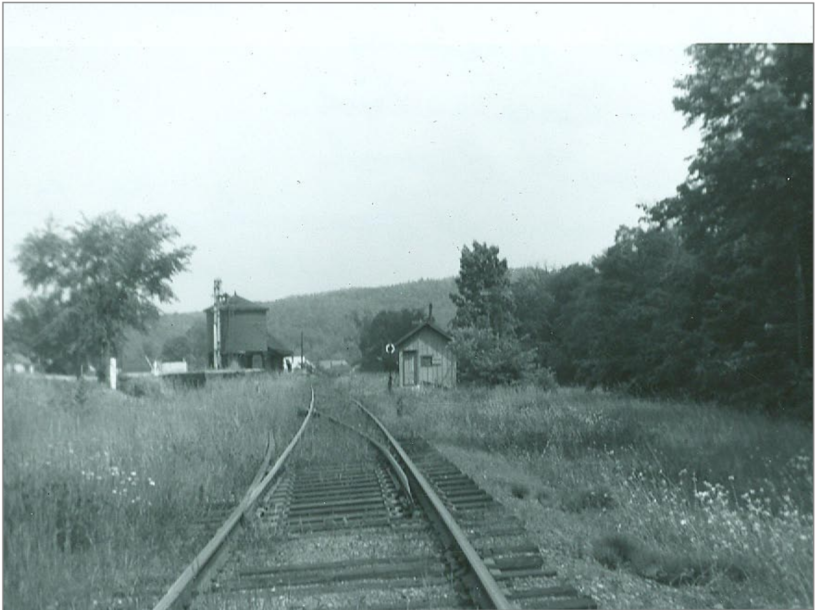
Southbound into Gassetts