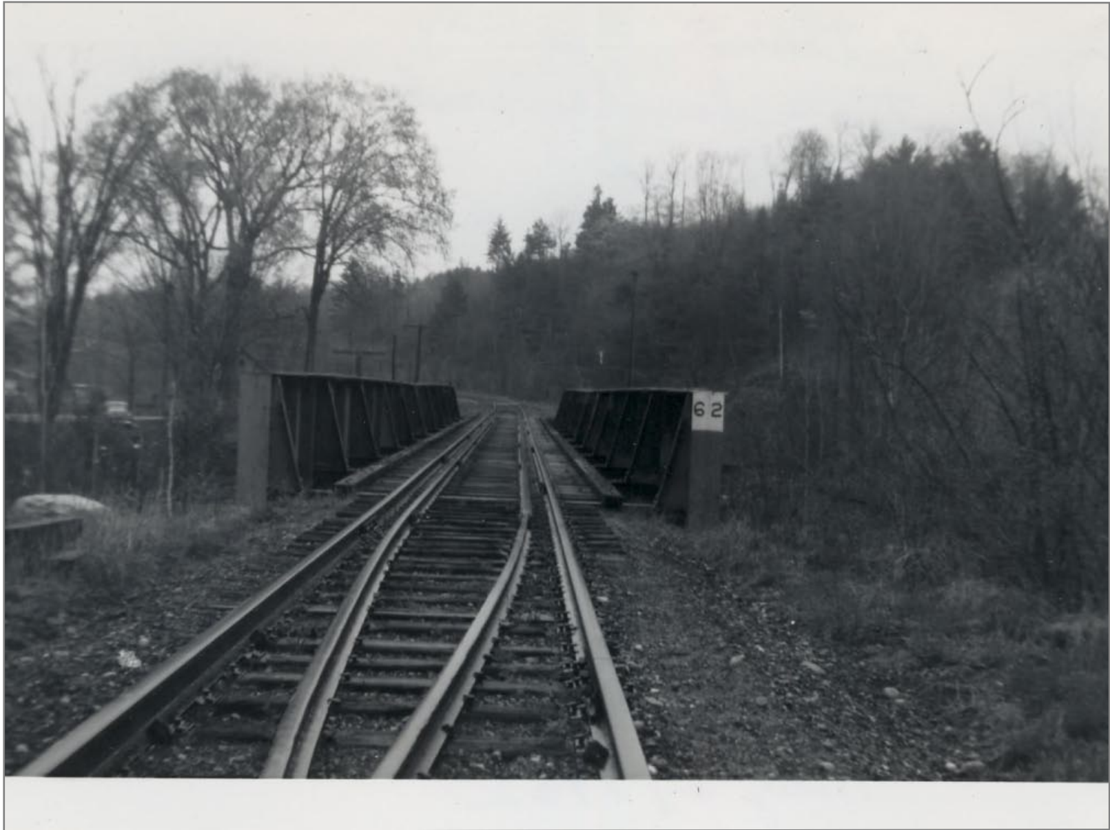
Bridge 62 Northbound 5/6/1962