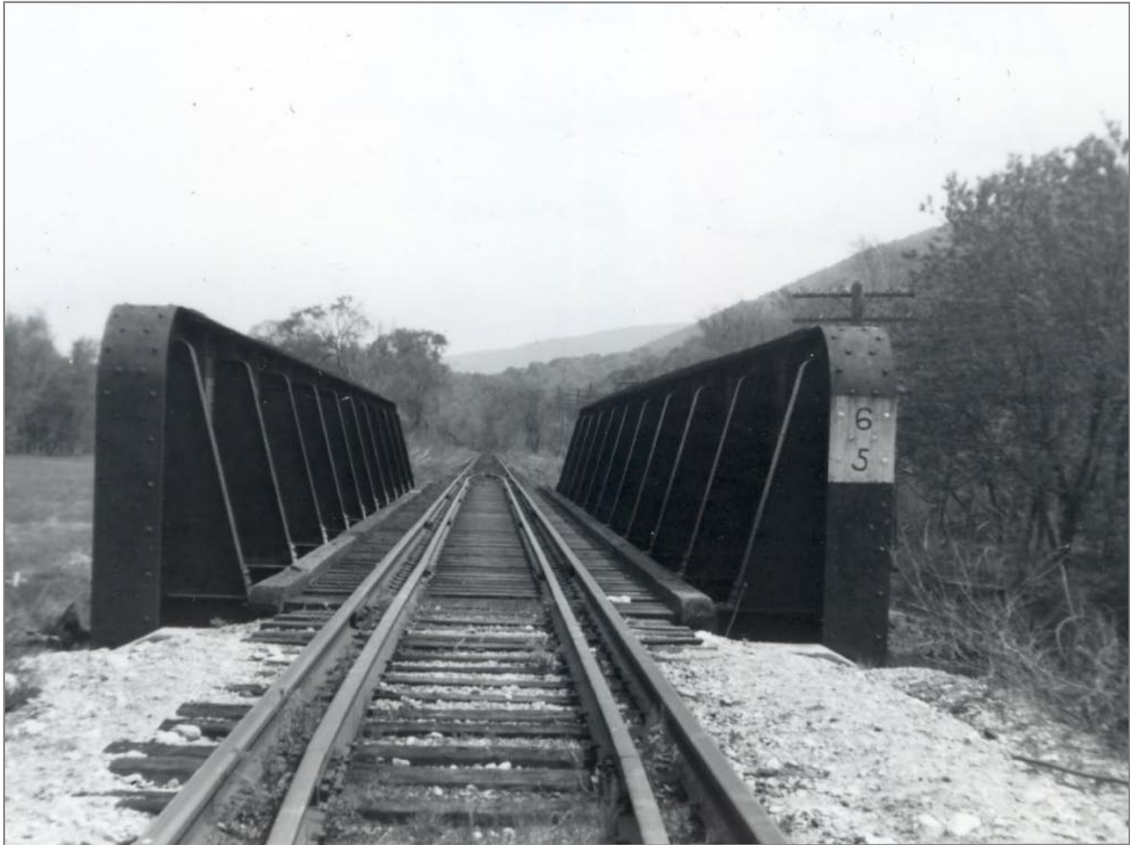
Bridge 65 Southbound 5/20/1962 Built by American Bridge Co. in 1903