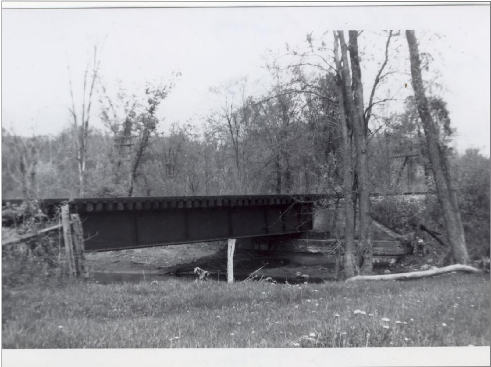
Bridge 67 Looking West 5/20/1962