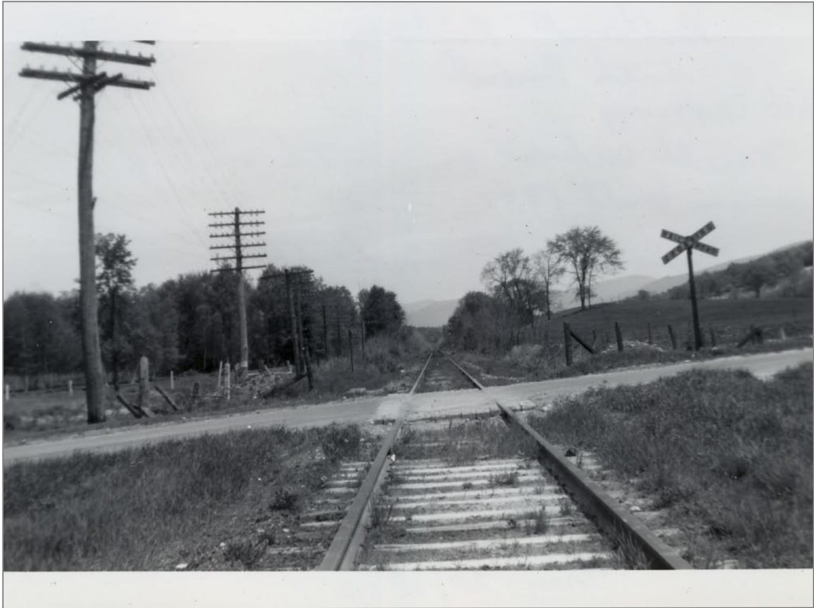
3rd Crossing North of Sunderland 5/20/1962