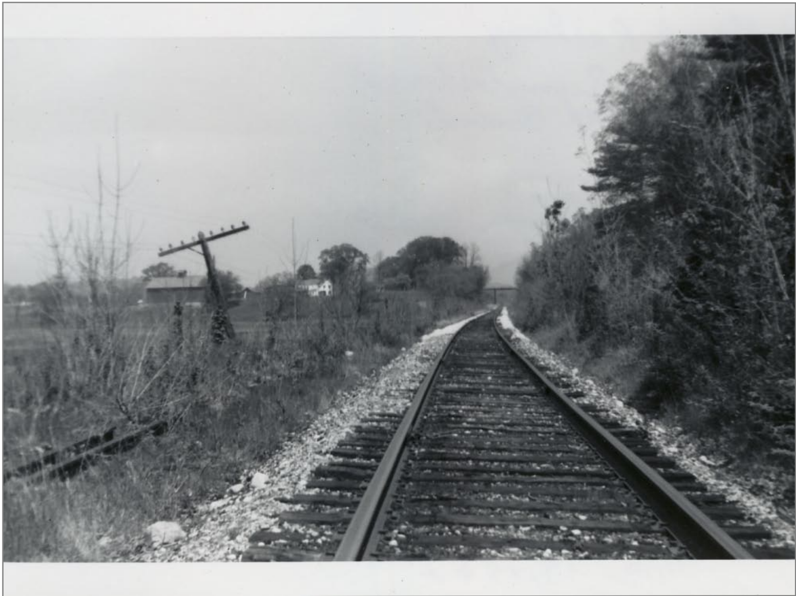
Northbound Toward Sunderland - Sunderland Overpass in Distance 5/19/1962