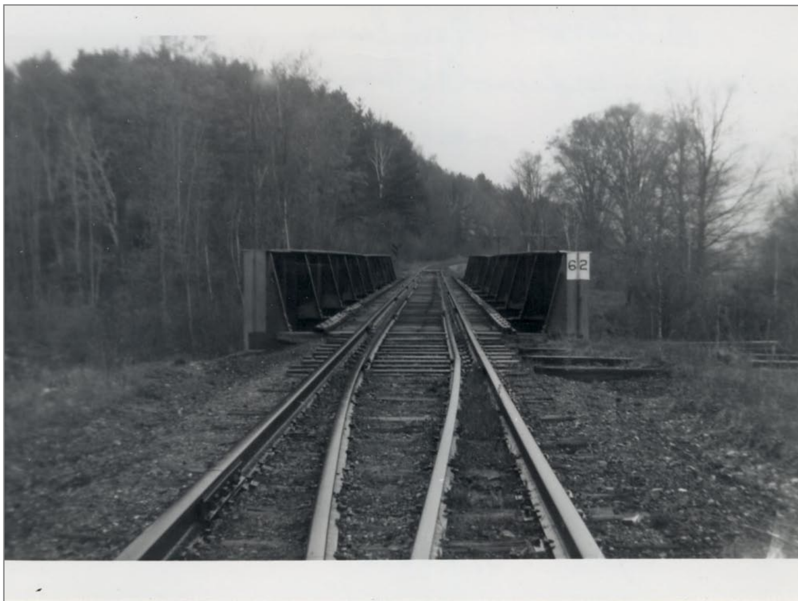
Bridge 62 Over Battenkill River Southbound 5/6/1962