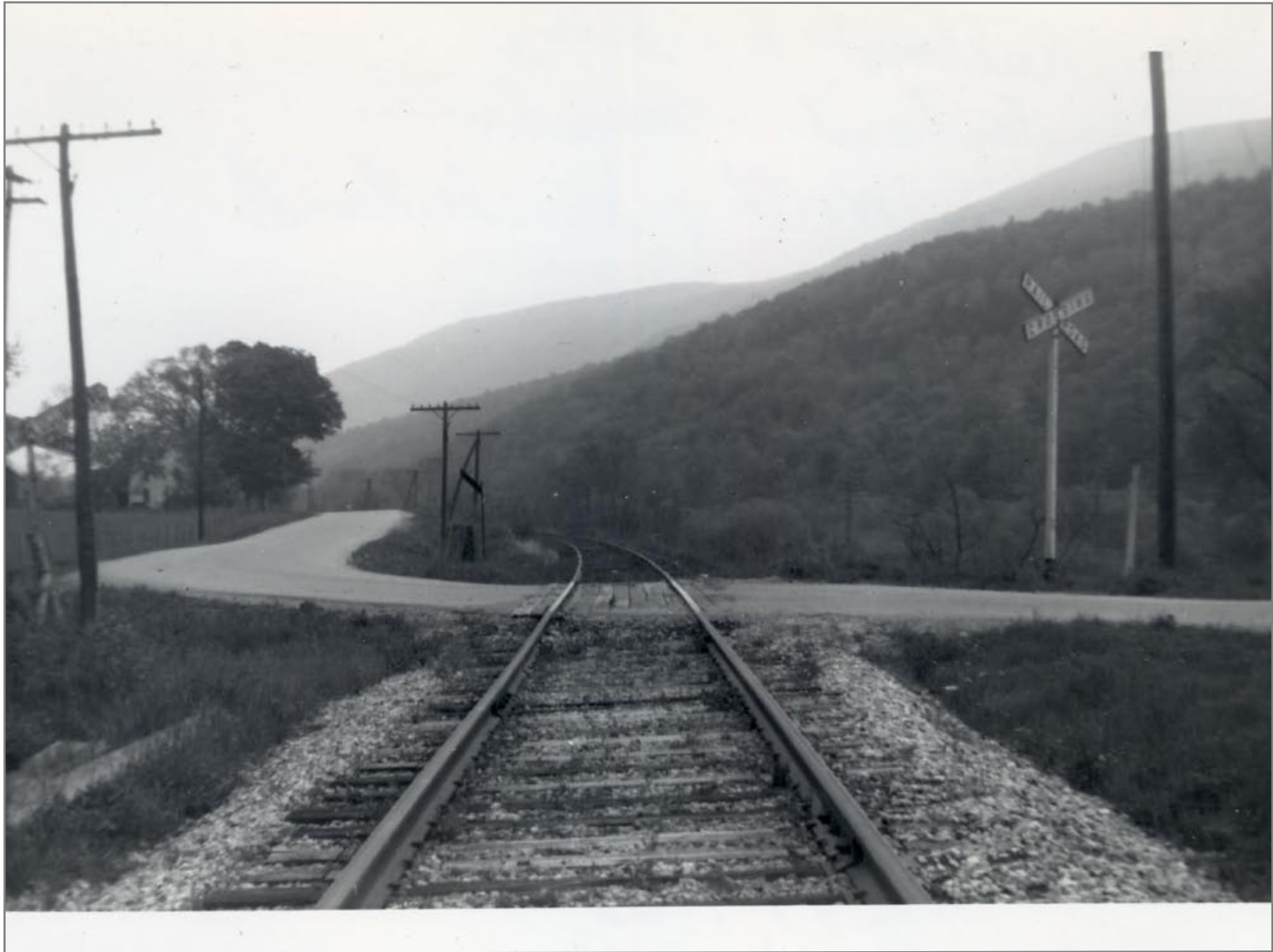
Northbound First Crossing North of Sunderland 5/19/962