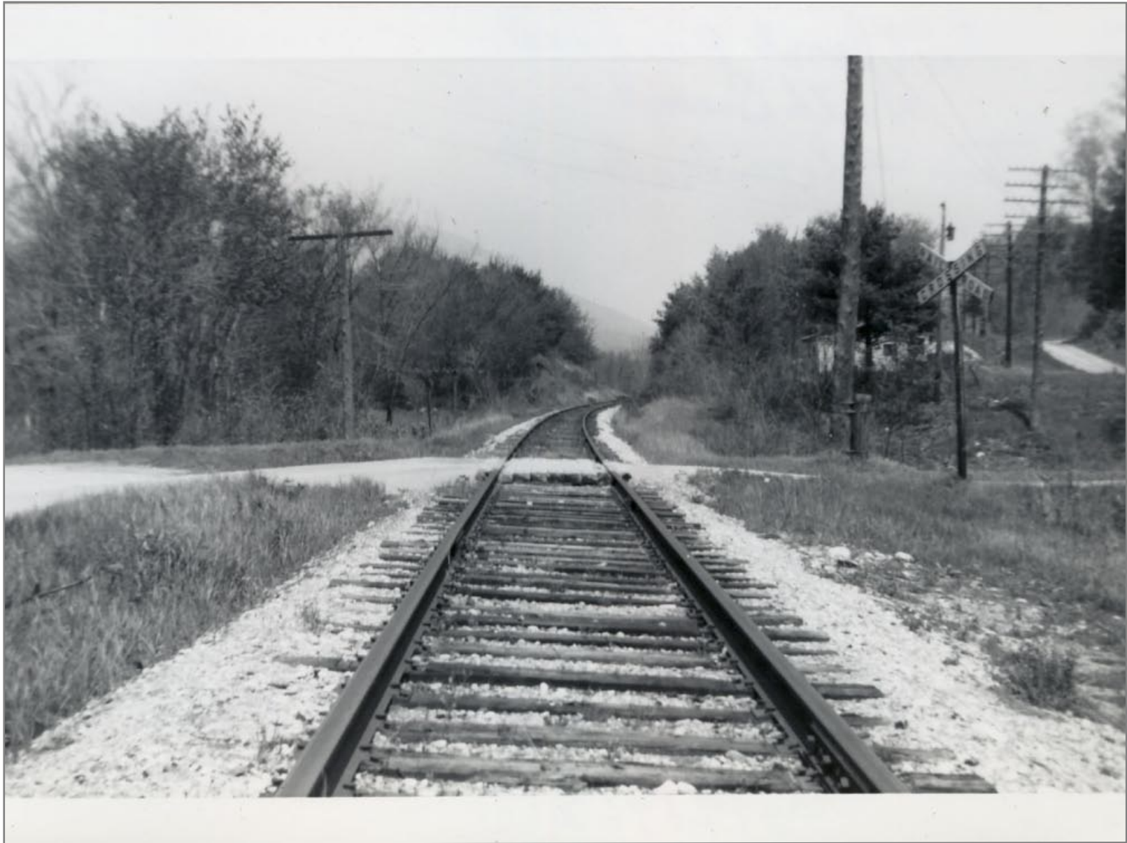
Northbound 5/19/1962 near MP # 16 5/19/1962