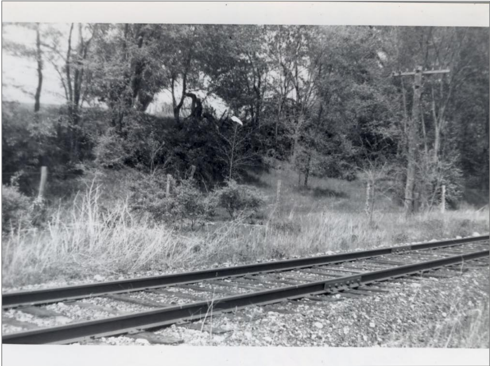
Site of Station Just South of Highway Overpass Looking Northbound 5/19/1962