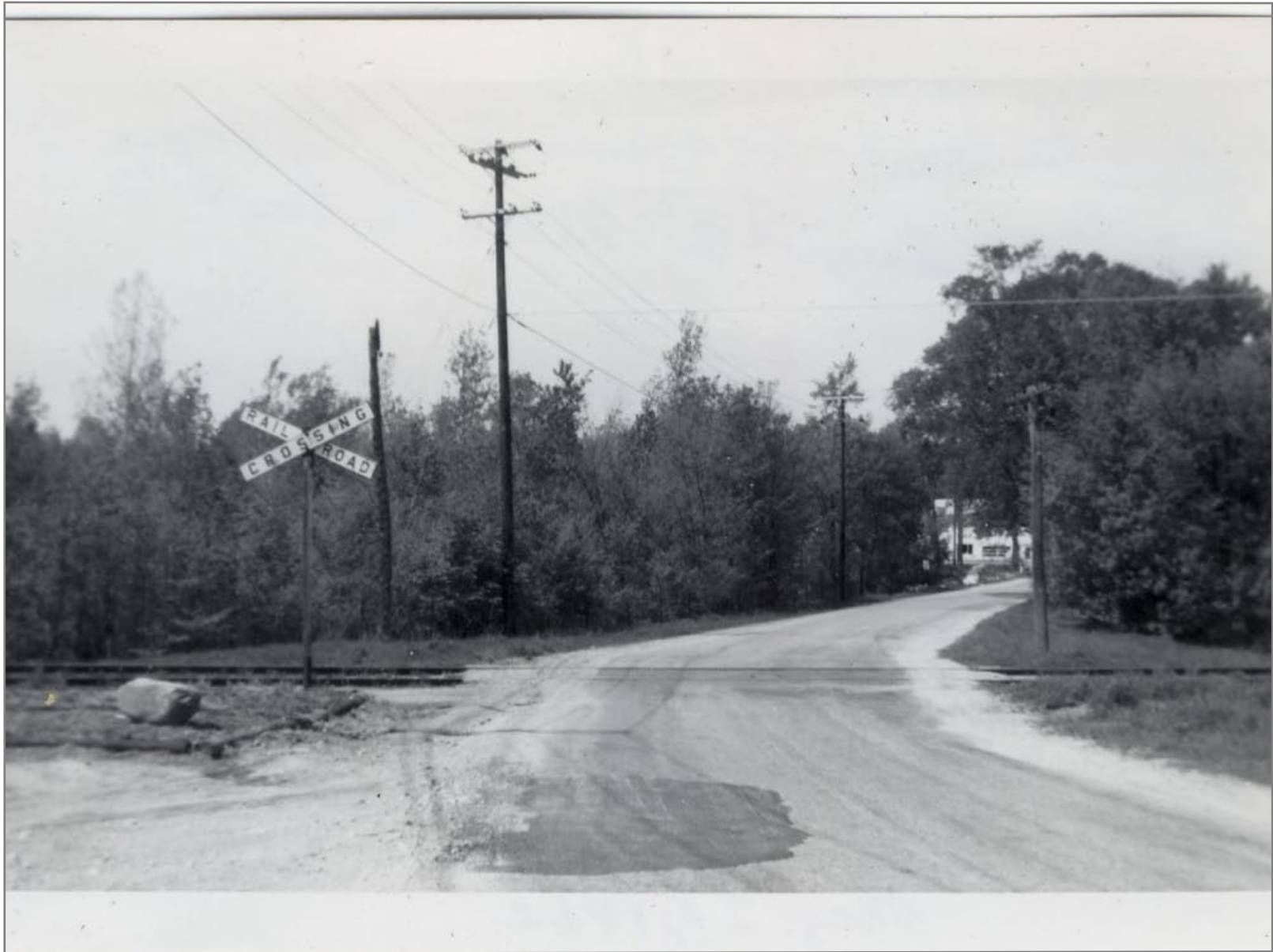
Crossing Just South of Manchester Station Looking West 5/20/1962