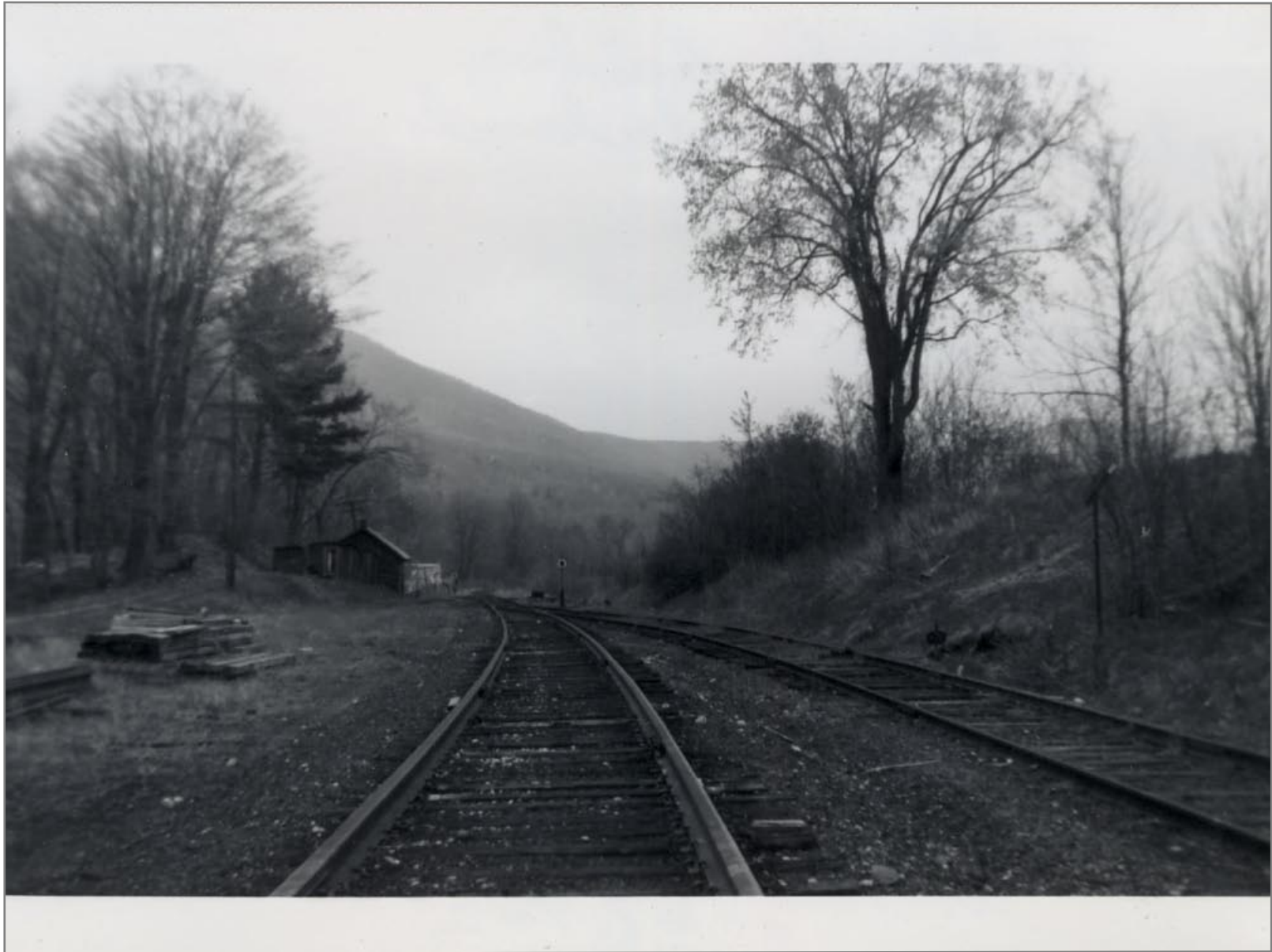
Northbound out of Arlington 5/6/1962