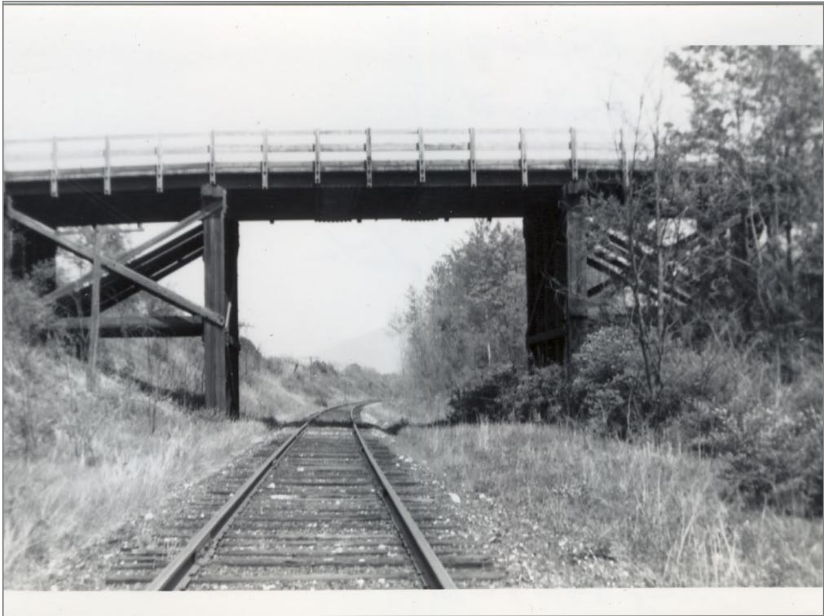
Sunderland Highway Overpass 5/19/1962