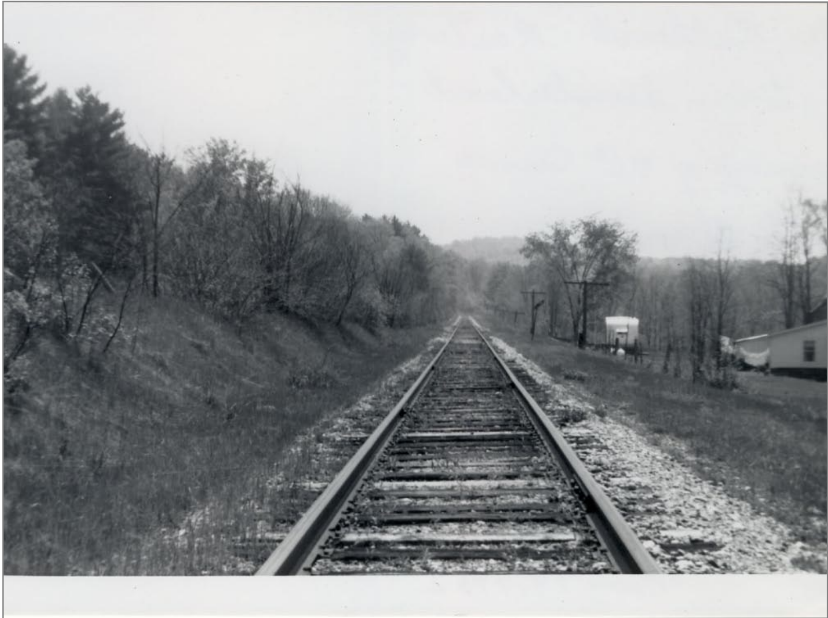
Southbound @ Beginning of 4th Curve Out of Arlington 5/19/1962