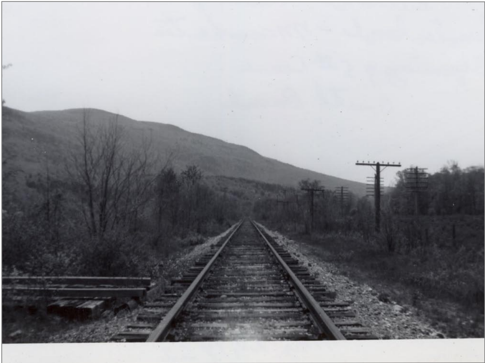
Motor Car Set Out Southbound Near MP 21 5/20/1962