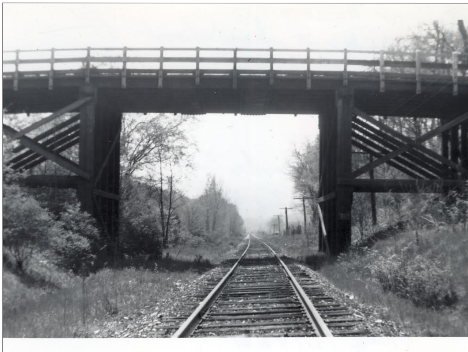
Sunderland Highway Bridge Built 1932 Looking Southbound Bridge #62A 5/19/1962