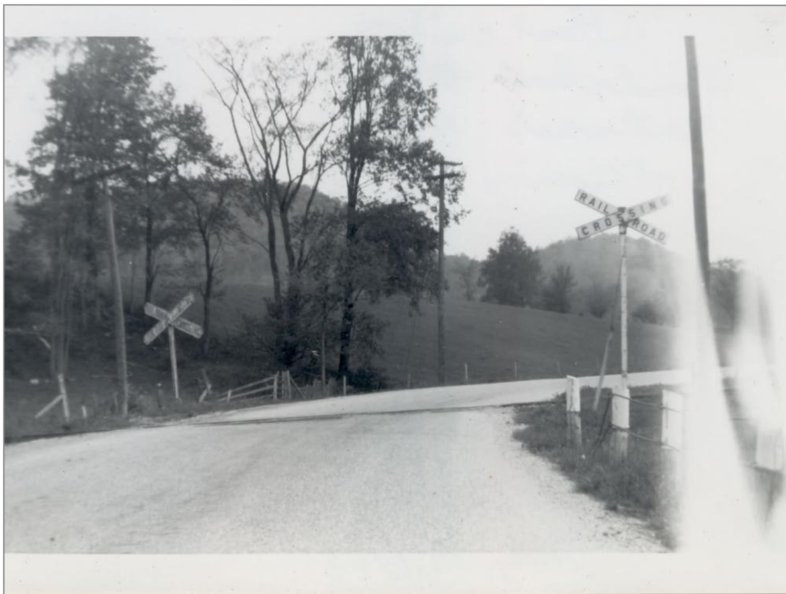
Looking West @ 1st Crossing North of Sunderland 5/19/1962