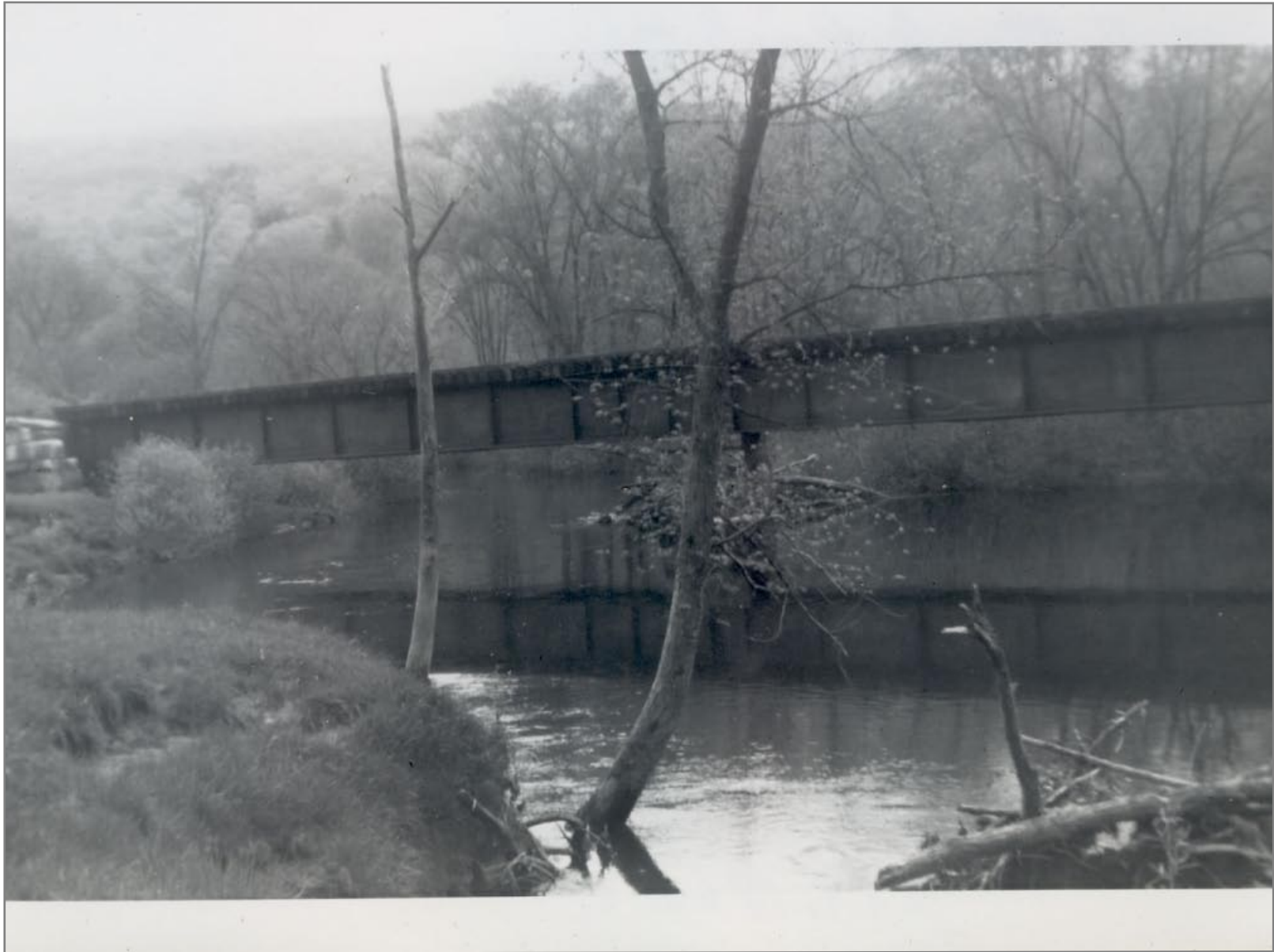
Bridge 64 MP 18 5/19/1962