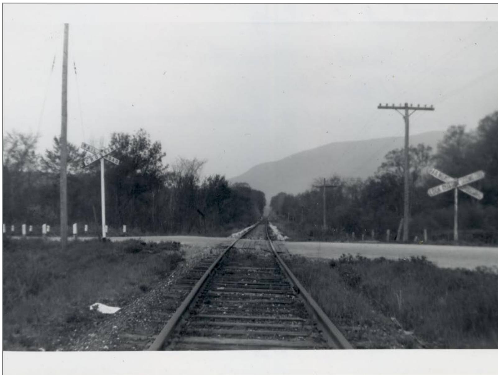
Southbound 1st Crossing North of Sunderland 5/19/1962