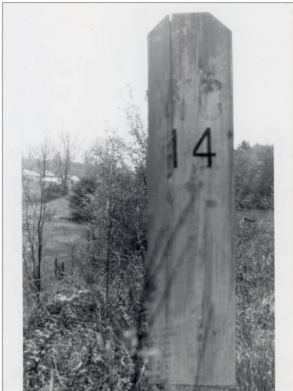
Milepost 14 5/19/1962