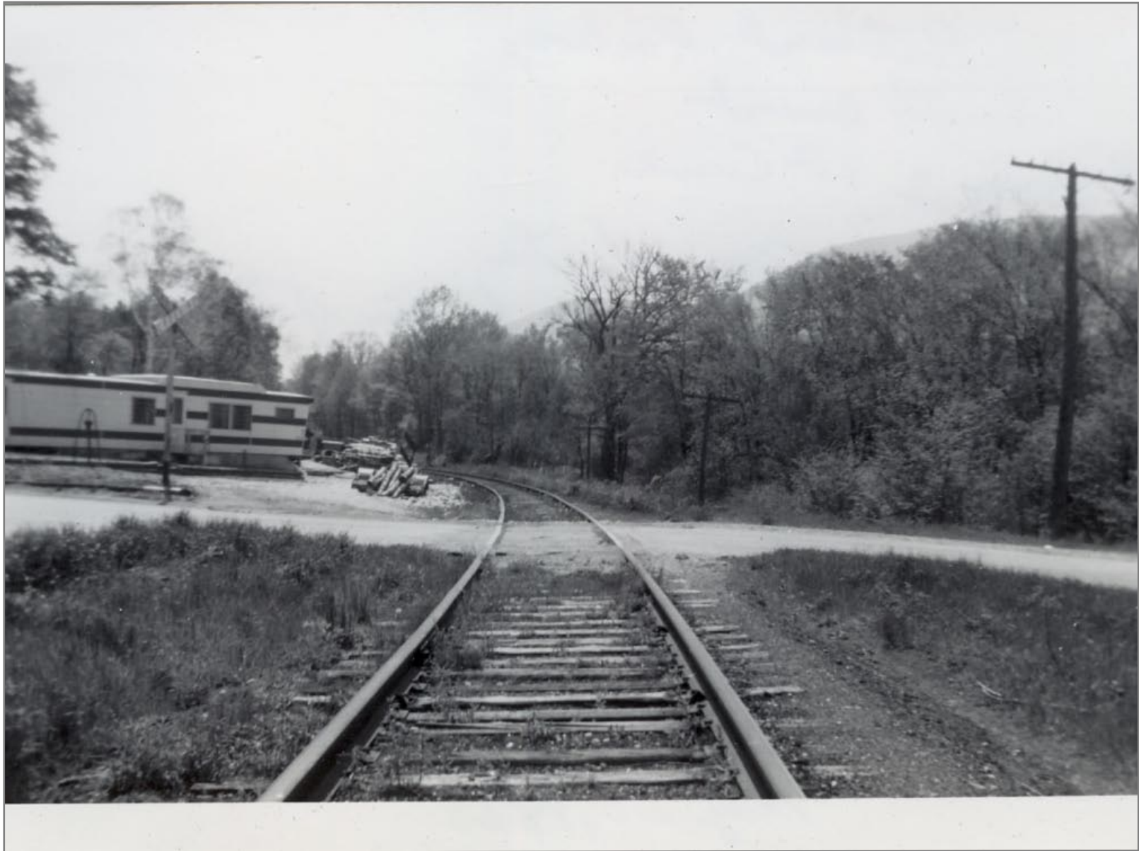
Crossing South of Manchester 5/20/1962