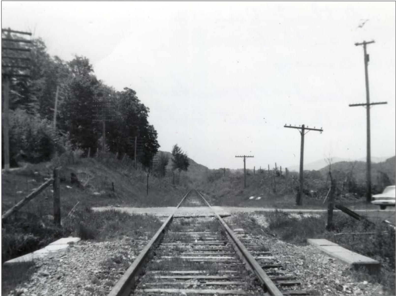
3rd Crossing North of Sunderland 5/20/1962