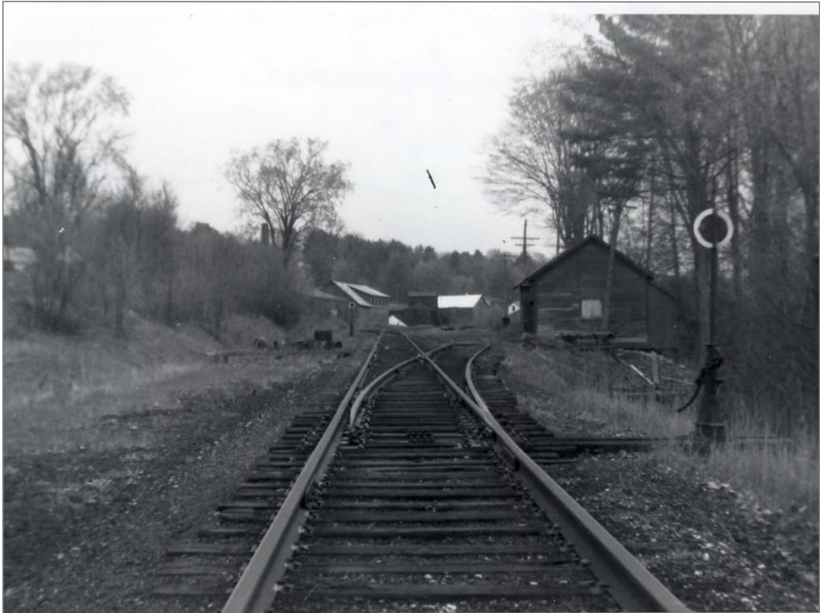
Southbound onto Arlington - Switch to Mack Molding on Right 5/6/1962