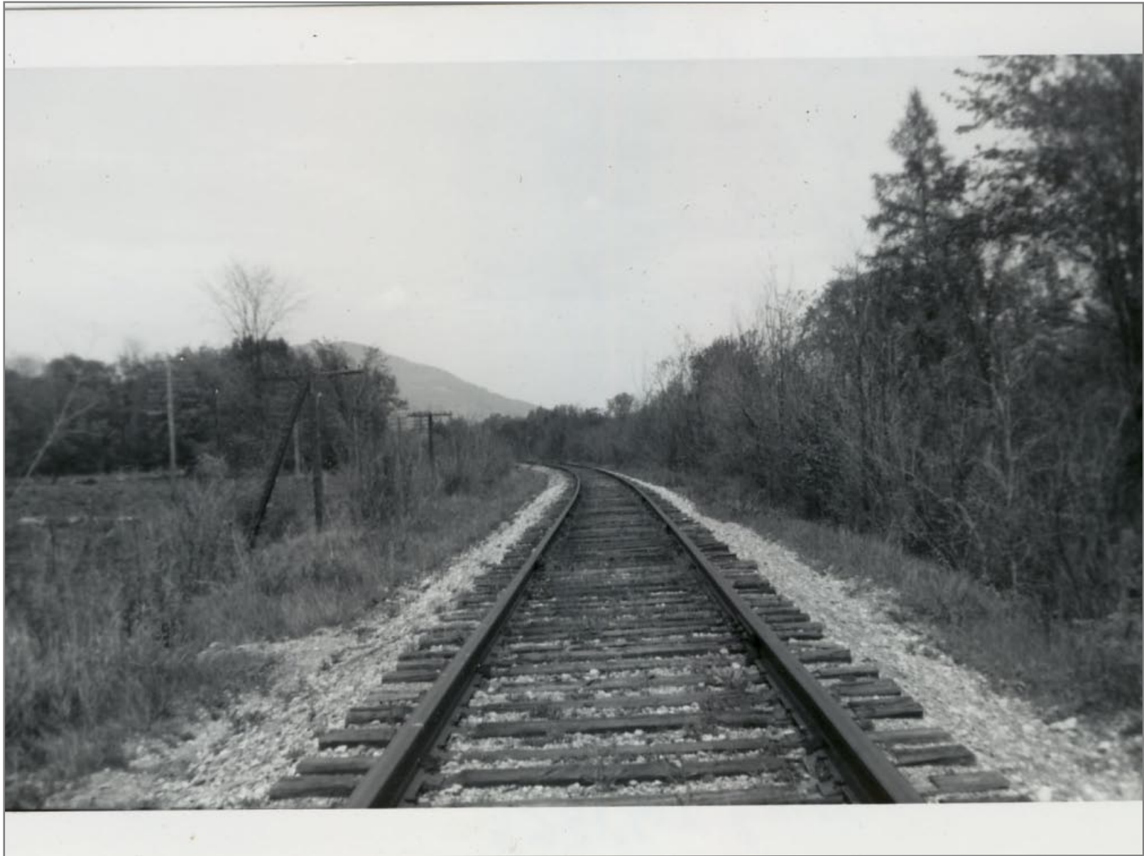
Northbound by MP 22 5/20/1962