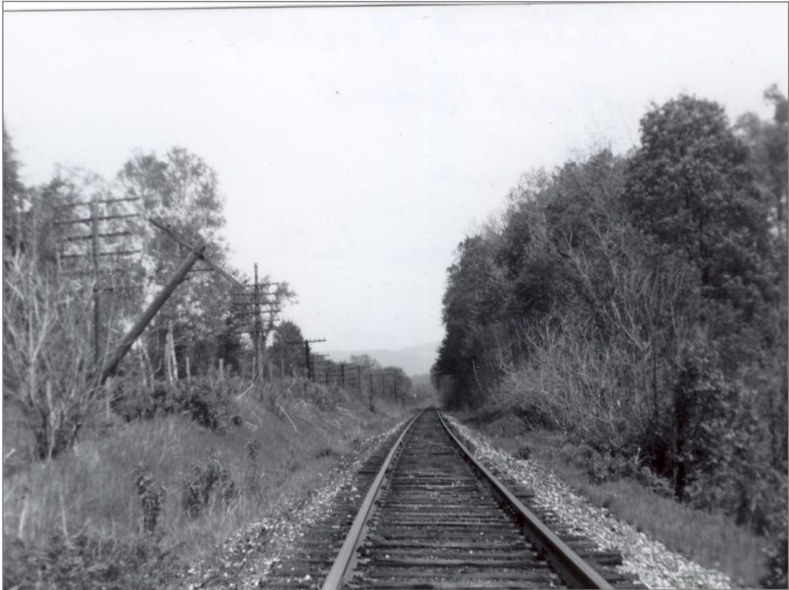
Northbound Near MP 21 5/20/1962