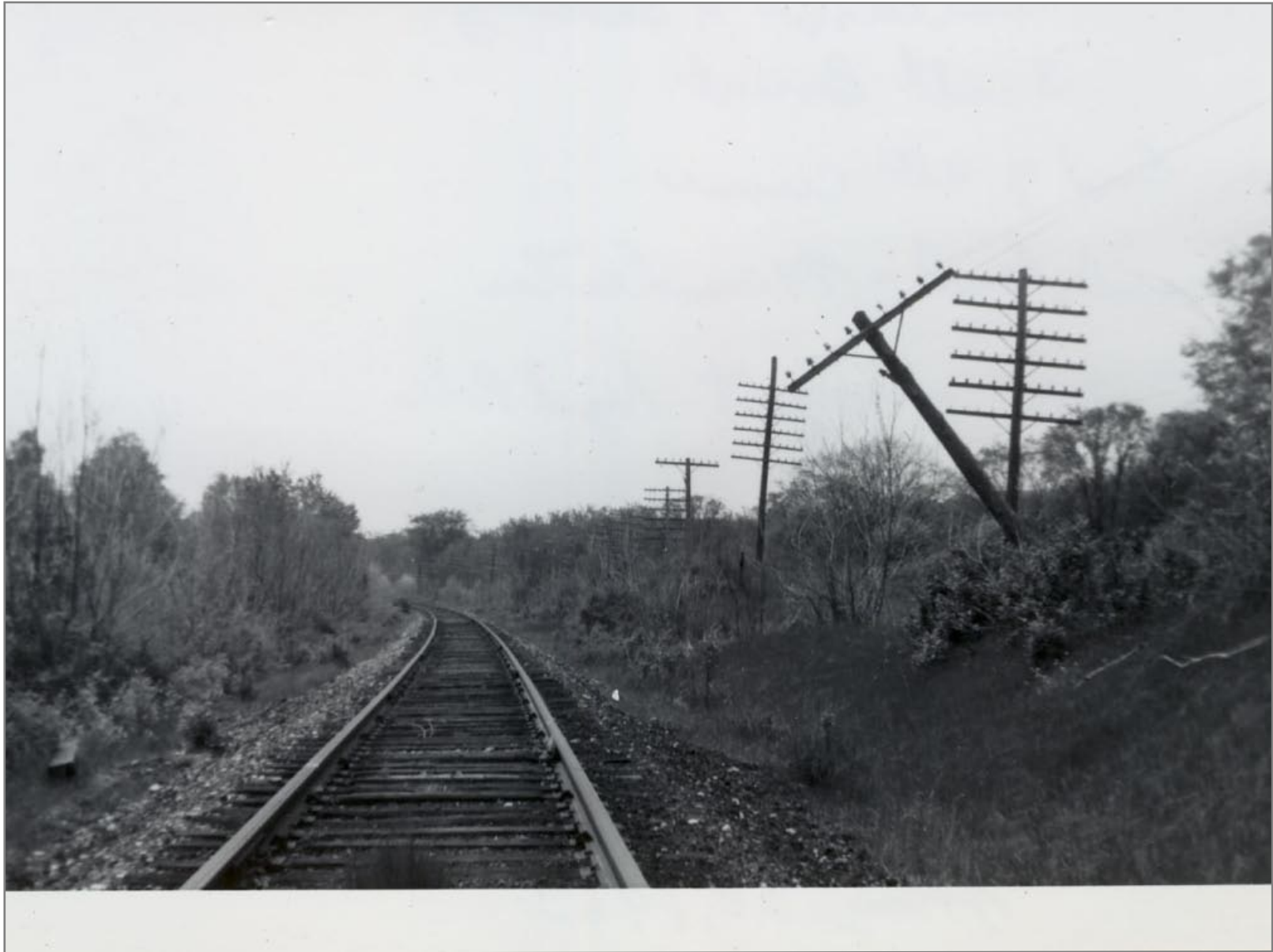
Southbound Near MP #20 5/20/1962