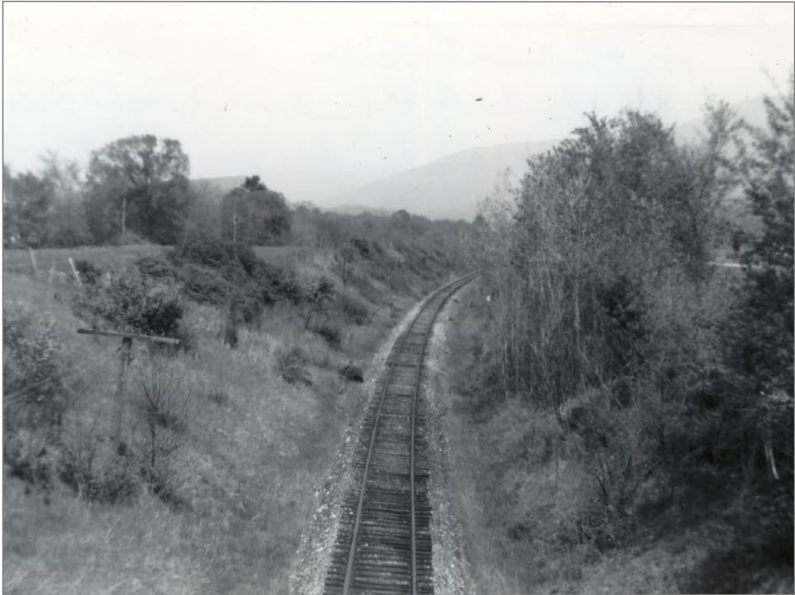
Northbound From Highway Overpass Toward MP 17 on Right 5/19/1962