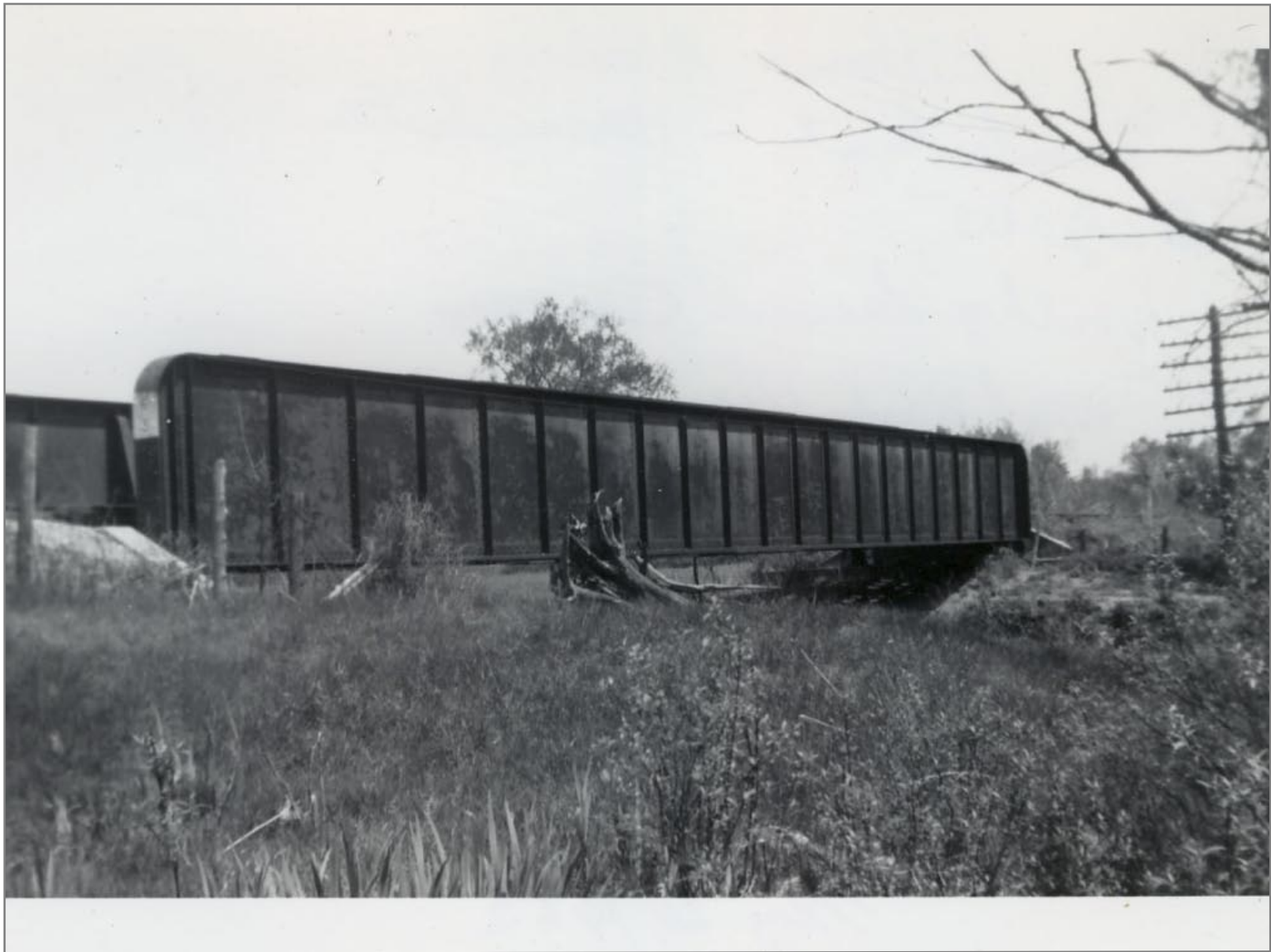
Bridge #65 North of 2nd Crossing From Sunderland 5/20/1962