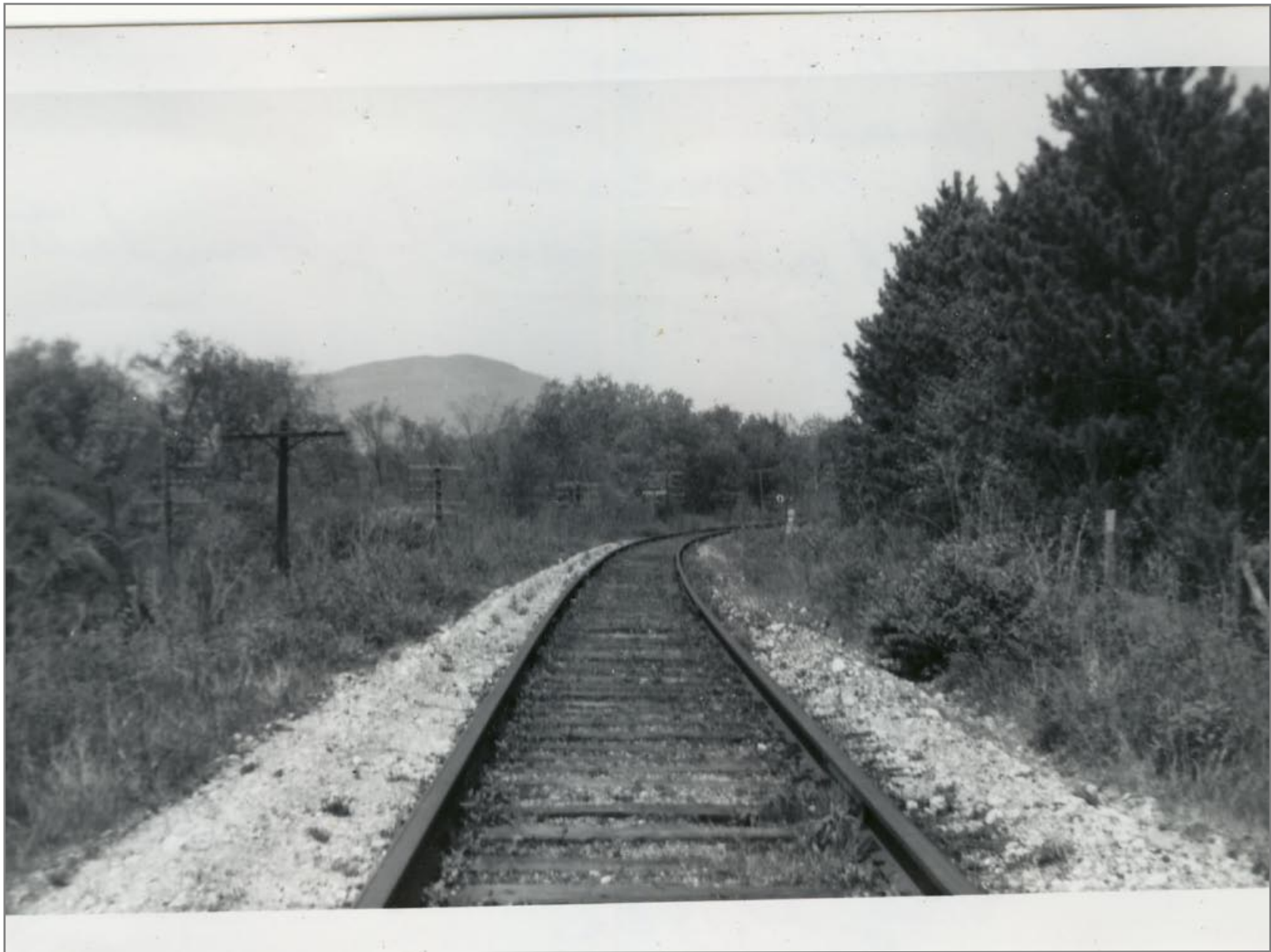
Northbound Switch to Milk Plant in Distance 5/20/1962