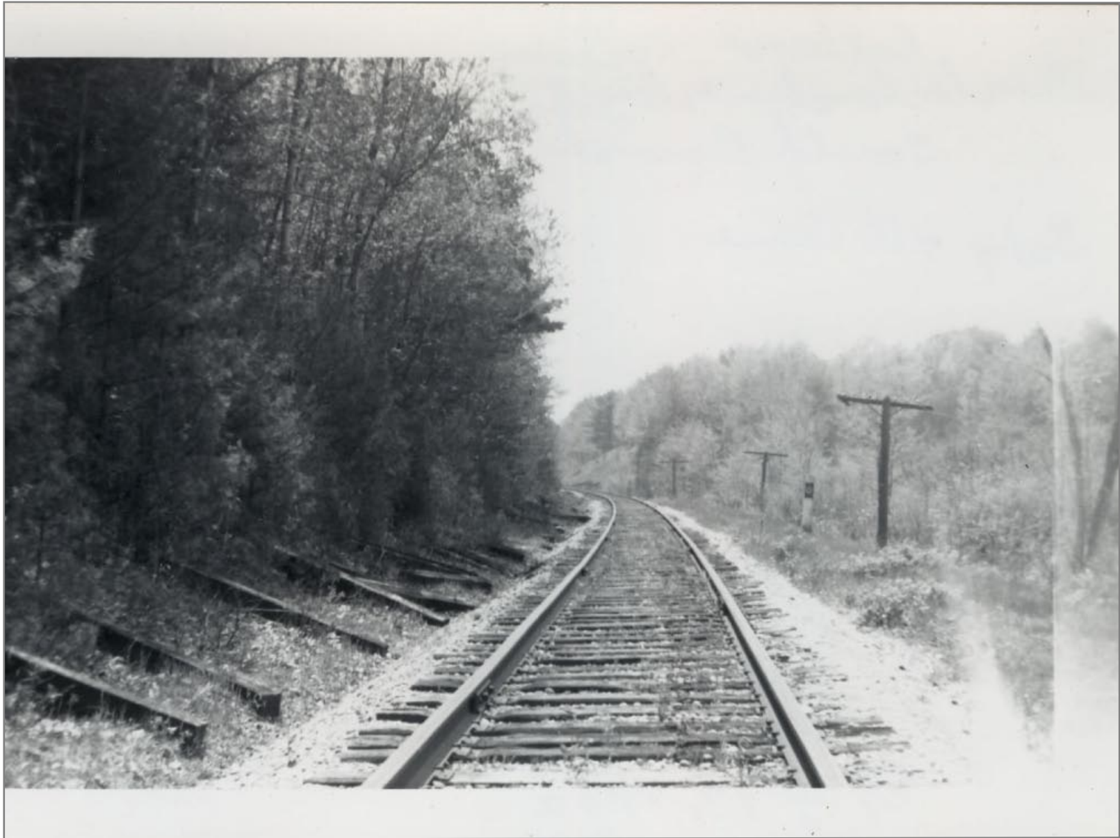
Southbound near MP #16 5/19/1962