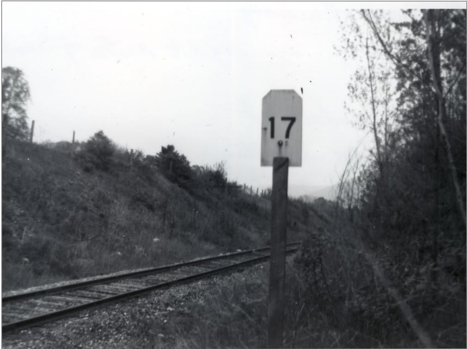
Milepost 17 Looking Northbound 5/19/1962