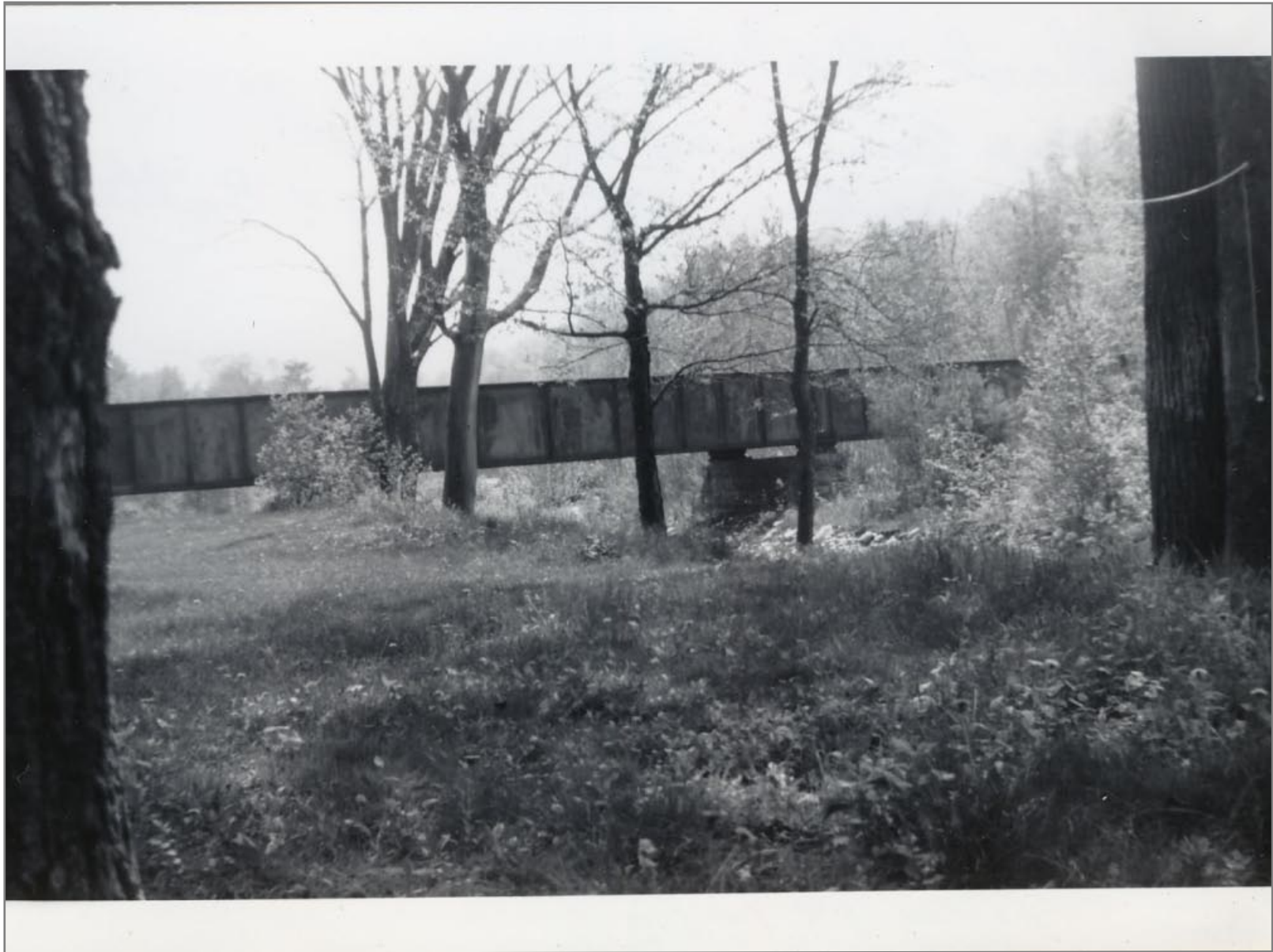
Bridge #62 Over Battenkill River 5/19/1962