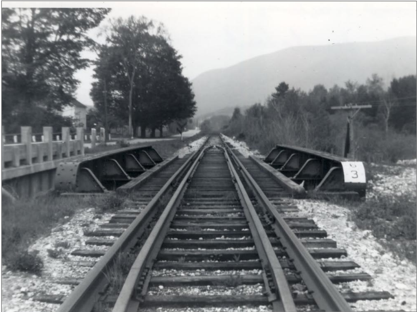
Bridge #63 Southbound Over Mill Stream Built By American Bridge Company 1903 5/19/1962