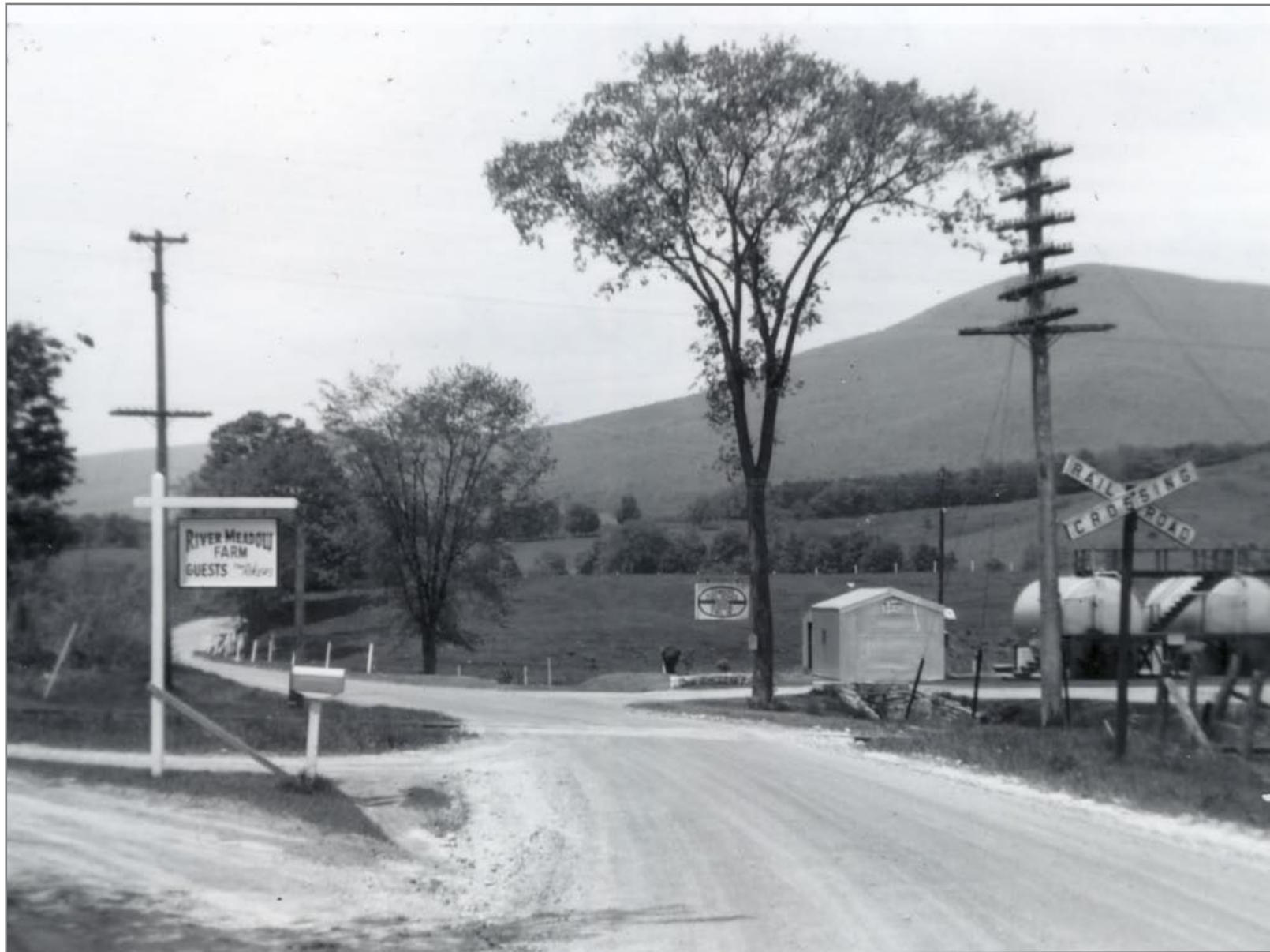
3rd Road Crossing North of Sunderland Johnson Distribution on Siding in Background 5/20/1962