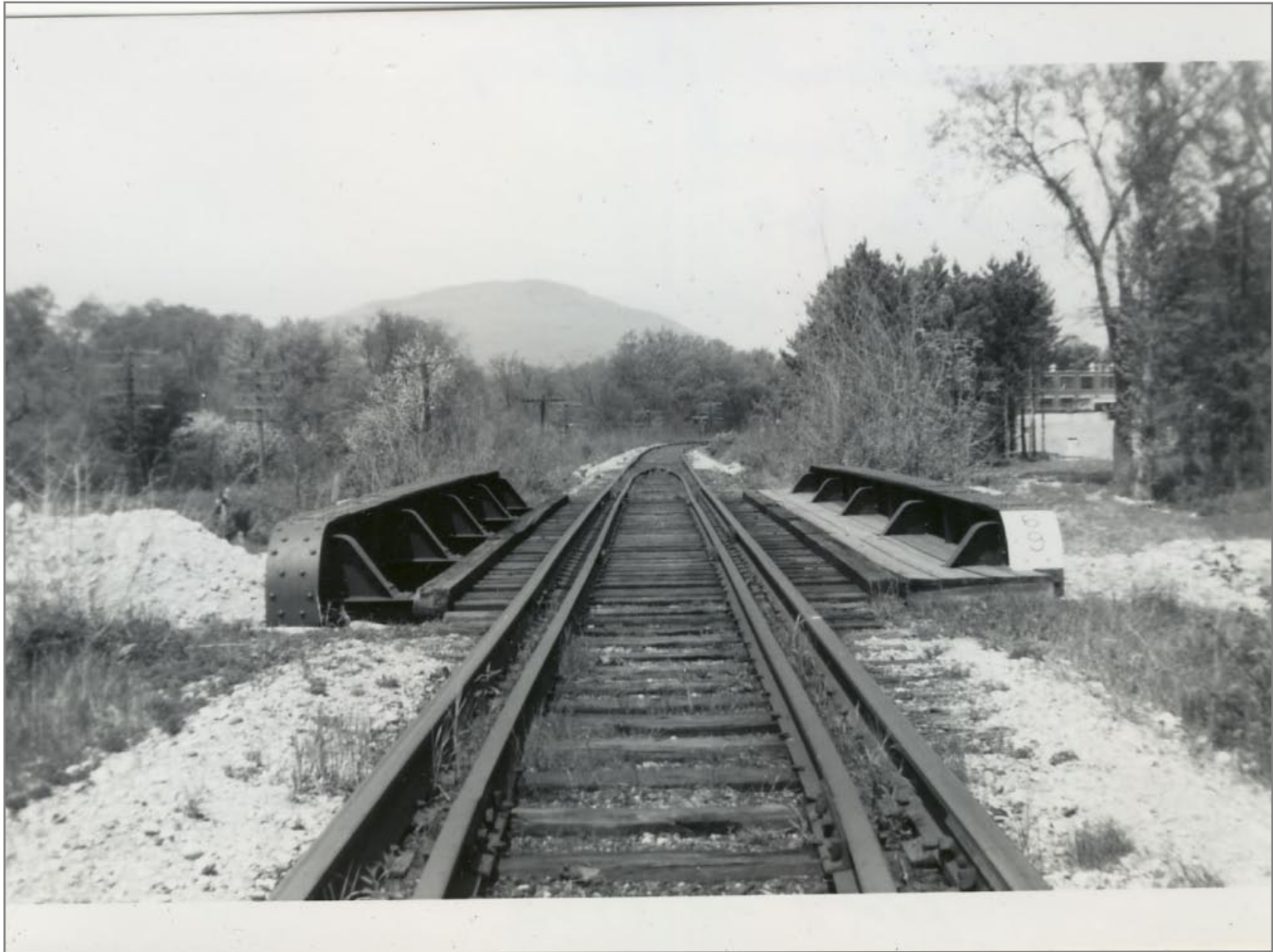
Bridge 69 5/20/1962