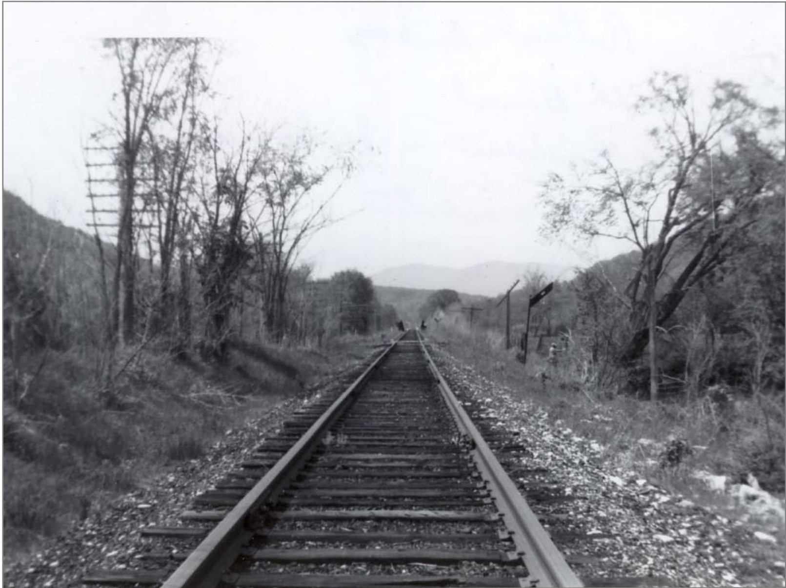
Southbound w/ Bridge #65 in Background 5/20/1962