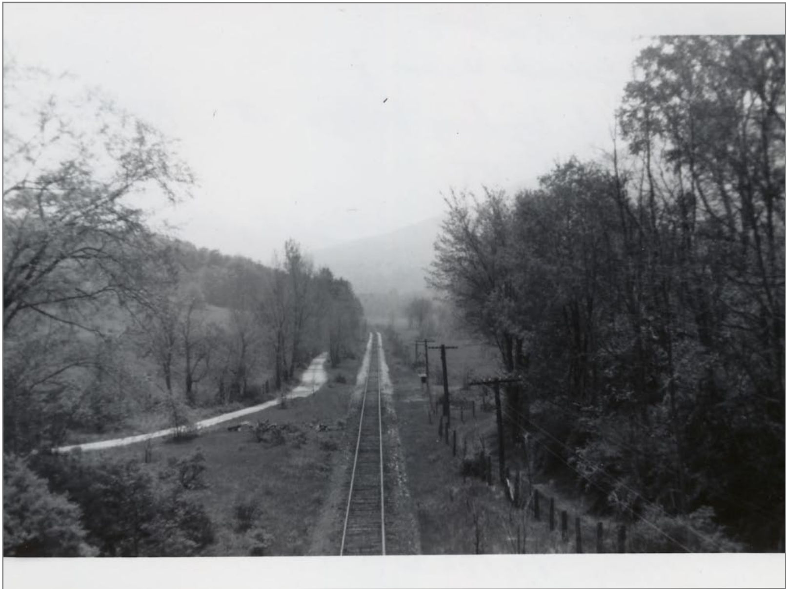
Looking Southbound From Highway Overpass Sunderland Station on Right Near Telephone Box 5/19/1962