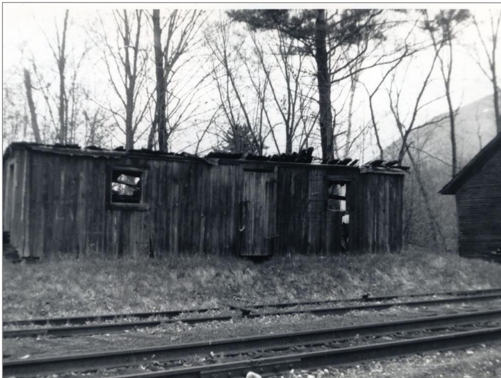
Former O & LC Boxcar Used For Tool Storage 5/6/1962