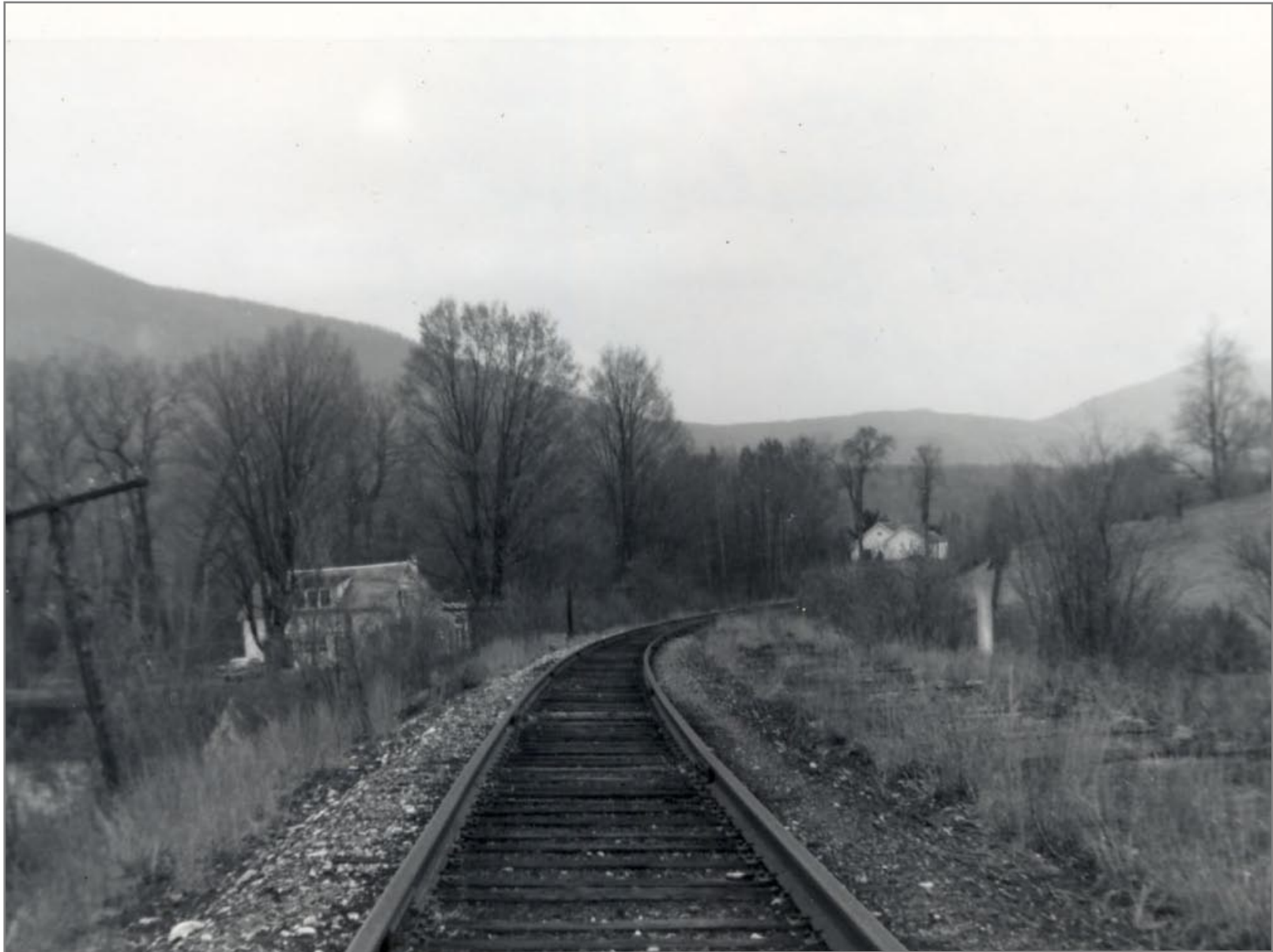
Northbound @ MP #14 5/6/9162