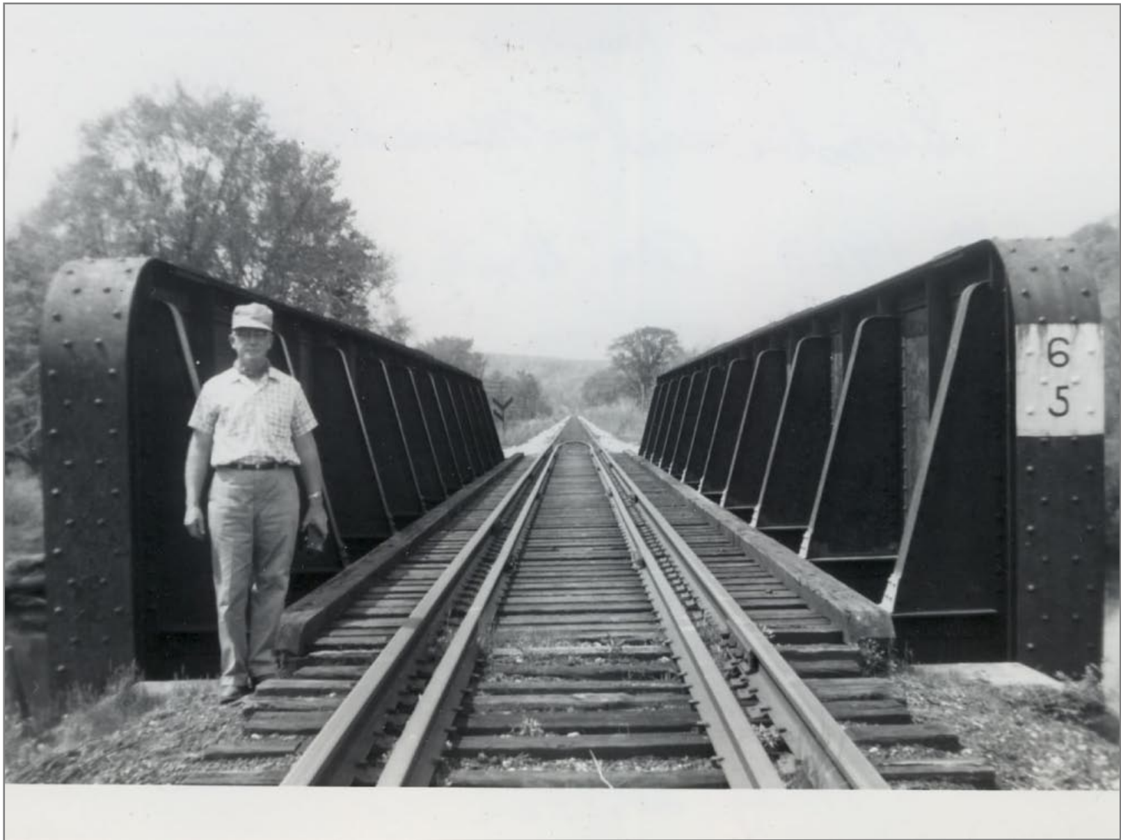
Bridge 65 5/20/9162