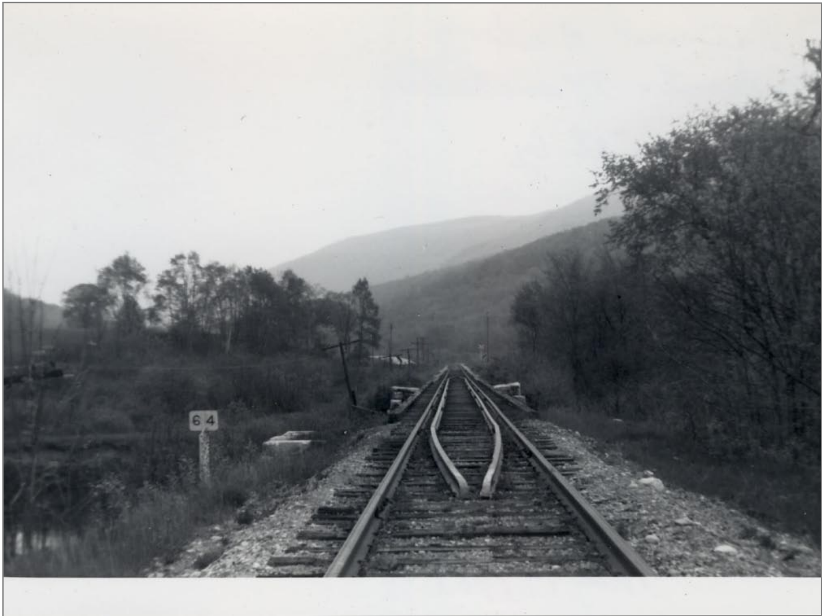
Northbound @ Bridge 64 5/19/1962