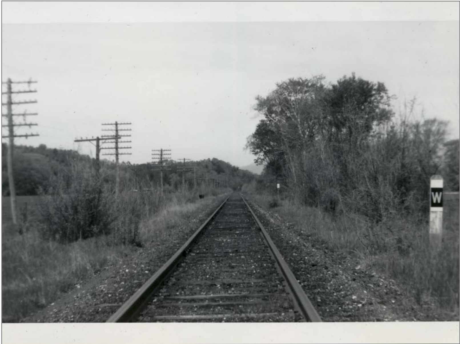
Northbound MP #22 on Right 5/20/1962