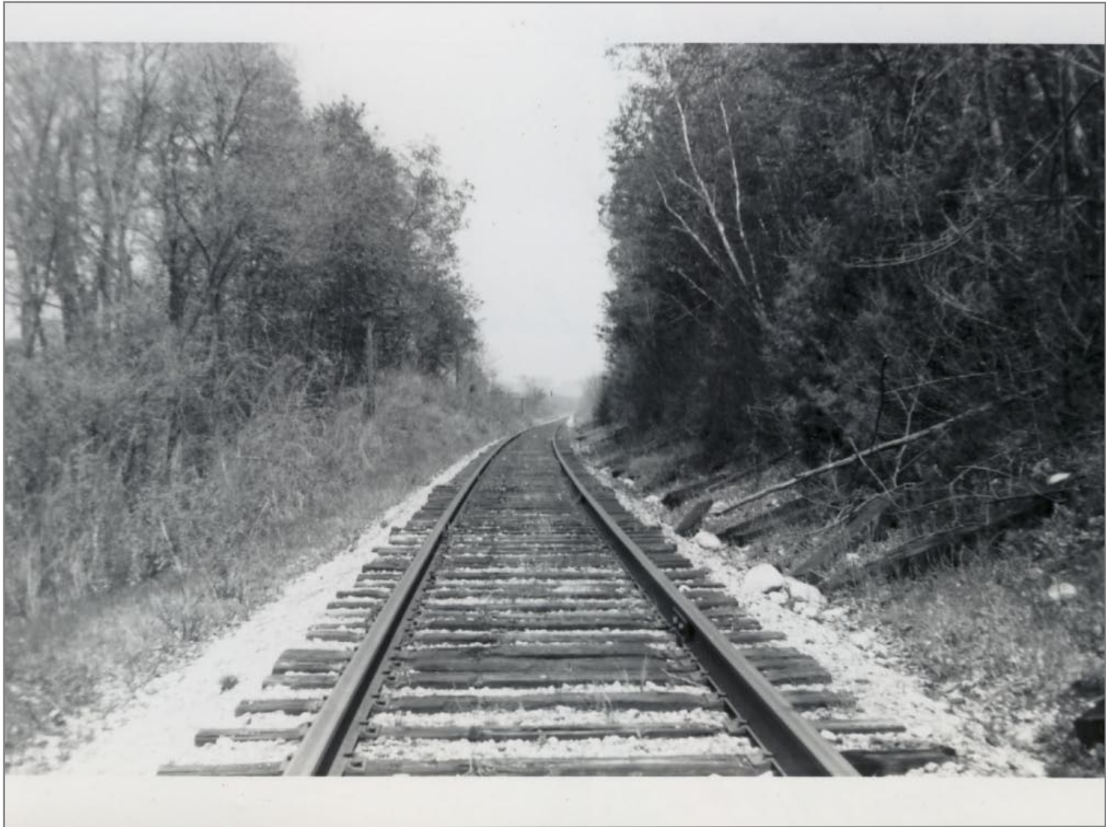
Northbound Near MP16 5/19/1962