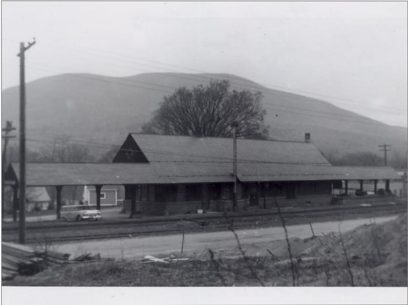
Arlington Station 4/29/1962