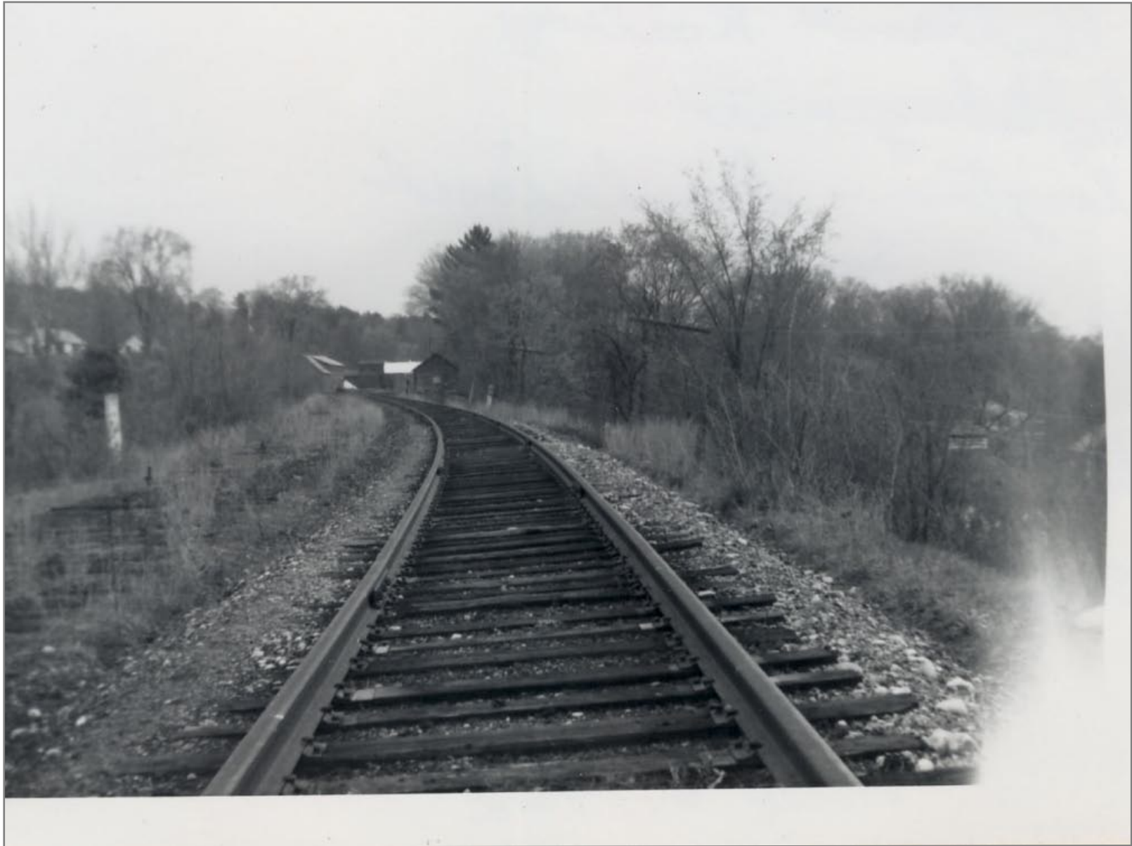
Southbound Heading into Arlington @ MP #14 Former Siding on Left 5/6/1962