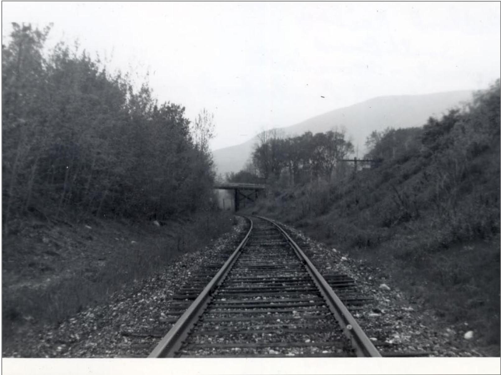
Looking Southbound @ Sunderland 5/19/1962