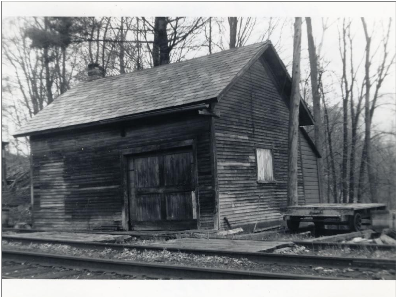
Section House At North End of Arlington Yard 5/6/1962