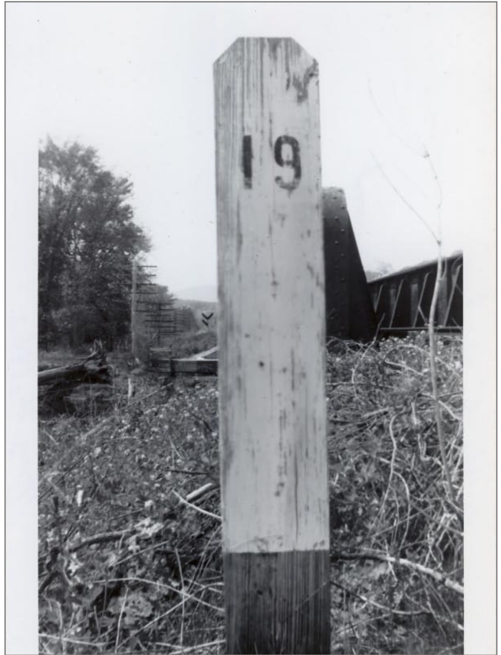
Milepost 19 w/ Bridge 65 in Background 5/20/1962