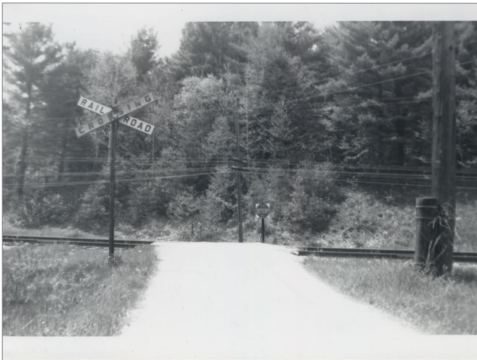
West at Road Crossing Near MP #16