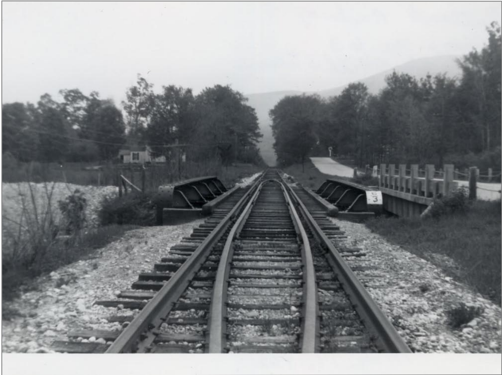
Bridge #63 Looking Northbound Between MP 17 & 18 5/14/1962