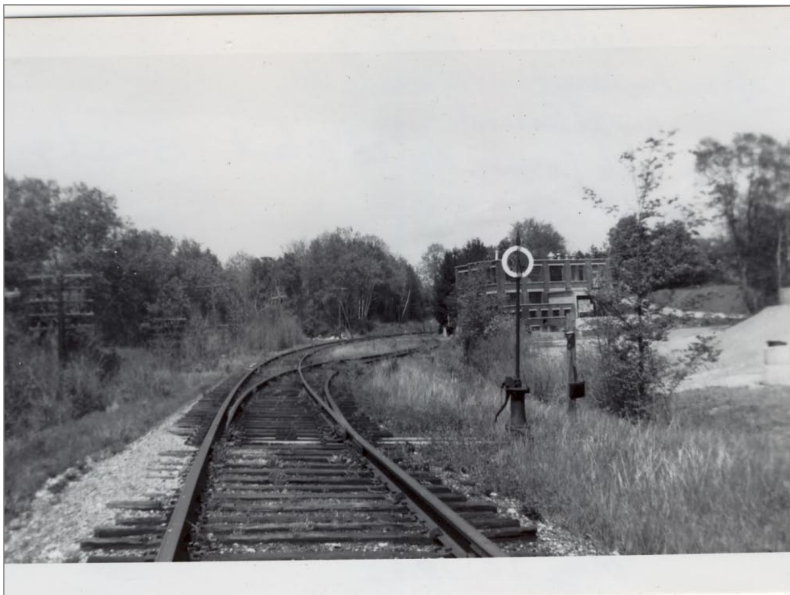
Northbound Switch Into Bennington Cooperative Creamery 5/20/1962