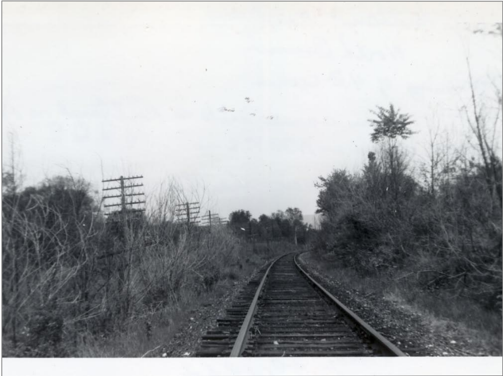
Northbound Between MP 19 & 20 5/20/1962