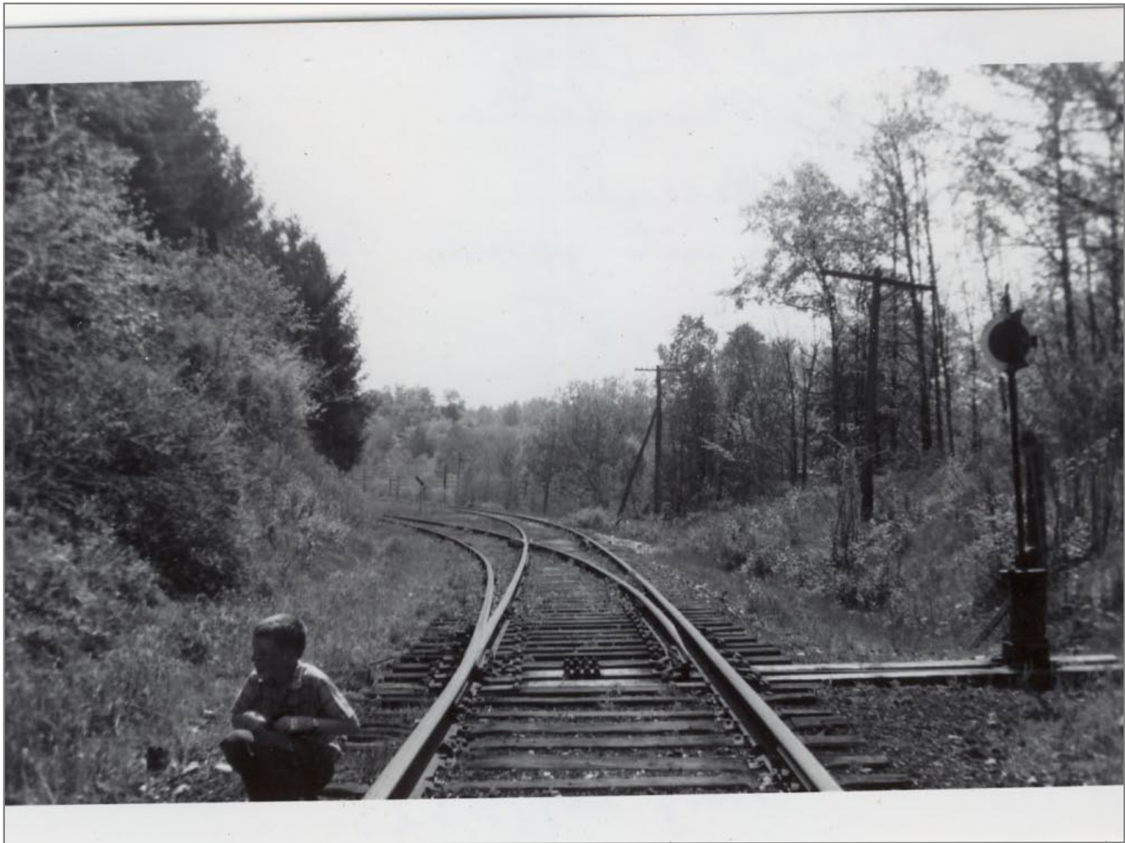
Southbound Switch into Milk Plant 5/20/1962