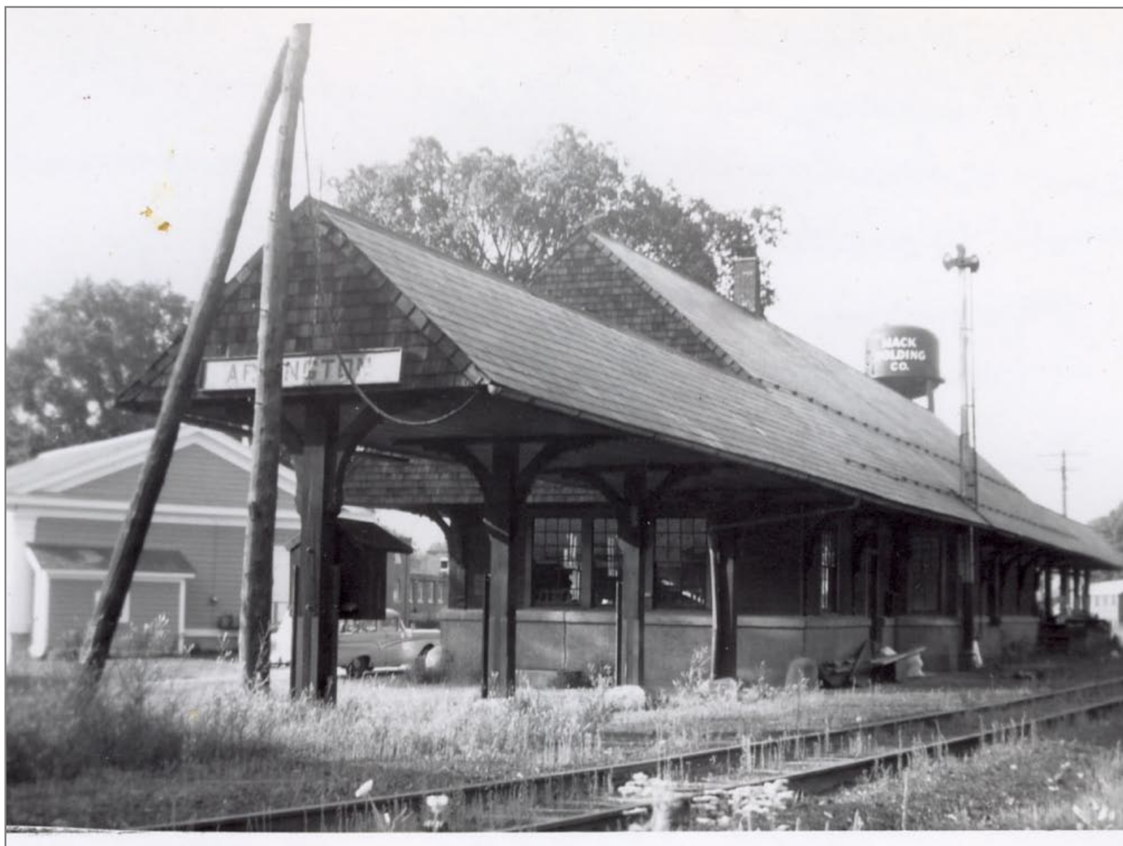
Arlington Station Northbound 7/30/1961