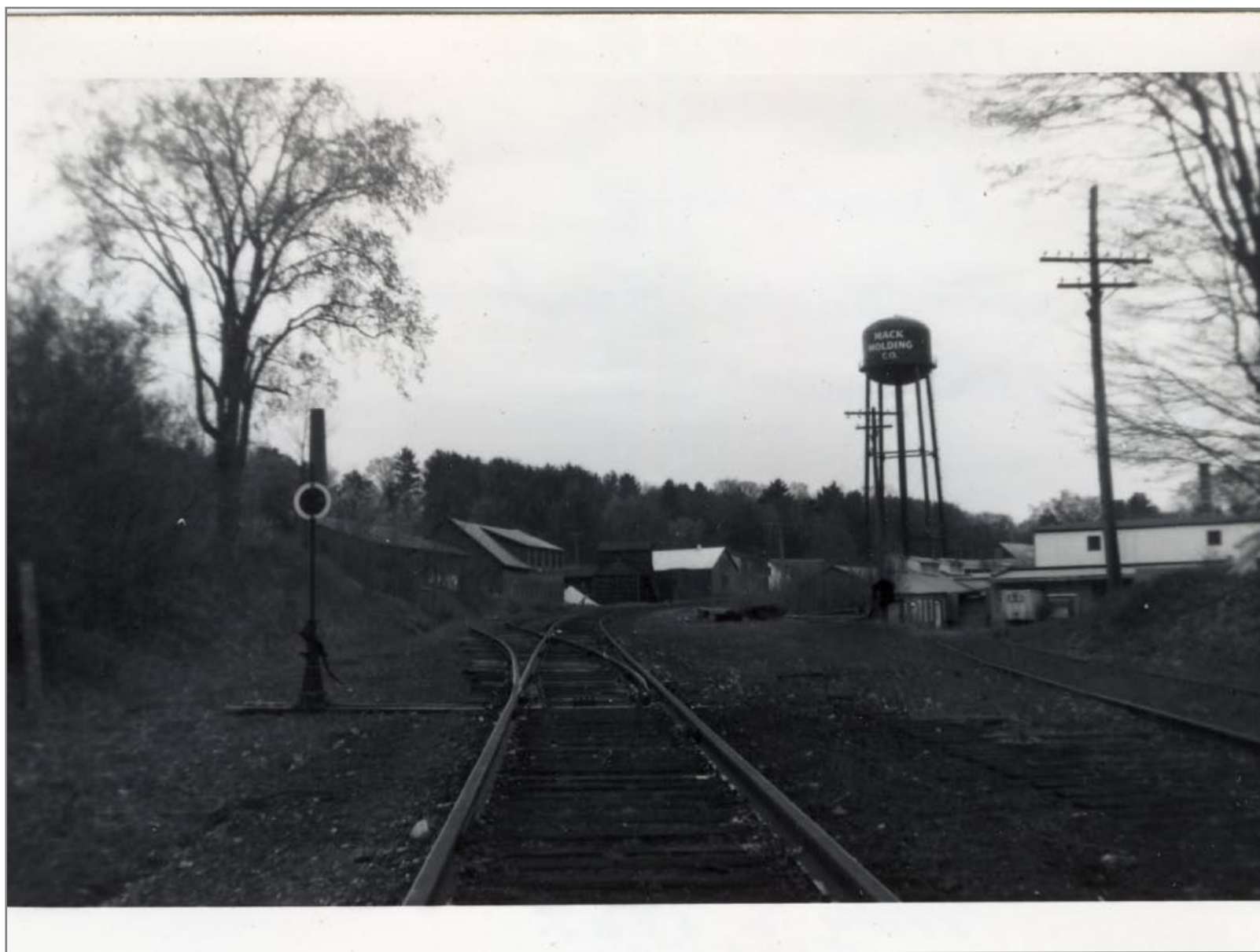
Looking Southbound into Arlington Yard 5/6/1962