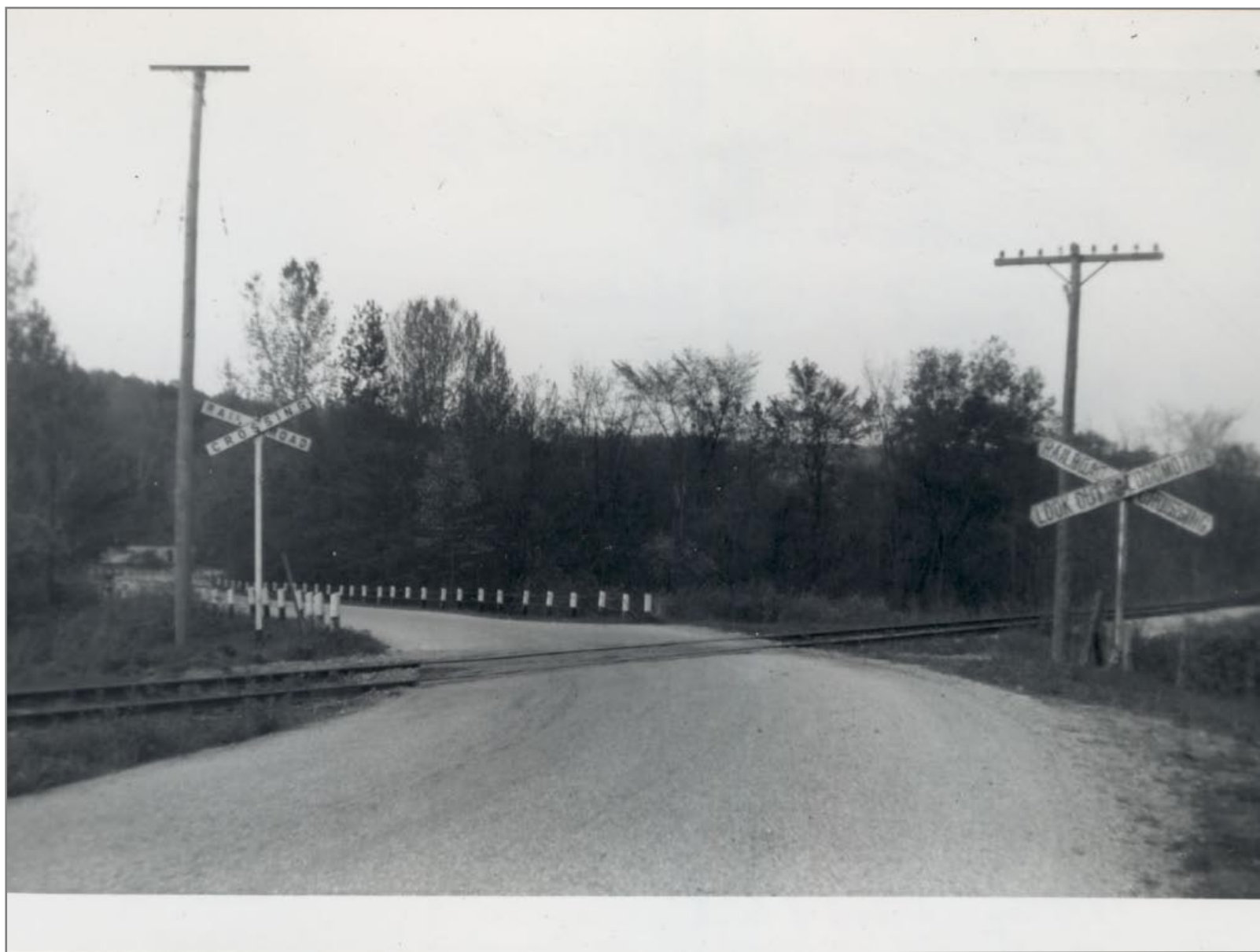
1st Crossing North of Sunderland 5/191/962