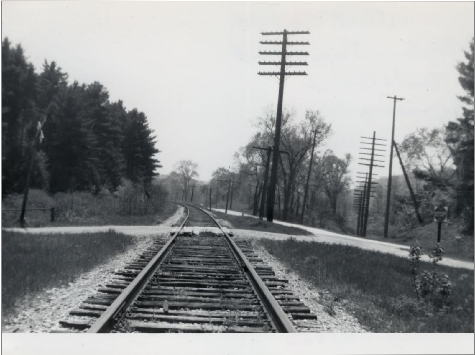
Southbound Near MP # 16 5/19/1962