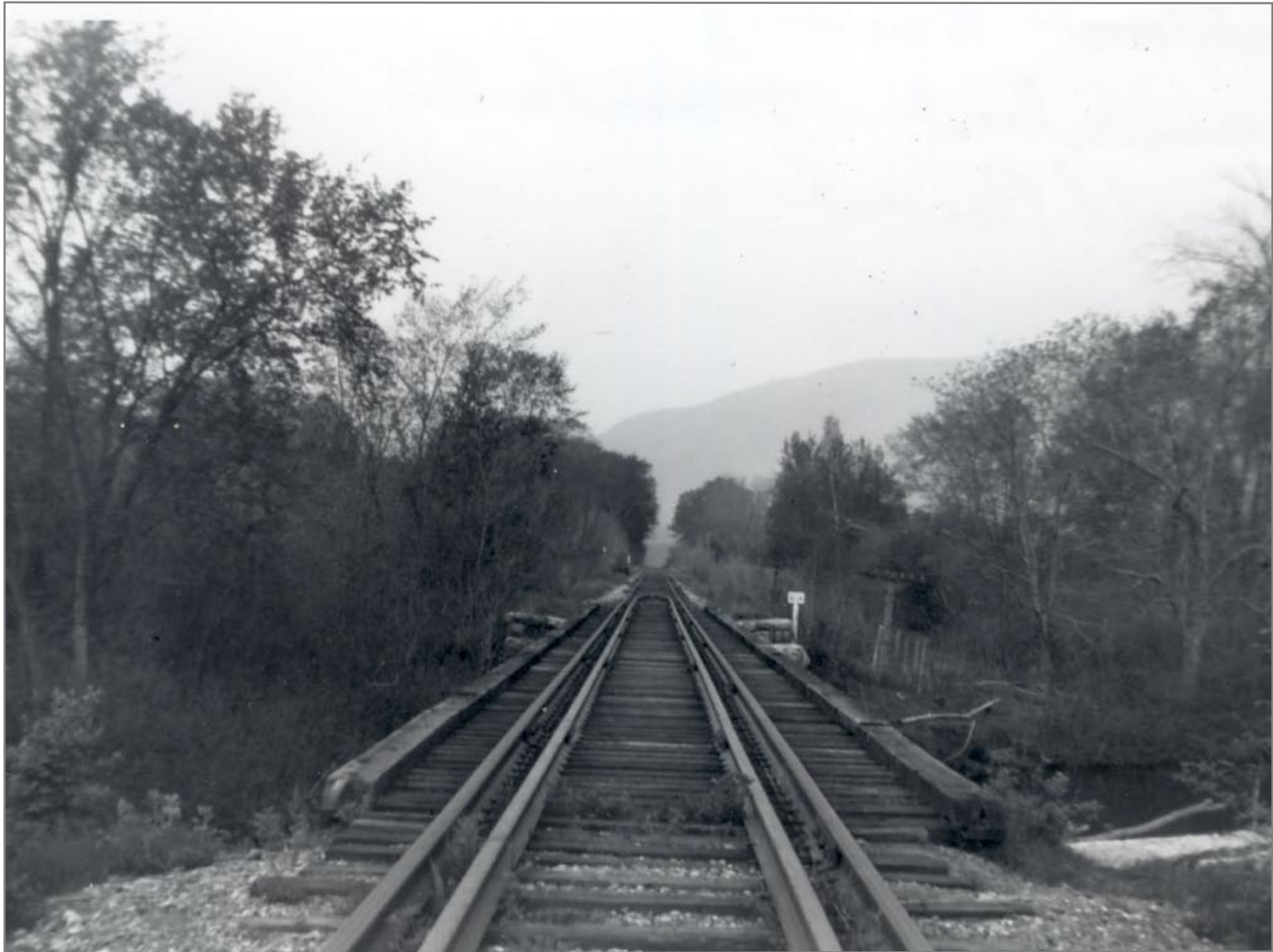
Bridge 64 Southbound 5/19/1962