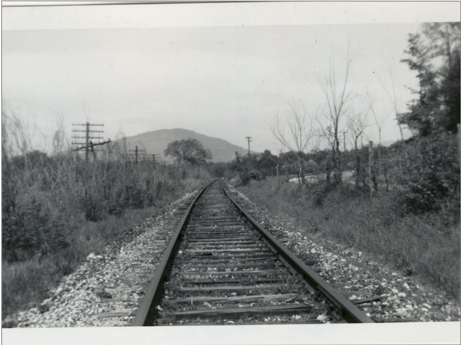
Northbound toward Manchester 5/20/1962