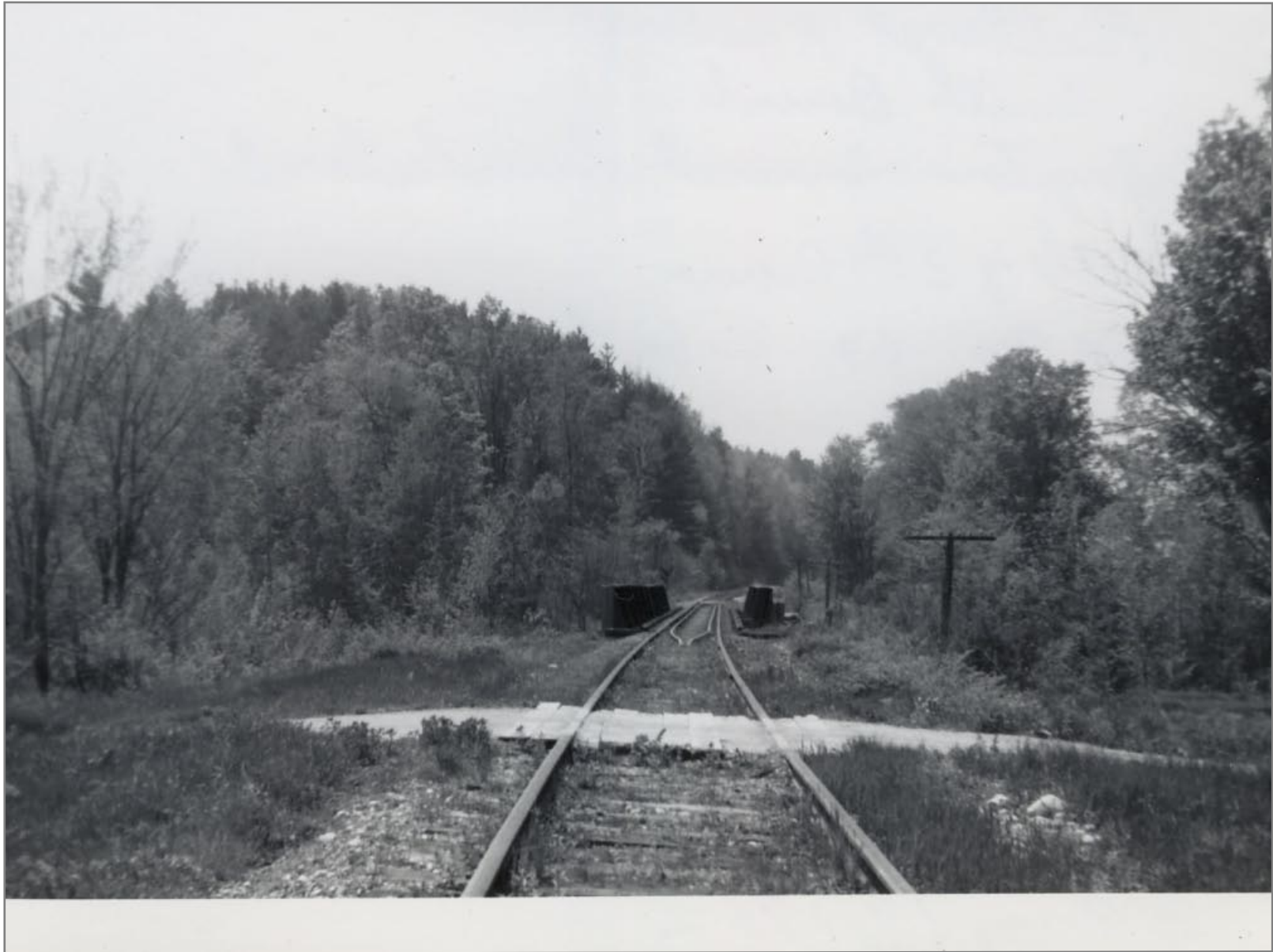
Southbund Looking @ Bridge #62 5/19/1962