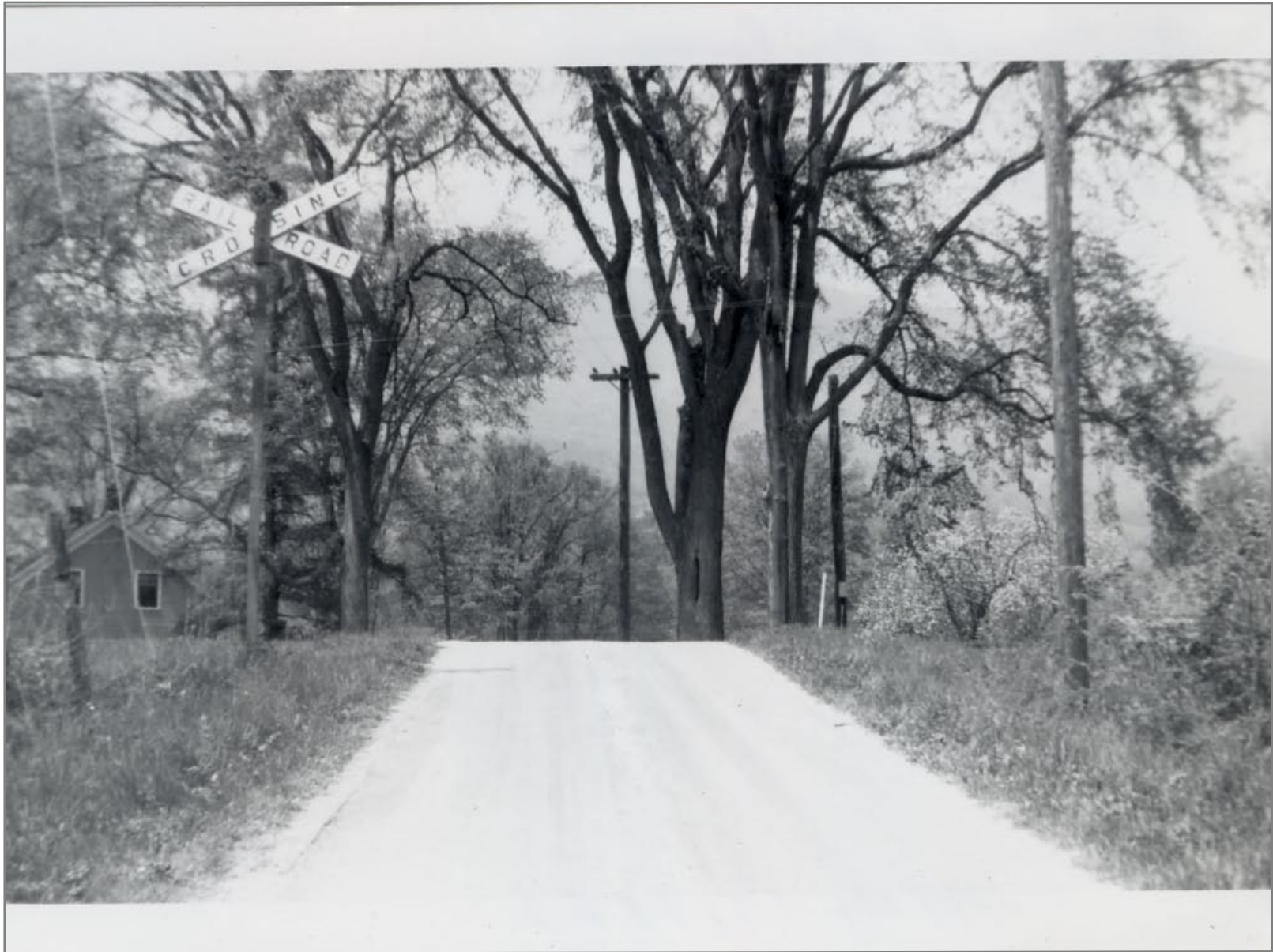
Road Crossing Near MP # 15 Looking West 5/19/1962