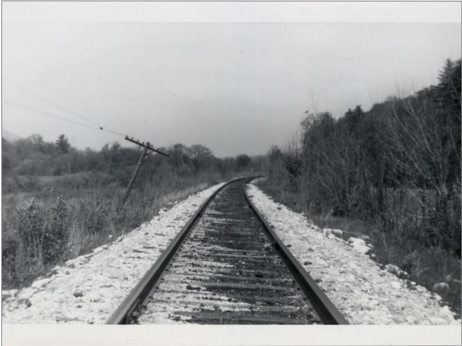
Northbound Near MP #16 5/19/1962