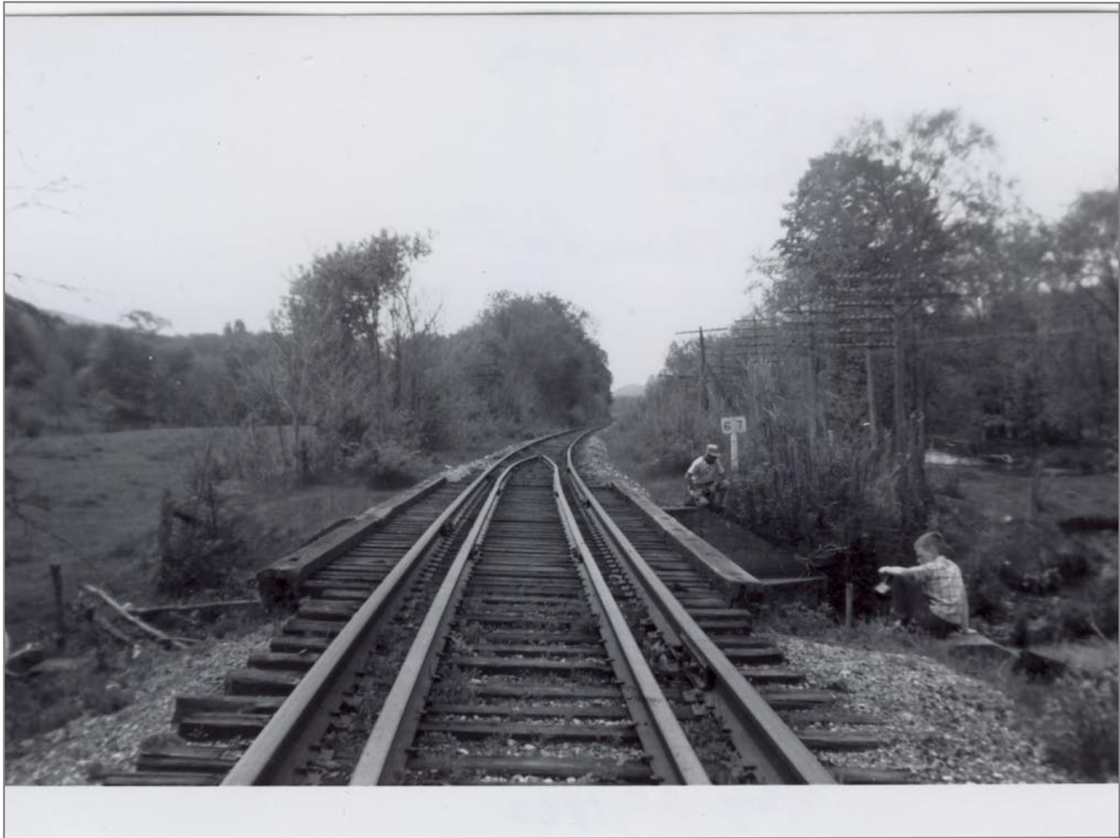
Bridge 67 Southbound 5/20/1962