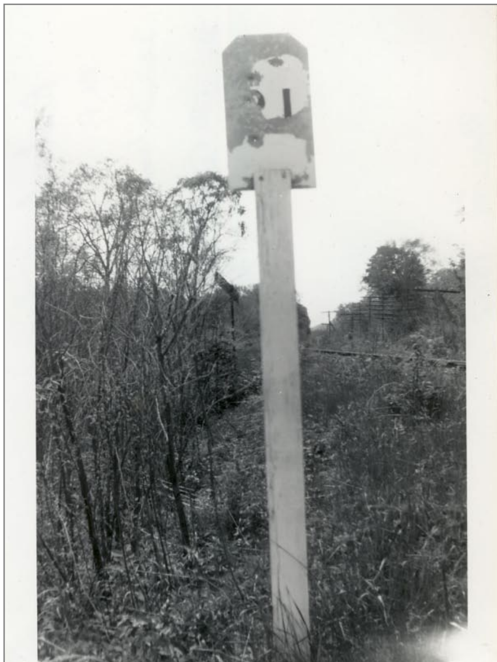
MP #21 South of Manchester 5/20/1962