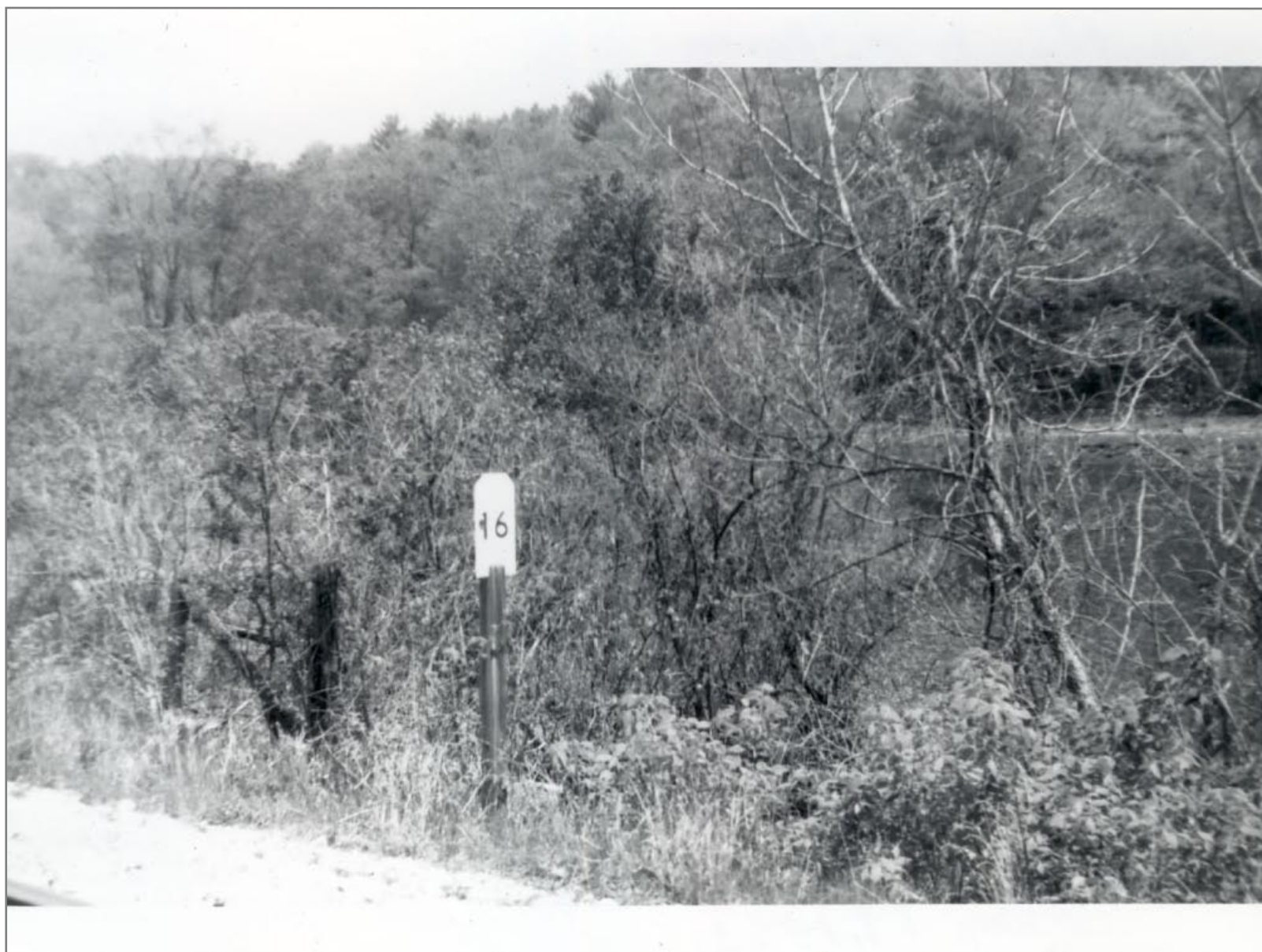
MP 16 5/19/1962