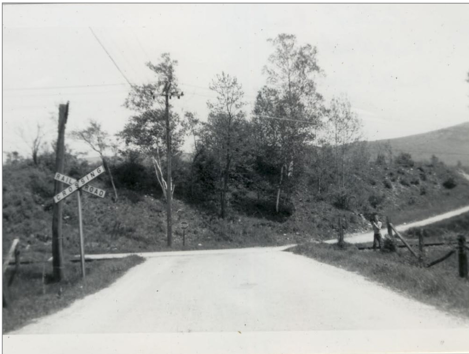
Looking East @ Crossing 5/20/1962