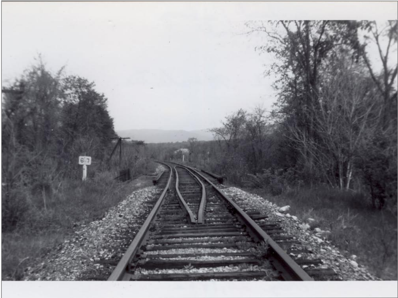
Bridge 67 Northbound 5/20/1962