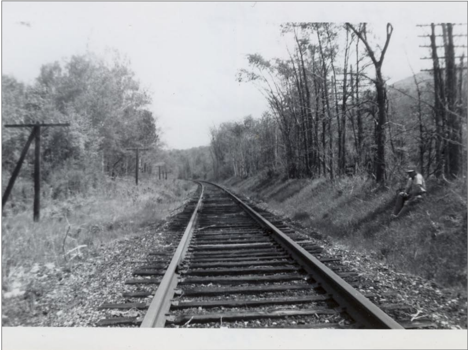
Northbound Between MP 19 & 20 5/20/1962