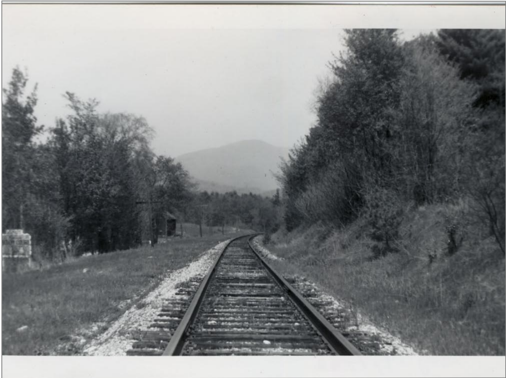
Northbound at Beginning of 4th Curve Out of Arlington 5/19/1962