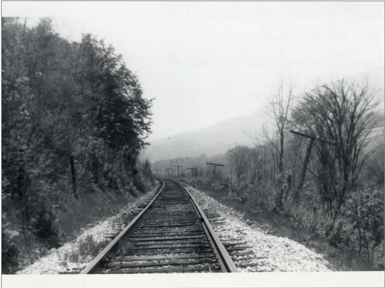
Southbound Near Sunderland 5/19/1962