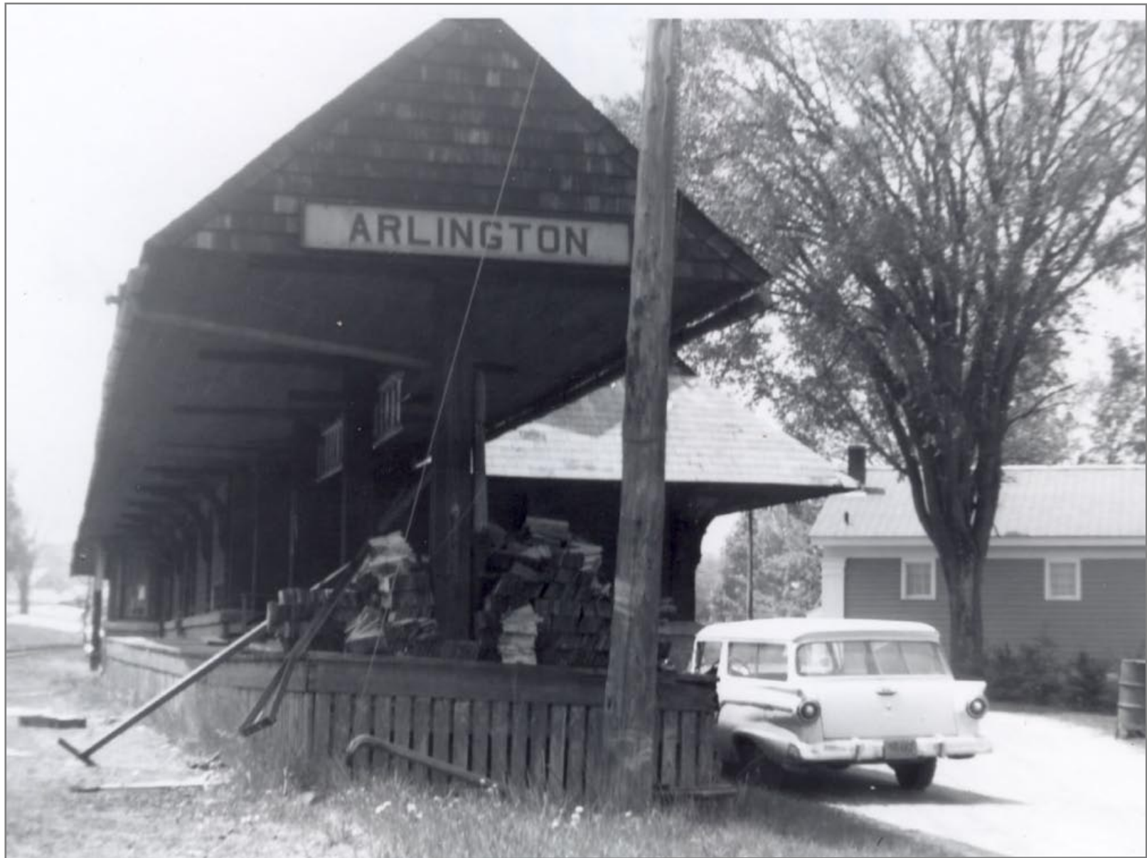
Arlington Southbound 5/19/1962