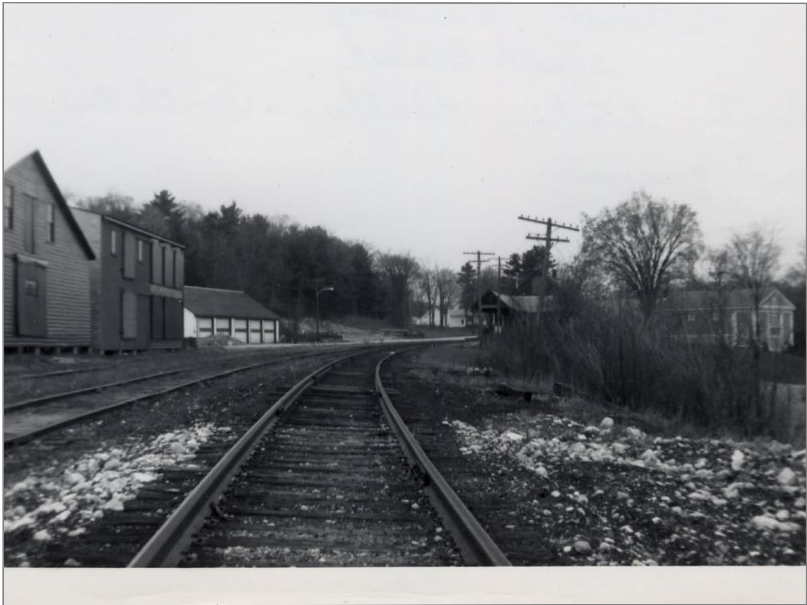
Arlington Looking Southbound - Station on Far Right 5/6/1962