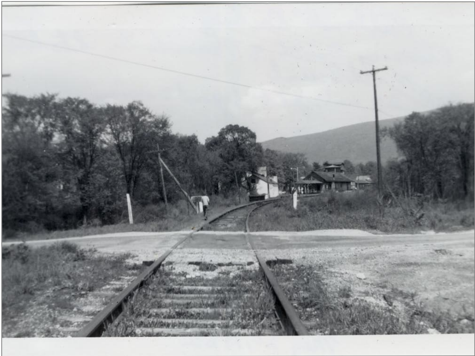
Looking Northbound at Manchester Station 5/20/1962