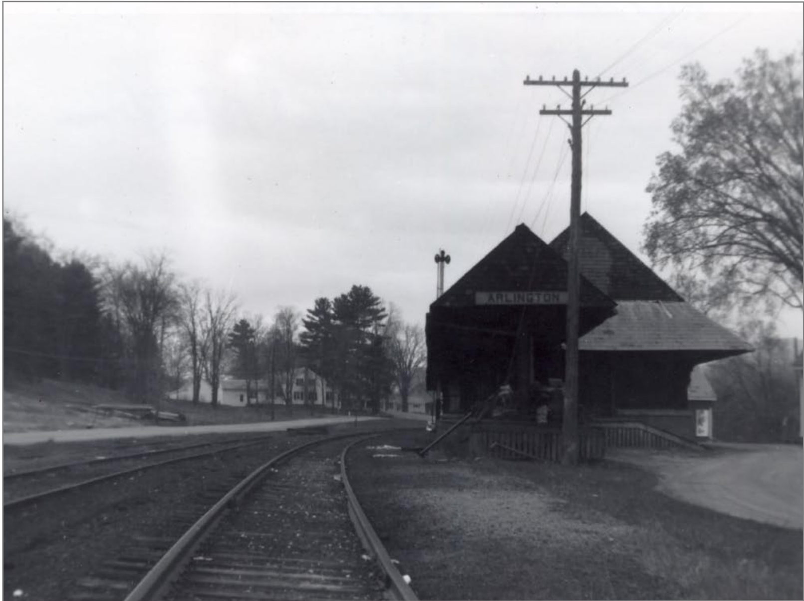
Arlington Station looking South 4/29/1962