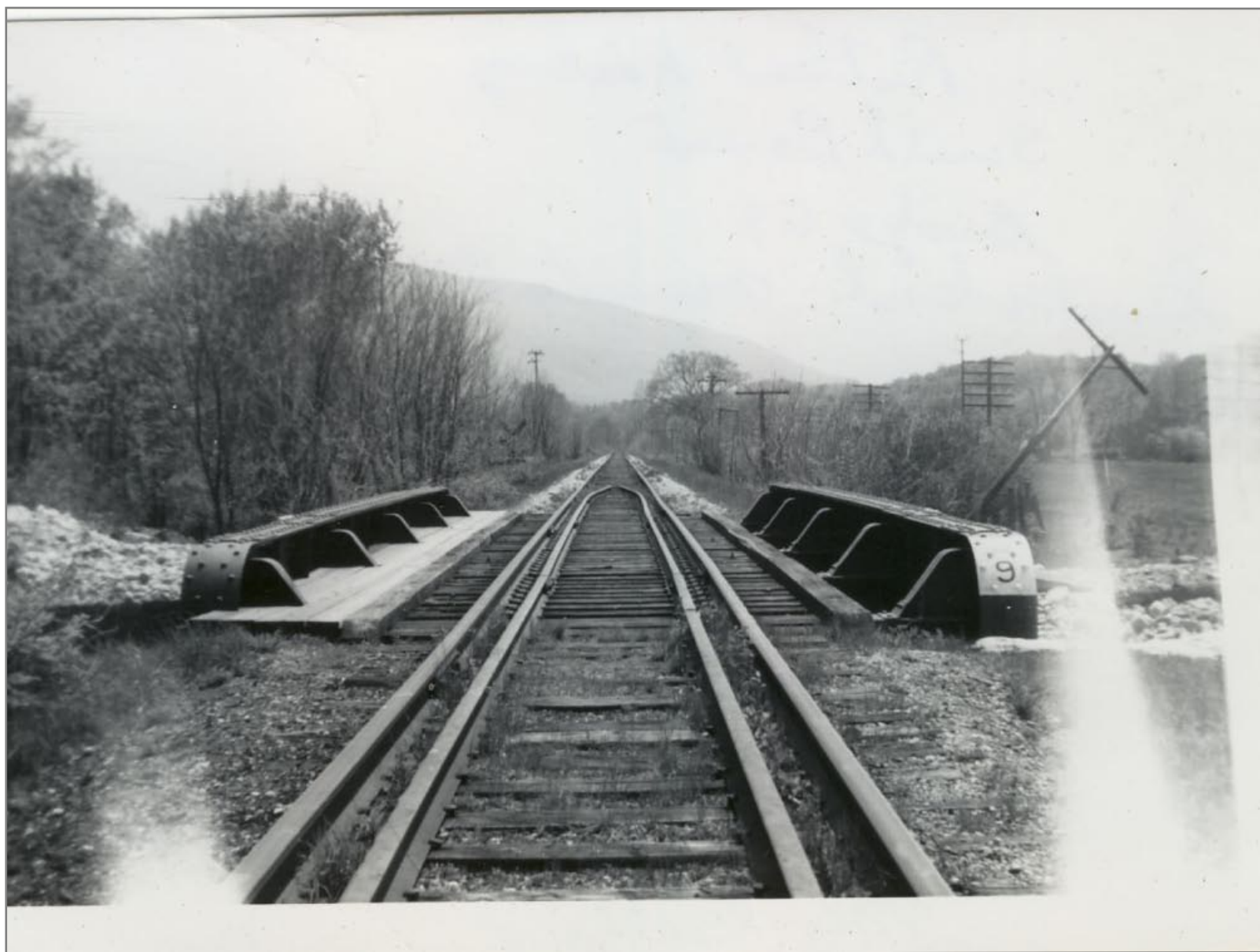
Bridge 69 American Bridge Company 1903 - 5/20/1962