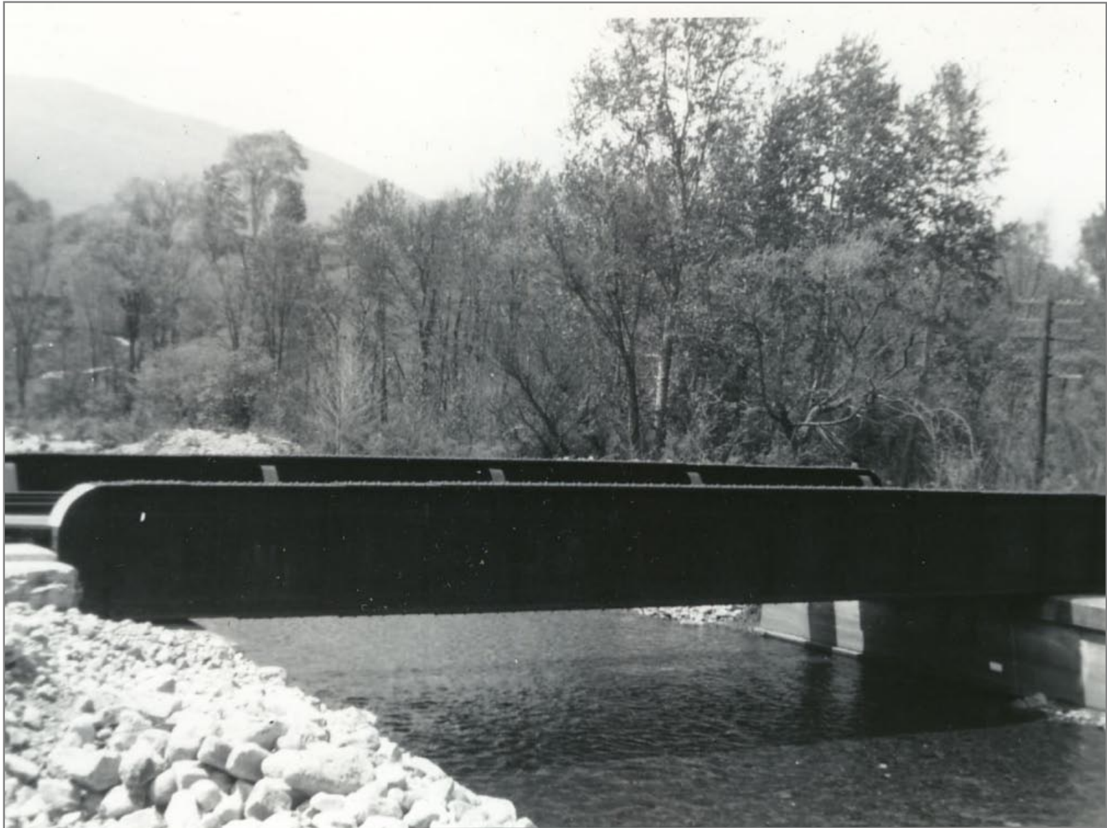
Bridge 69 Looking West 5/20/1962