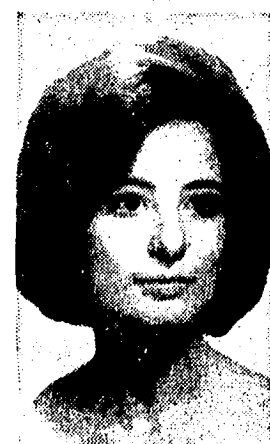
AN AUG. 19 WEDDING