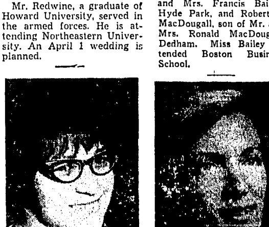
A JUNE 24 WEDDING