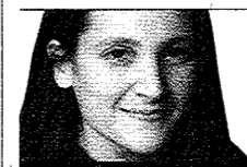
Chrystia Freeland THE A-TRAIN

Last year's charity auction to benefit the Robin Hood Foundation for poor boys and girls became an emblem of American plutocracy when Tom Wolfe chronicled the extravaganza in Portfolio , the Condé Nast business glossy launched this month to report on the new gilded age. Wolfe described the foundation as being "heavy, heavy, heavily supported" by hedge fund managers, and breathlessly tallied the evening's total take at "an astounding $48m". This year's Robin Hood auction, held a few weeks ago, raised $71m, according to The New York Times .