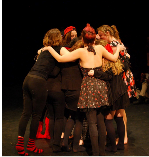
Actors huddle during the BTVM performance.

It was after this second production that a question arose: should TVM be done again next year? Following a successful production in February 2015, students were approaching the work with gratitude but also strong criticism. The Western, white savior narratives and biological essentialism of the script was grating intersectional feminists who expected more from a play that claims to empower and liberate, and the idea that saying "vagina" over 100 times in one night