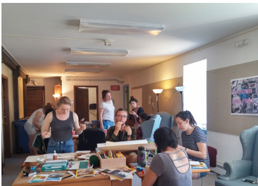
Students working hard at zine festival.