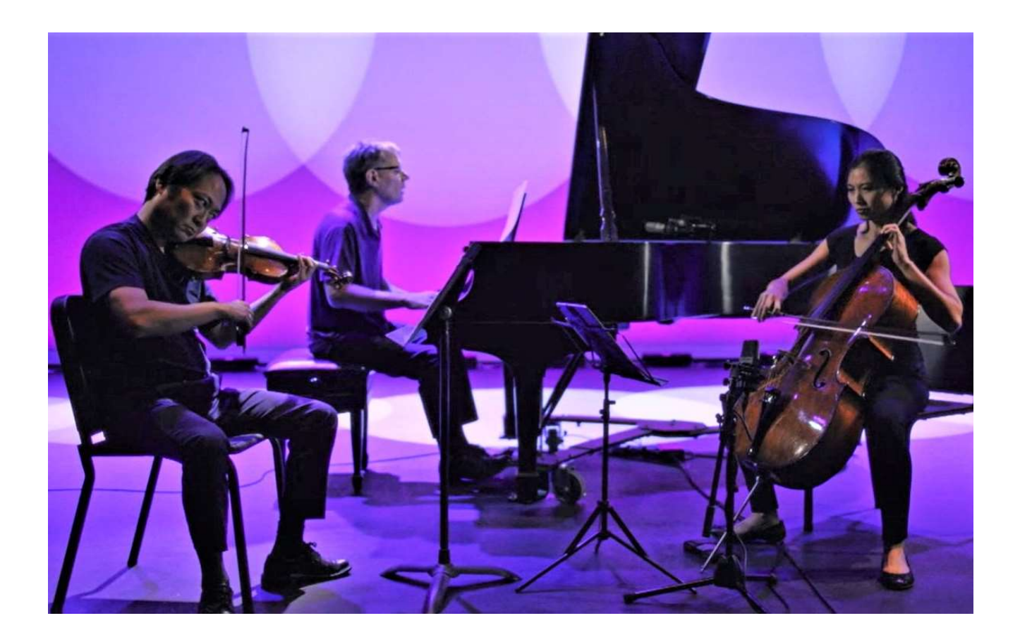
FRIDAY, APRIL 21, 2023 MAHANEY ARTS CENTER, ROBISON HALL