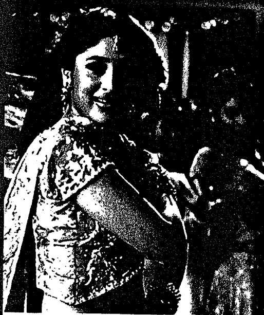
Kabhi Khushi Khabhie Gham

and on its own terms. The last few years have seen a flood of Indian film releases on DVD, aimed primarily at Indian viewers outside the Motherland, but accessible to the Hindi-impaired because almost all are subtitled in English.