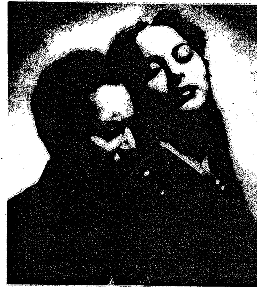
All scenes from Kaagaz Ke Phool

But as global commerce closed a door, it opened a window. Over the past several years, a number of key historical titles—prime specimens of Bollywood's consensual Golden Age, roughly the Fifties—have become accessible on DVD. The result has been a revelation. No longer is it necessary to extrapolate from shoddy pirated videotapes, indifferently subtitled and brutally cropped, in order to experience Hindi commercial cinema in its prime. Viewed in a reasonable approximation of their original state, films like