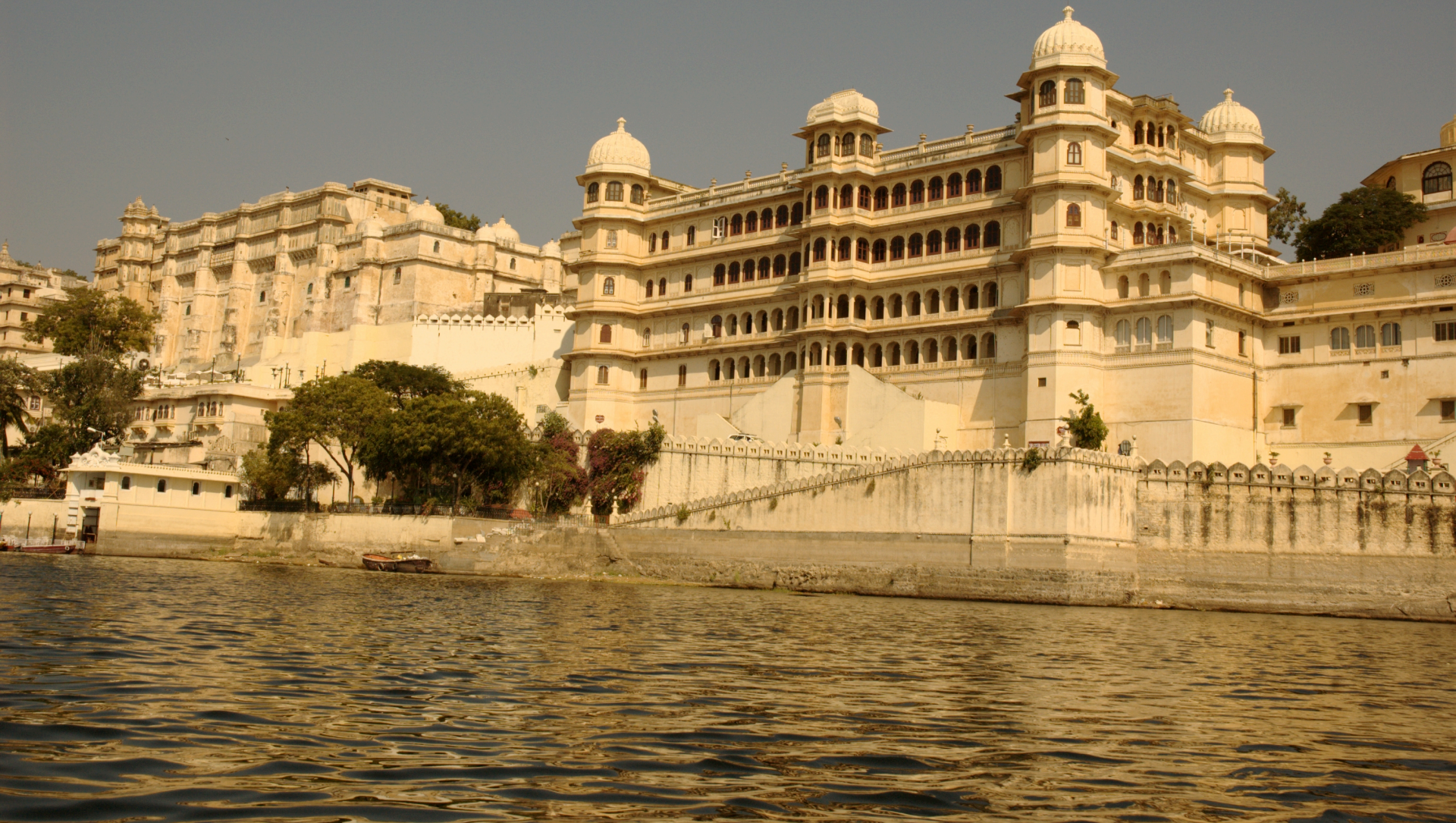
City Palace, Udaipur, Mewar, Rajasthan, begun 1559