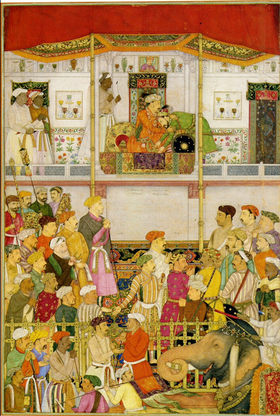
Jahangir receives Prince Khurram on his tetrun from the Mewar campaign., Ajmer Diwan-i-Amm, 20 February 1615 Folio 43B of the Padshanama , painted by Balchand, ca.1635