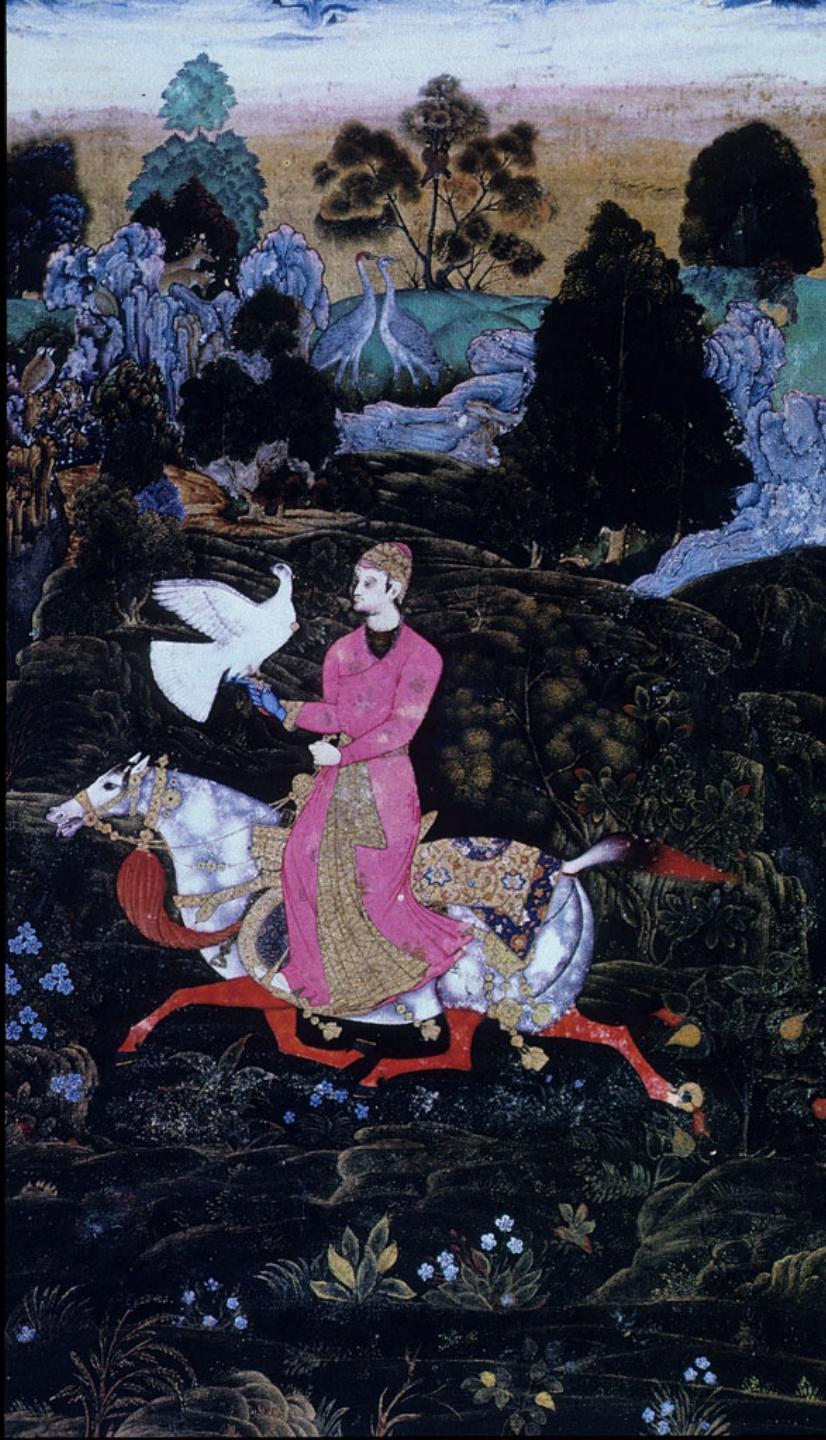
Ibrahim Adil Shah II Hawking, ca. 1598-1600, Bijapur