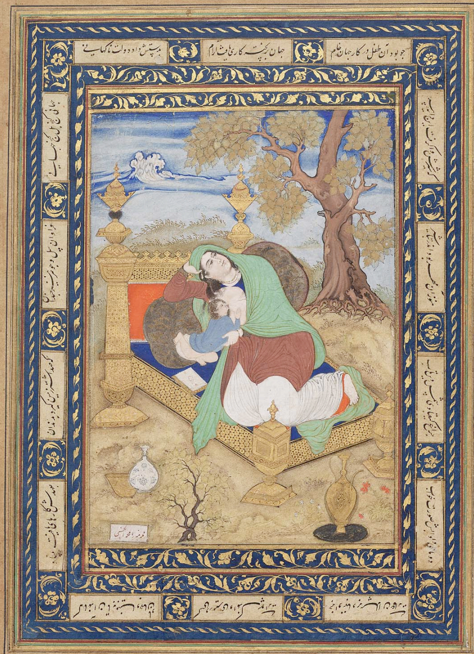
Mirza Muhammad al-Hasani, Mother and Child Reclining , Golconda, Deccan, early 17 th c. opaque watercolor and gold on paper (11-5/8 x 8-1/2")