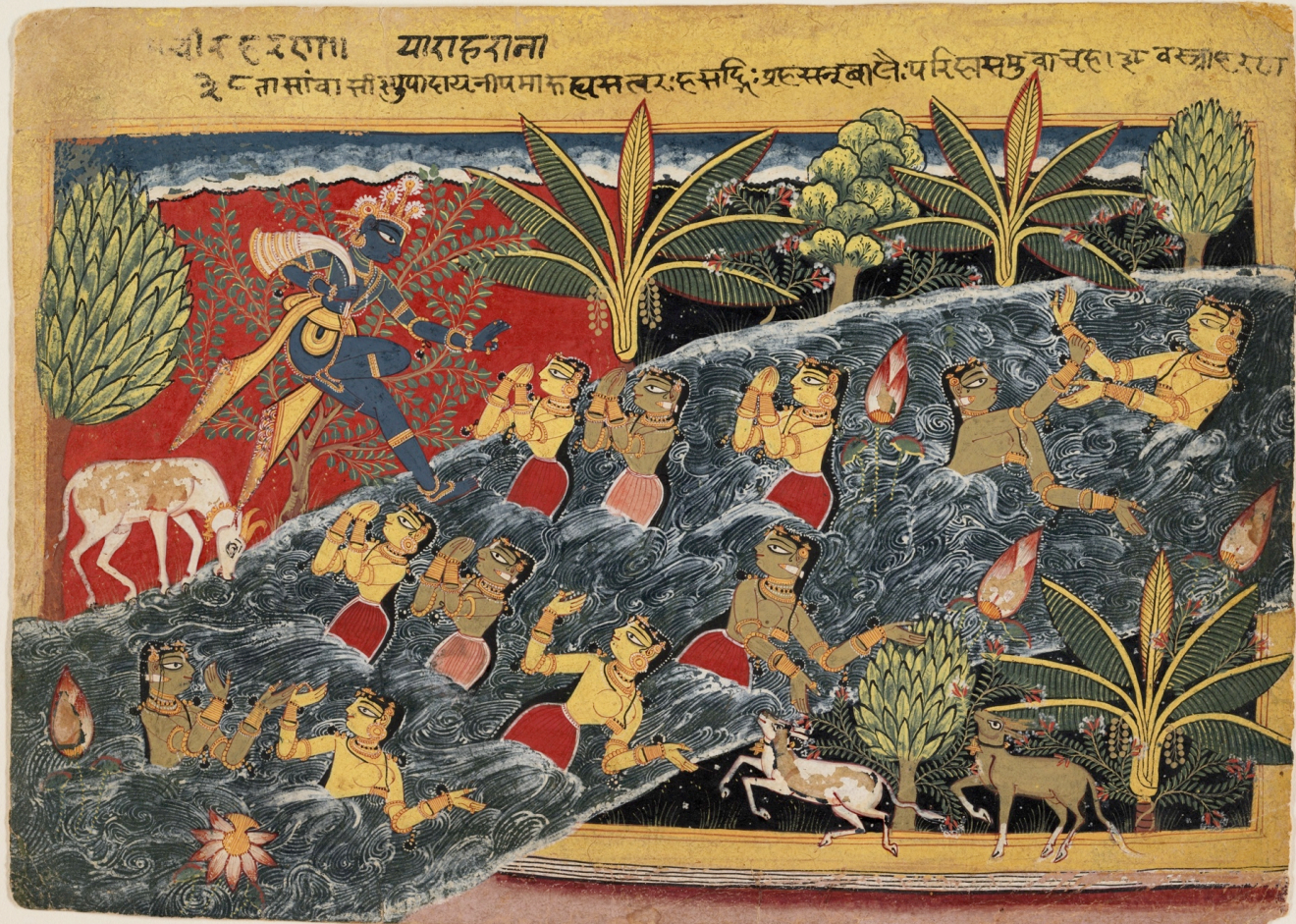
The gopis plead with Krishna to return their clothing: from the "Isarda" Bhagavata Purana , Delhi-Agra area, North India, ca.1560-65, 7-9/16 x 10-1/8 in.