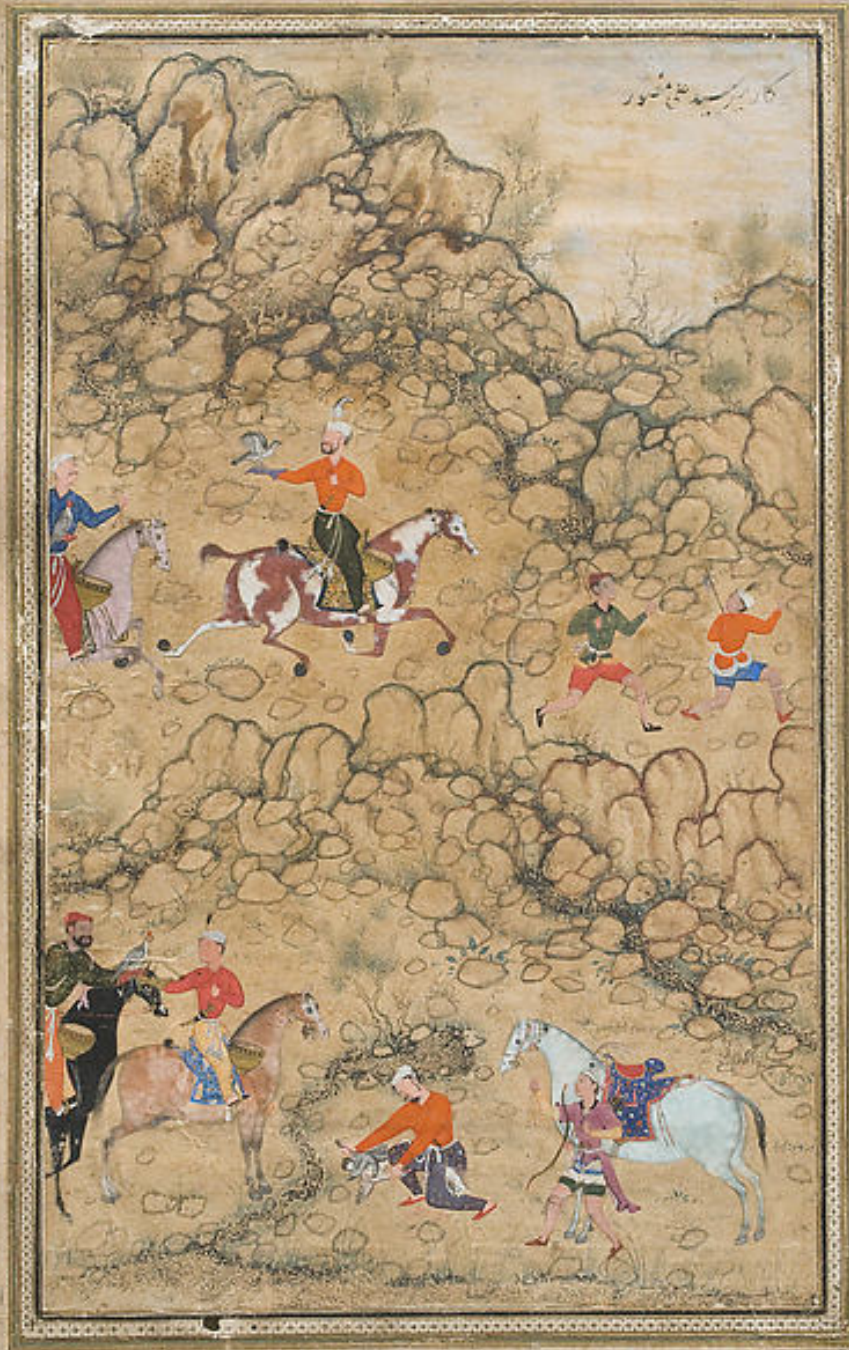
Prince Akbar and Noblemen Hawking, Probably Accompanied by His Guardian Bairam Khan. Attributed to 'Abd al- Samad (Iranian, Shiraz ca. 1505/15–ca. 1600 ), Assigned to Mir Sayyid Ali ca. 1555–58 India (Mughal court at Delhi) Opaque watercolor and ink on paper