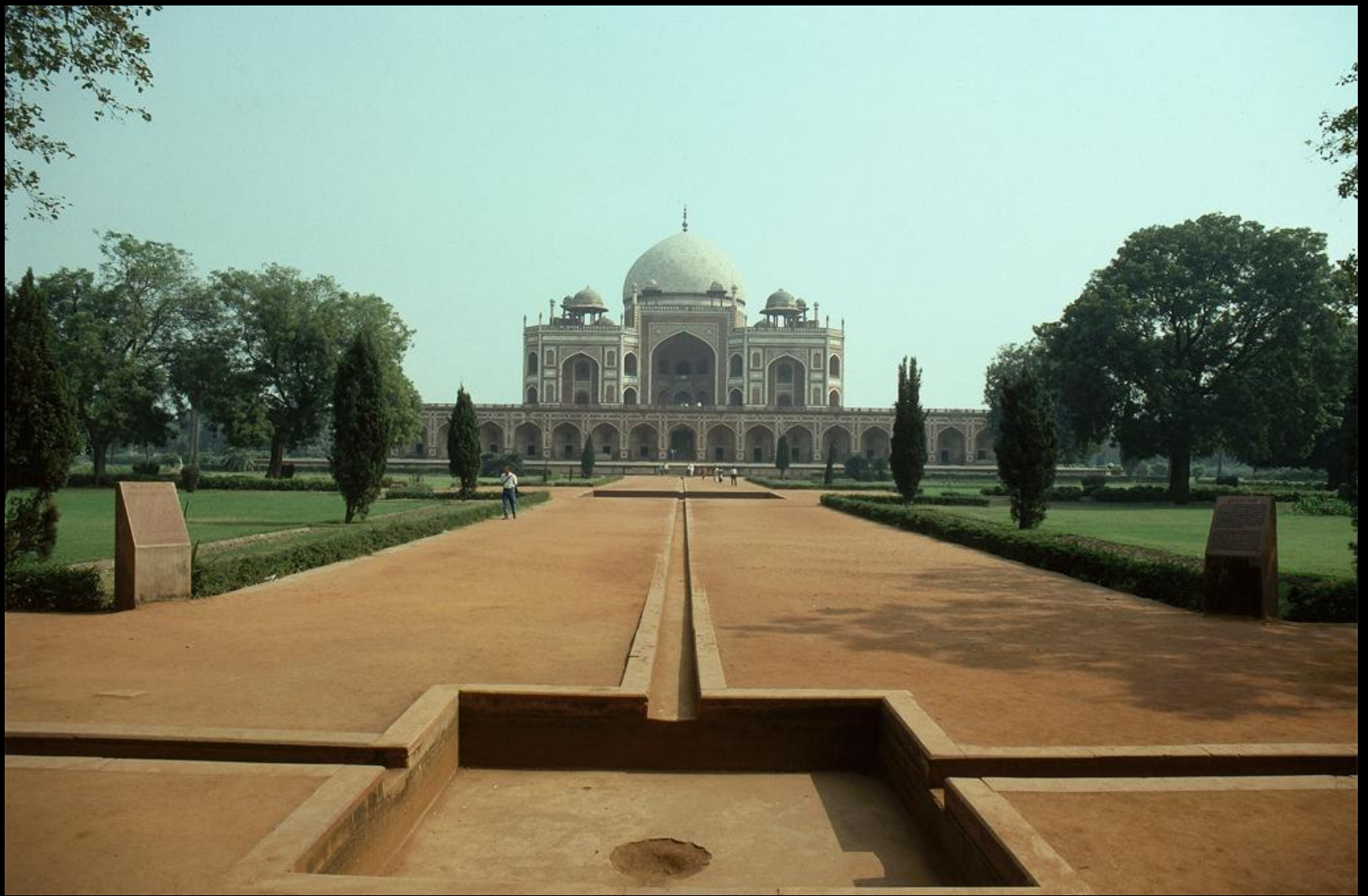
Humayun's tomb, Delhi, 1571