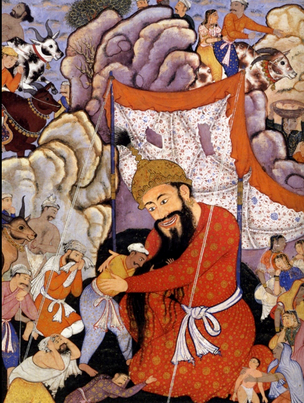
Zumurrud Shah Reaches the Foot of a Huge Mountain and is Joined by Ra'im Blood Drinker and Shining Ruby, Hamzanama