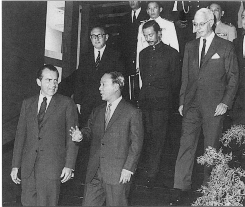
Presidents Nixon and Thieu descend the steps of Saigon's Independence Palace prior to their appearance before the capital city's press corps. Behind them from the left, are Special Advisor to President Nixon Henry Kissinger, South Vietnamese Vice President Ngyuen Cao Ky, and U.S. Ambassador to Vietnam Ellsworth Bunker. President Nixon made an unannounced five-hour visit to South Vietnam (no date given).