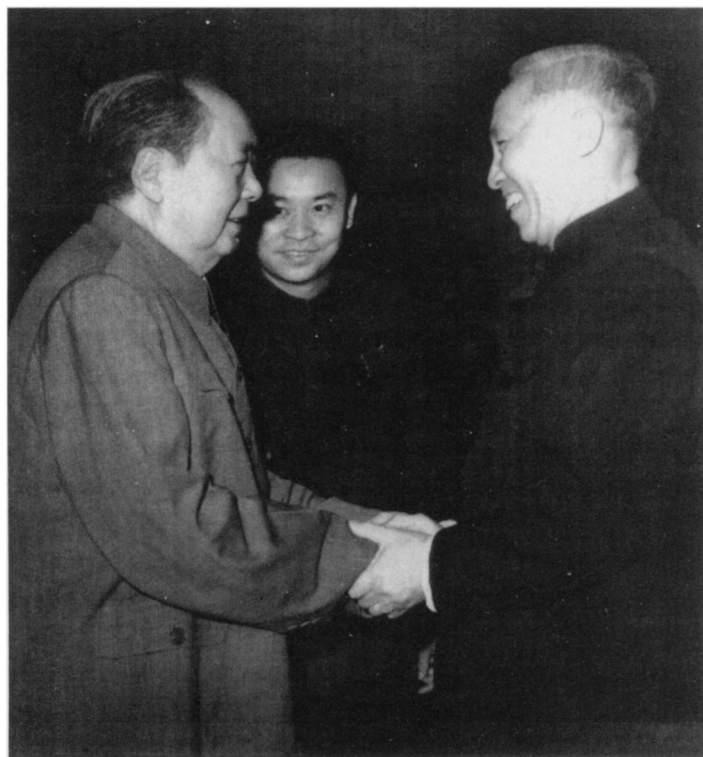
Mao Zedong, leader of the People's Republic of China, shakes hands with Le Duc Tho, special adviser to the North Vietnamese delegation to the Paris peace talks, at Chungnanhai (Peking) as North Vietnamese foreign minister Nguyen Duy Trinh looks on. February 2, 1973.

The cold war worked to North Vietnam's advantage in other ways. Up to 1964, both of the major Communist powers had been consummate pragmatists, neither hindering nor in any major way assisting North Vietnam's efforts to "liberate" the South, but U.S. escalation forced them to make hard choices. Bitter rivals and now vigorously competing for leadership of world communism, each felt compelled to assist an embattled ally, and Hanoi skillfully exploited their rivalry by extracting maximum assistance from each while scrupulously controlling its own destiny. The Soviets provided the modern fighter planes and surface-to-air missiles (SAMs) to fend off the American bombing, and Soviet technicians manned anti-aircraft batteries and SAM sites. The Chinese provided huge quantities of small arms, vehicles, and food. More than 300,000 Chinese troops helped maintain the vital supply route from China. Total Soviet and Chinese aid