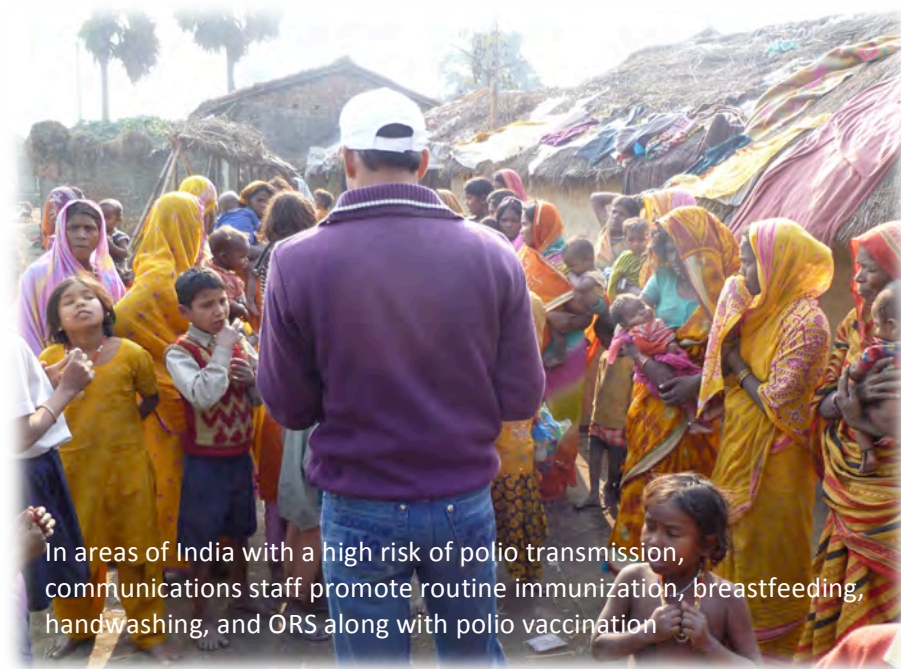
In areas of India with a high risk of polio transmission, communications staff promote routine immunization, breastfeeding, handwashing, and ORS along with polio vaccination

Polio eradication’s communications strategy in India had long included RI messages, but under the 107 Block Plan, much greater attention was given to issues beyond polio vaccination—in the words of one interviewee, it was “polio plus plus plus plus.” Specific, targeted messages included information about diseases prevented by RI, the normal side effects of immunization, and where immunizations were available; the importance of oral rehydration solution in cases of diarrhea and how to prepare it; instructions to feed colostrum to infants and to exclusively breastfeed for six months; and to wash hands with soap at specific times throughout the day.